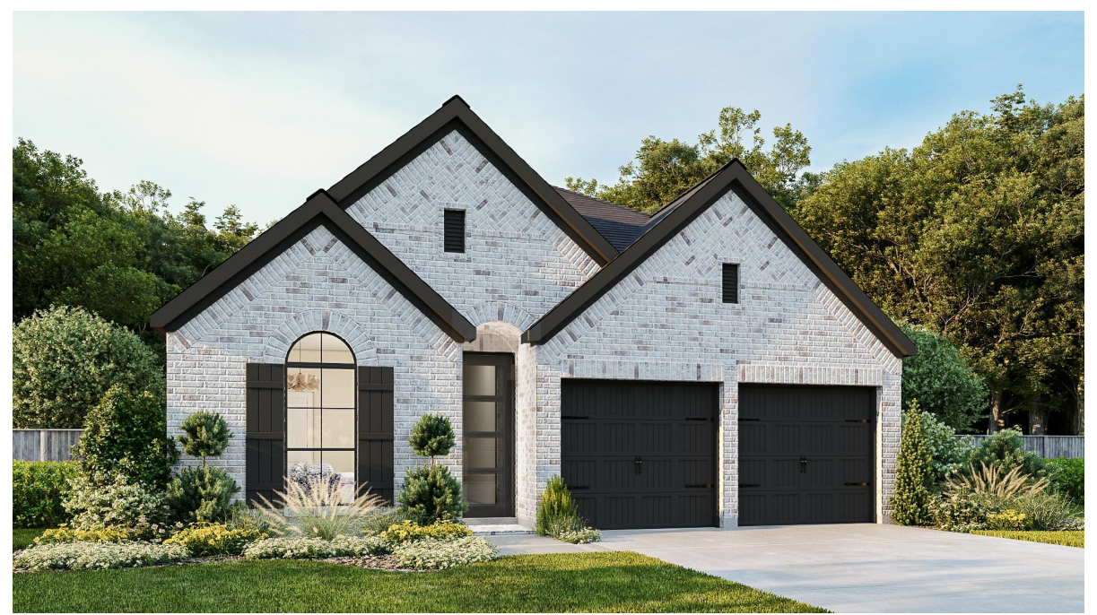
DESIGN 2410W E-1