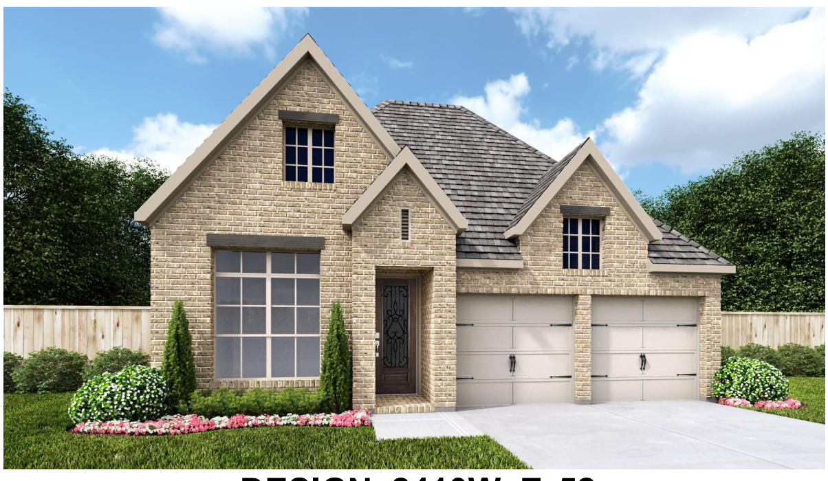
DESIGN 2410W E-52