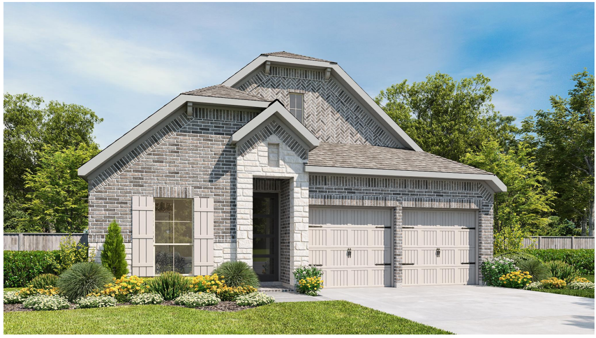
DESIGN 2410W E-31