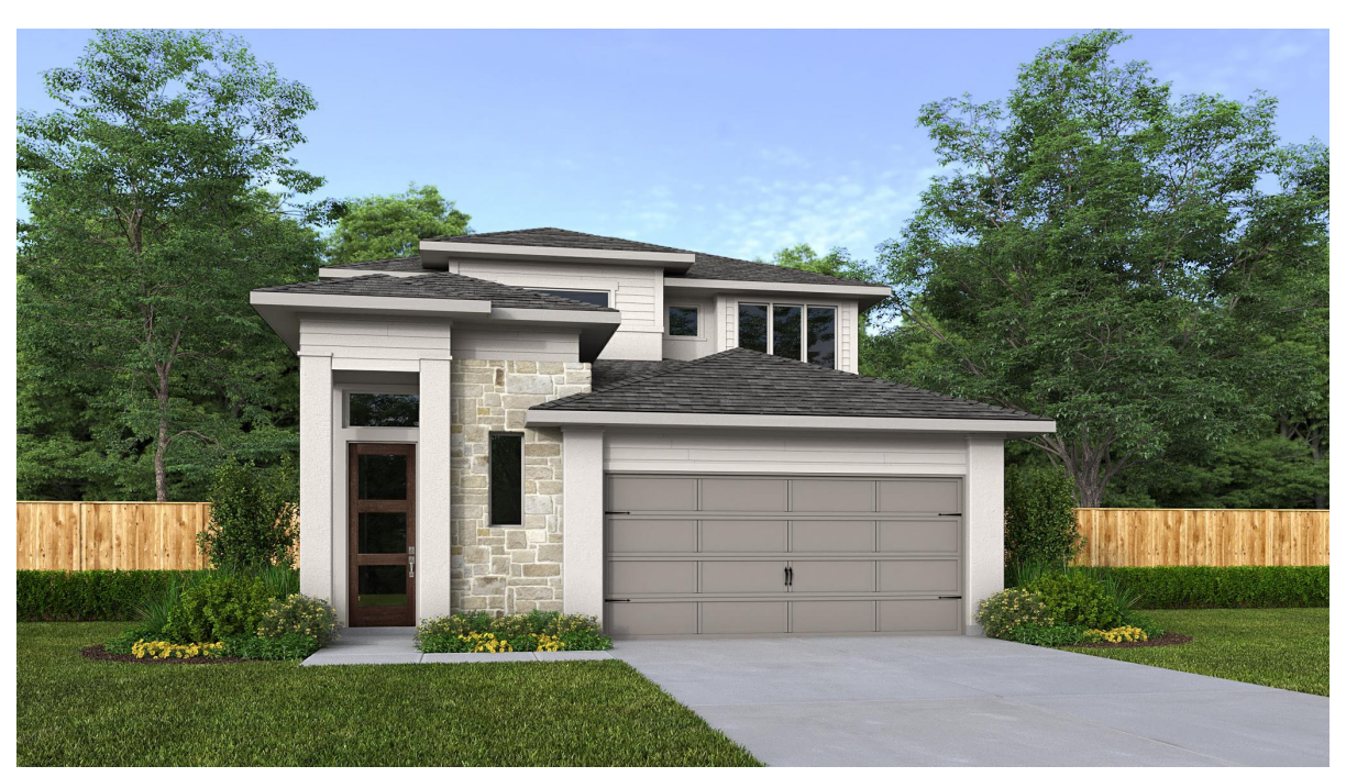
DESIGN 24120 E-70 Includes Stucco Front