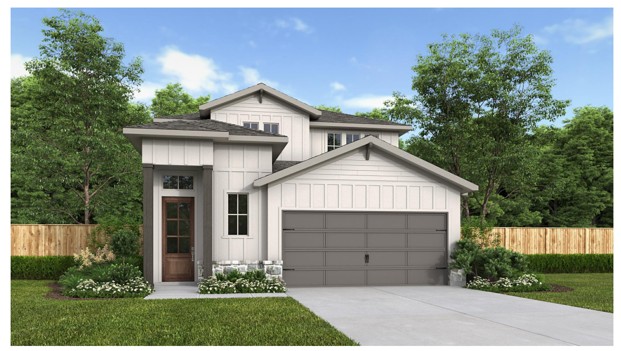
DESIGN 24120 E-1