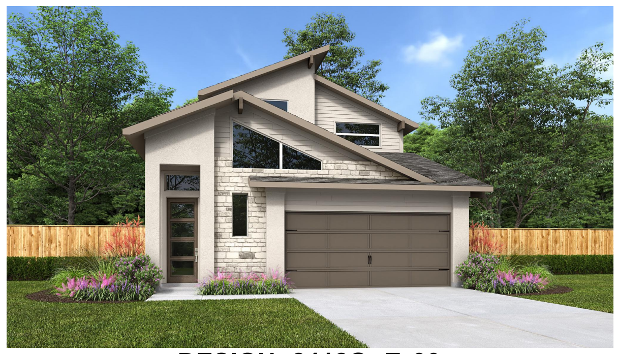
DESIGN 24120 E-90 Includes Stucco Front

This design, as originally designed and prior to any changes you make, is estimated to yield approximately the number of square feet shown on page 1. All dimensions are approximate. Square footage may vary based on as-built dimensions, configurations, plan options and/or the method of calculation. Designs are not-to-scale, and are conceptual illustrations that may differ from construction plans or completed improvements. A design may depict features not available on all homesites or in all communities. Perry Homes reserves the right to make changes in plans and specifications, and to substitute material of similar quality. Prices, terms, promotions, plans, dimensions, features, options, amenities, elevations, designs, square footages, specifications, materials, and availability of homes or communities are subject to change without notice or obligation. All obligations will be governed by a written contract. This design does not constitute a commitment to build a particular floor plan or home in any given community Some floor plans, options, and/or elevations may not be available on certain homesites or in a particular community and may require additional charges. Please check with Perry Homes to verify current offerings in the communities you are considering. This rendering is the property of Perry Homes. LLC. Any reproduction or exhibition is strictly prohibited. © Perry Homes. LLC 2018