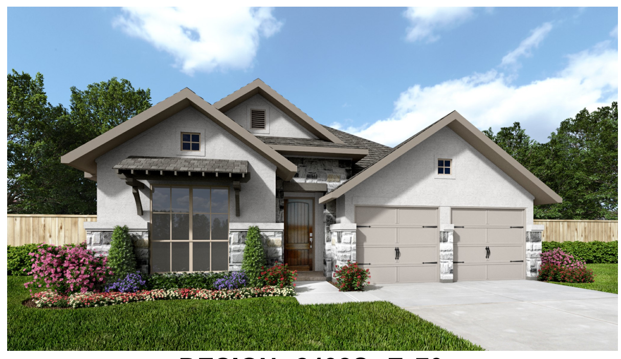
DESIGN 2438S E-70

This design, as originally designed and prior to any changes you make, is estimated to yield approximately the number of square feet shown on page 1. All dimensions are approximate. Square footage may vary based on as-built dimensions, configurations, plan options and/or the method of calculation. Designs are not-to-scale, and are conceptual illustrations that may differ from construction plans or completed improvements. A design may depict features not available on all homesites or in all communities. Perry Homes reserves the right to make changes in plans and specifications, and to substitute material of similar quality. Prices, terms, promotions, plans, dimensions, features, options, amenities, elevations, designs, square footages, specifications, materials, and availability of homes or communities evaluate to change without notice or obligation. All obligations will be governed by a written contract. This design does not constitute a commitment to build a particular floor plan or home in any given community. Some floor plans, options, and/or elevations may not be available on certain homesites or in a particular community and may require additional charges. Please check with Perry Homes to verify current offerings in the communities you are considering. This rendering is the property of Perry Homes. LLC. Any reproduction or exhibition is strictly prohibited. © Perry Homes. LLC 2025