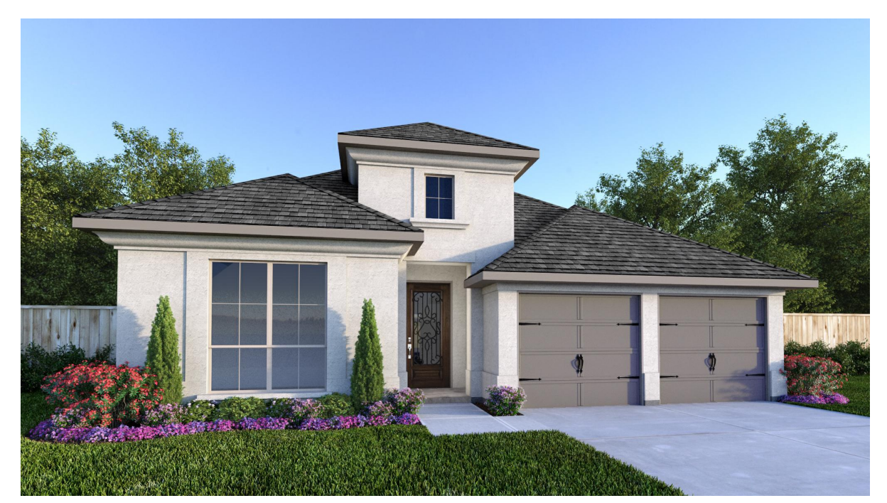
DESIGN 2438S E-1