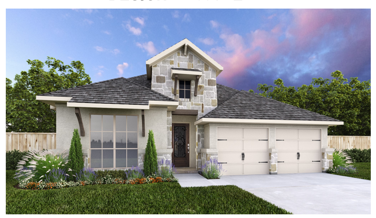
DESIGN 2438S E-50