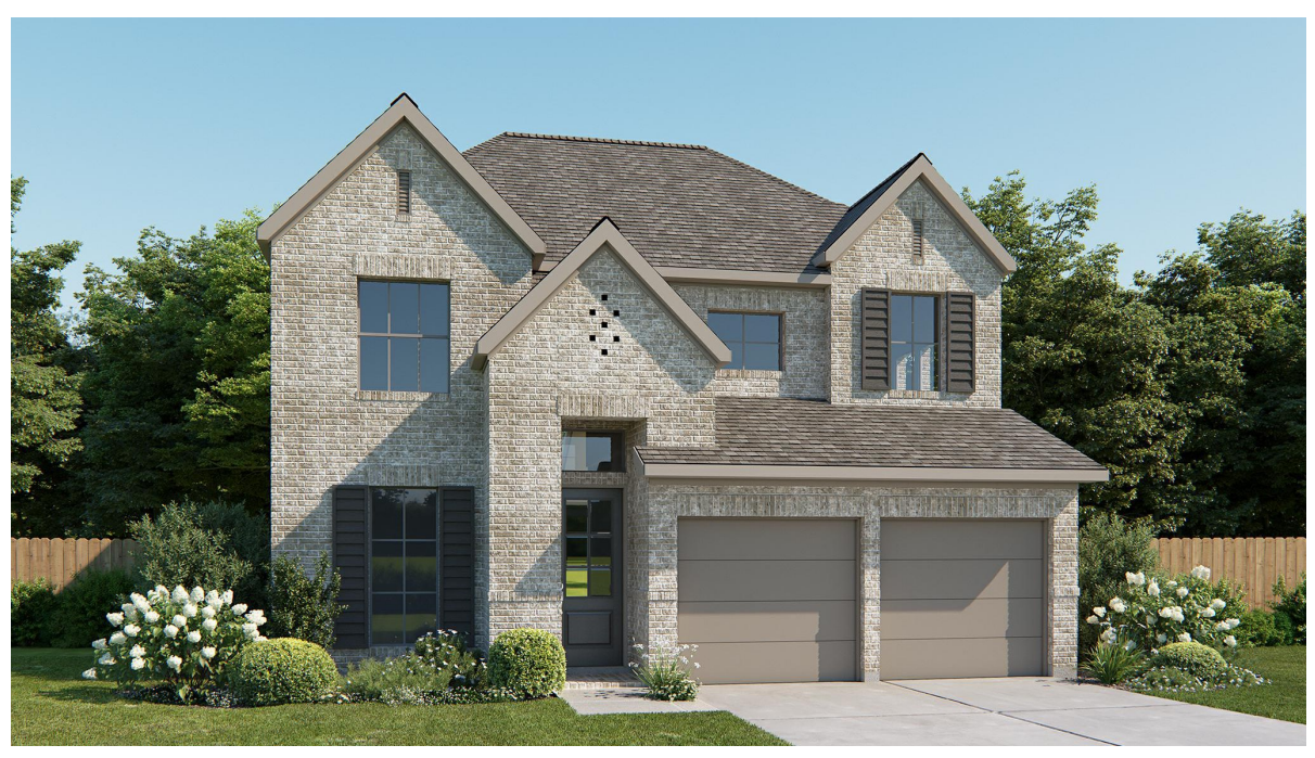
DESIGN 2442W E-35