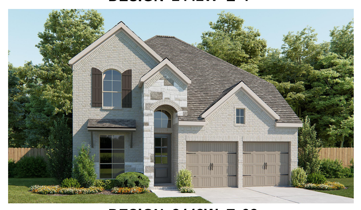
DESIGN 2442W E-32