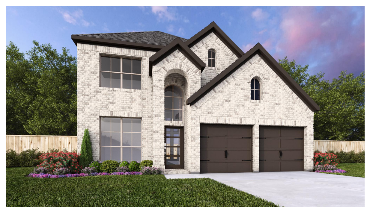
DESIGN 2442W E-1