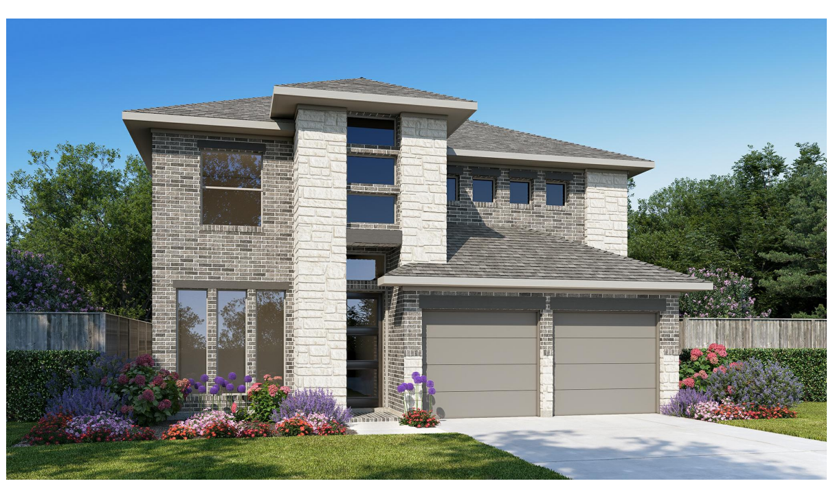
DESIGN 2442W E-50

This design, as originally designed and prior to any changes you make, is estimated to yield approximately the number of square feet shown on page 1. All dimensions are approximate. Square footage may vary based on as-built dimensions, configurations, plan options and/or the method of calculation. Designs are not-to-scale, and are conceptual illustrations that may differ from construction plans or completed improvements. A design may depict features not available on all homesites or in all communities. Perry Homes reserves the right to make changes in plans and specifications, and to substitute material of similar quality. Prices, terms, promotions, plans, dimensions, features, options, amenities, elevations, designs, square footages, specifications, materials, and availability of homes or communities to change without notice or obligation. All obligations will be governed by a written contract. This design does not constitute a commitment to build a particular floor plan or home in any given community. Some floor plans, options, and/or elevations may not be available on certain homesites or in a particular community and may require additional charges. Please check with Perry Homes to verify current offerings in the communities and are considering. This rendering is the property of Perry Homes. LLC. Any reproduction or exhibition is strictly prohibited @ Perry Homes LLC. 2019.