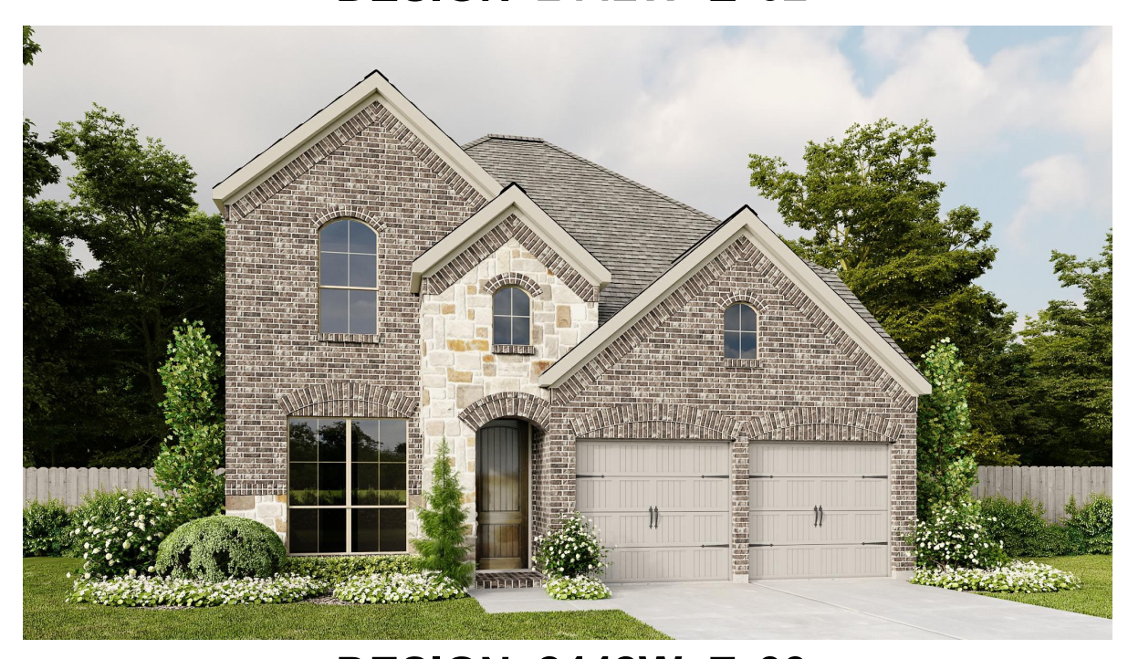
DESIGN 2442W E-33