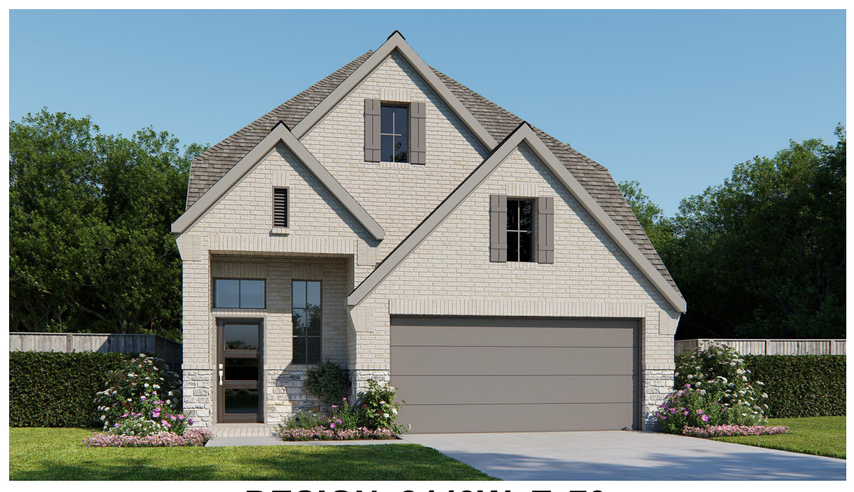
DESIGN 2443W E-70

This design, as originally designed and prior to any changes you make, is estimated to yield approximately the number of square feet shown on page 1. All dimensions are approximate. Square footage may vary based on as-built dimensions, configurations, plan options and/or the method of calculation. Designs are not-to-scale, and are conceptual illustrations that may differ from construction plans or completed improvements. A design may depict features not available on all homesites or in all communities. Perry Homes reserves the right to make changes in plans and specifications, and to substitute material of similar quality. Prices, terms, promotions, plans, dimensions, features, options, amenities, elevations, designs, square footages, specifications, materials, and availability of homes or communities to change without notice or obligation. All obligations will be governed by a written contract. This design does not constitute a commitment to build a particular floor plan or home in any given community. Some floor plans, options, and/or elevations may not be available on certain homesites or in a particular community and may require additional charges. Please check with Perry Homes to verify current offerings in the communities on a green considering. This rendering is the property of Perry Homes. LLC. Any reproduction or exhibition is strictly prohibited @ Perry Homes LLC. 2018