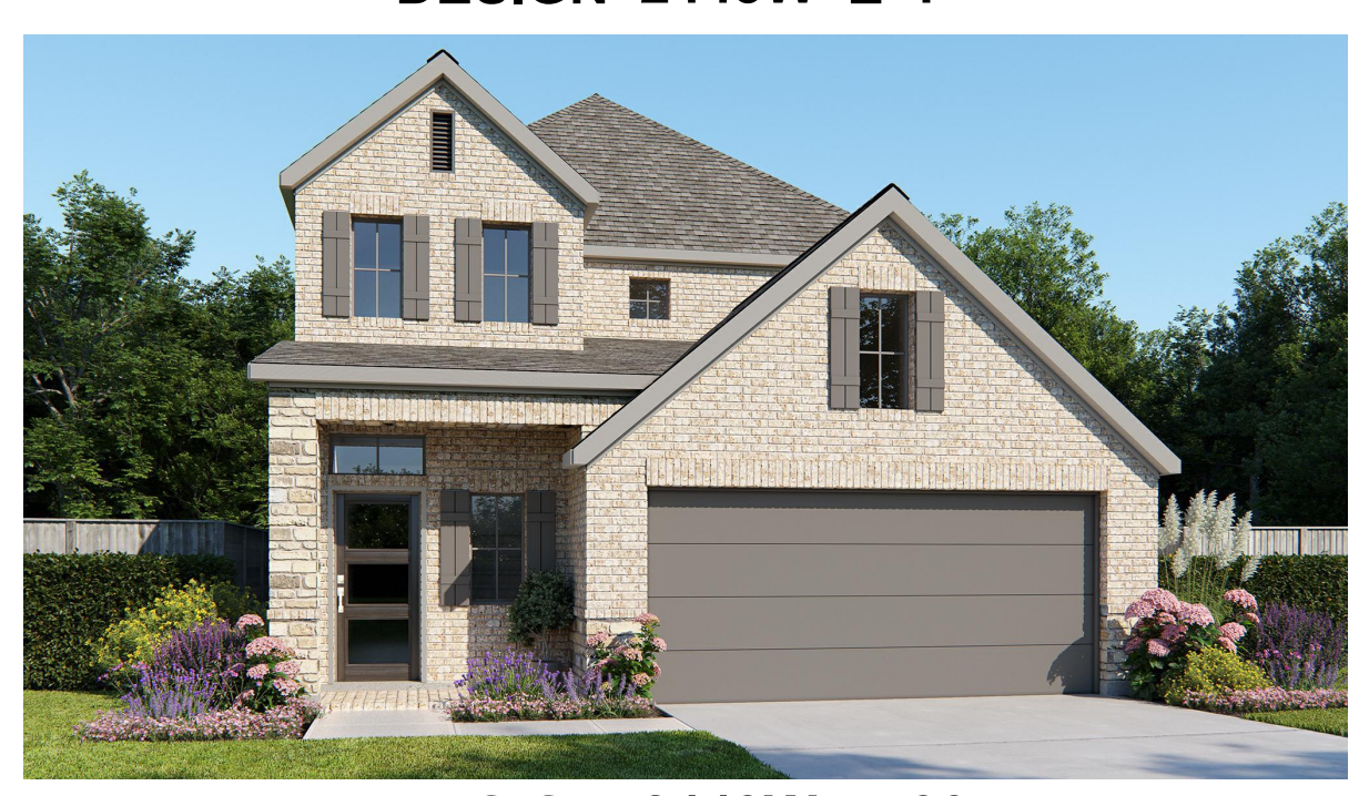
DESIGN 2443W E-30