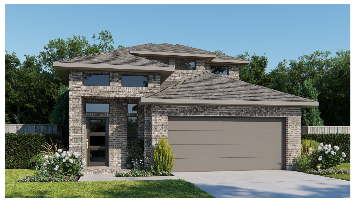
DESIGN 2443W E-1