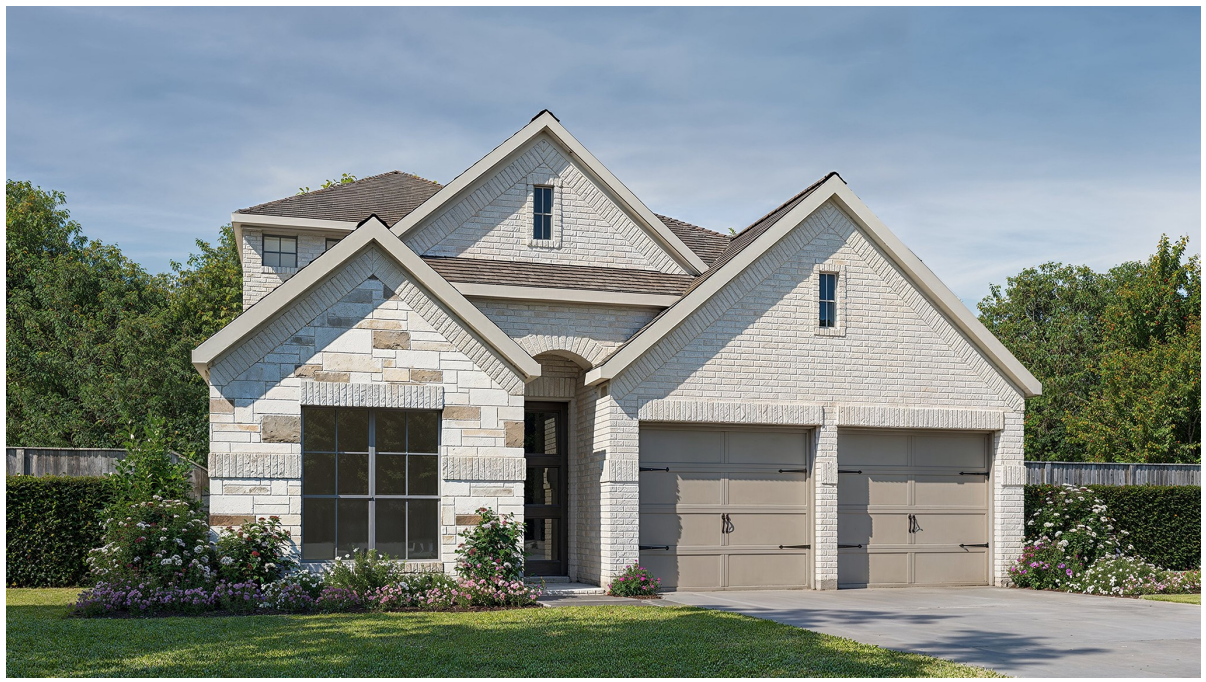
DESIGN 2444W E-30