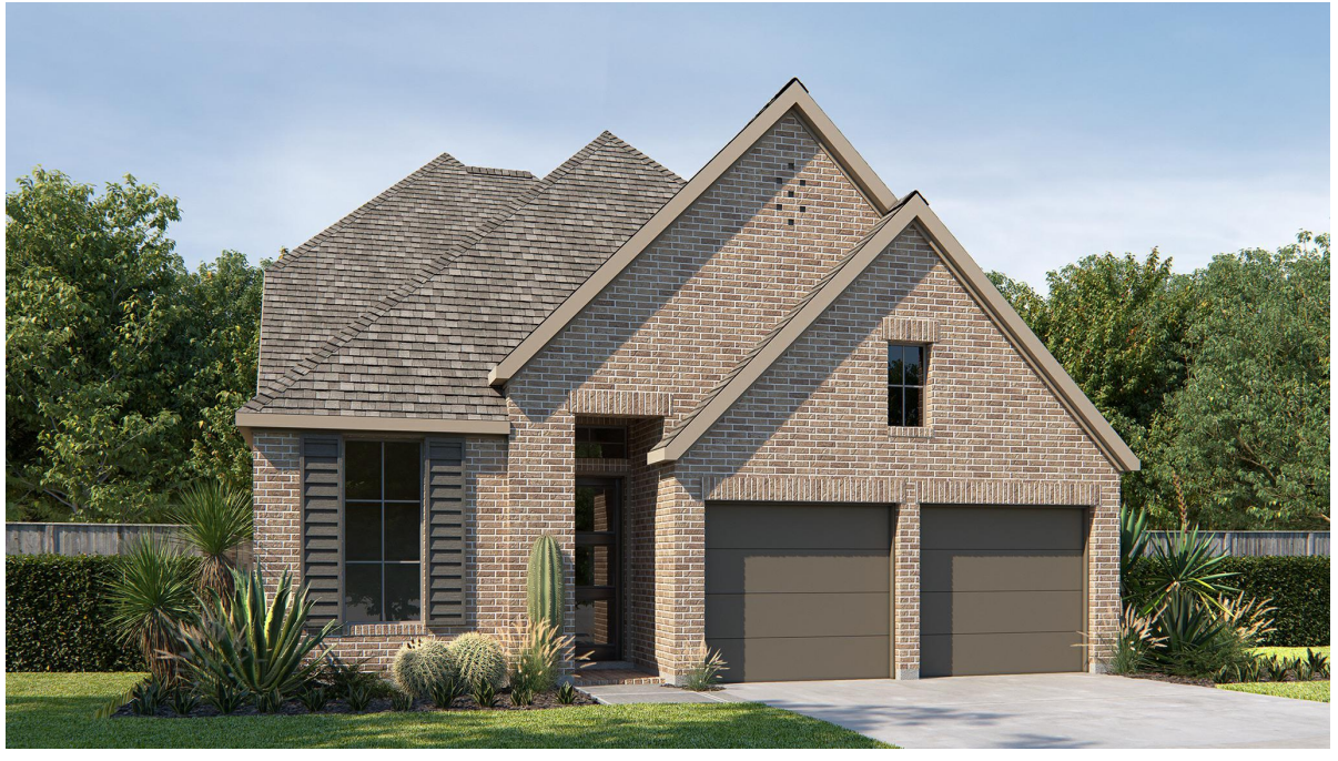
DESIGN 2444W E-50