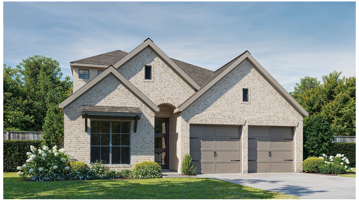
DESIGN 2444W E-1