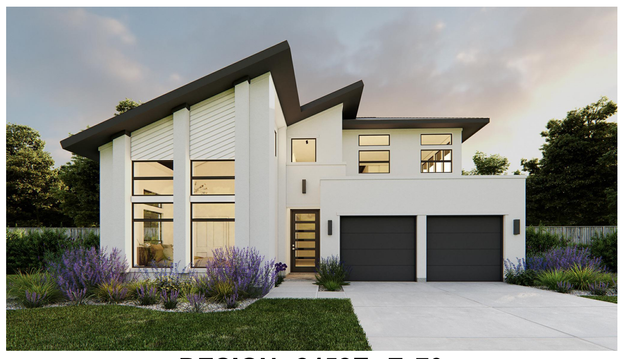
DESIGN 2458E E-70

This design, as originally designed and prior to any changes you make, is estimated to yield approximately the number of square feet shown on page 1. All dimensions are approximate. Square footage may vary based on as-built dimensions, configurations, plan options and/or the method of calculation. Designs are not-to-scale, and are conceptual illustrations that may differ from construction plans or completed improvements. A design may depict features not available on all homesites or in all communities. Perry Homes reserves the right to make changes in plans and specifications, and to substitute material of similar quality. Prices, terms, promotions, plans, dimensions, features, options, amenities, elevations, designs, square footages, specifications, materials, and availability of homes or communities are subject to change without notice or obligation. All obligations will be governed by a written contract. This design does not constitute a commitment to build a particular floor plan or home in any given community Some floor plans, options, and/or elevations may not be available on certain homesites or in a particular community and may require additional charges. Please check with Perry Homes to verify current offerings in the communities are considering. This rendering is the property of Perry Homes II C. Any reproduction or exhibition is strictly prohibited @ Perry Homes II C. 2024