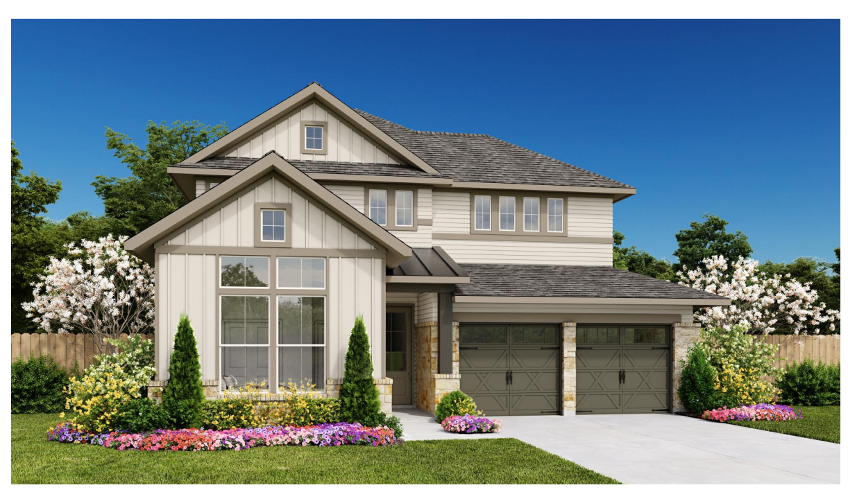
DESIGN 2458E E-50