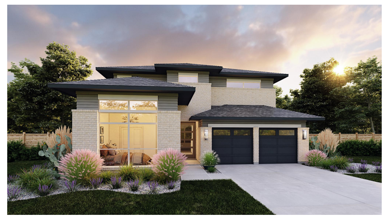
DESIGN 2458E E-1