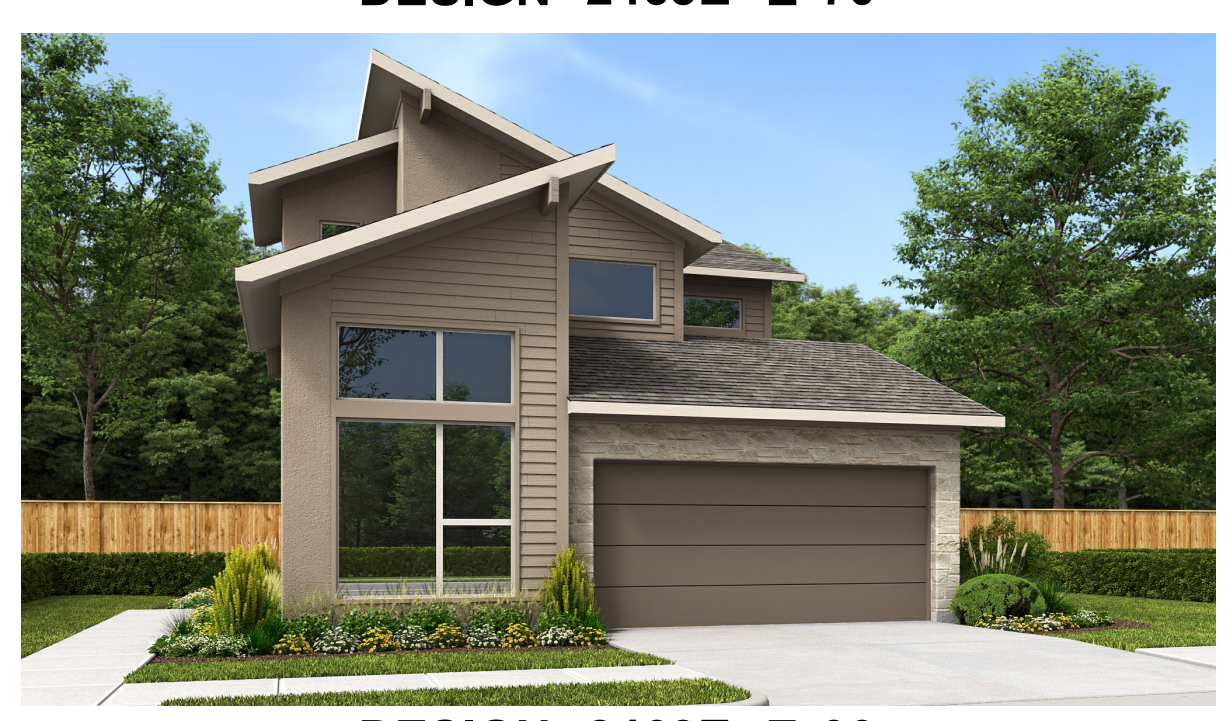
DESIGN 2463E E-90

This design, as originally designed and prior to any changes you make, is estimated to yield approximately the number of square feet shown on page 1. All dimensions are approximate. Square footage may vary based on as-built dimensions, configurations, plan options and/or the method of calculation. Designs are not-to-scale, and are conceptual illustrations that may differ from construction plans or completed improvements. A design may depict features not available on all homesites or in all communities. Perry Homes reserves the right to make changes in plans and specifications, and to substitute material of similar quality. Prices, terms, promotions, plans, dimensions, features, options, amenities, elevations, designs, square footages, specifications, materials, and availability of homes or communities to change without notice or obligation. All obligations will be governed by a written contract. This design does not constitute a commitment to build a particular floor plan or home in any given community. Some floor plans, options, and/or elevations may not be available on certain homesites or in a particular community and may require additional charges. Please check with Perry Homes to verify current offerings in the communities and are considering. This rendering is the property of Perry Homes. LLC. Any reproduction or exhibition is strictly prohibited @ Perry Homes LLC. 2019.