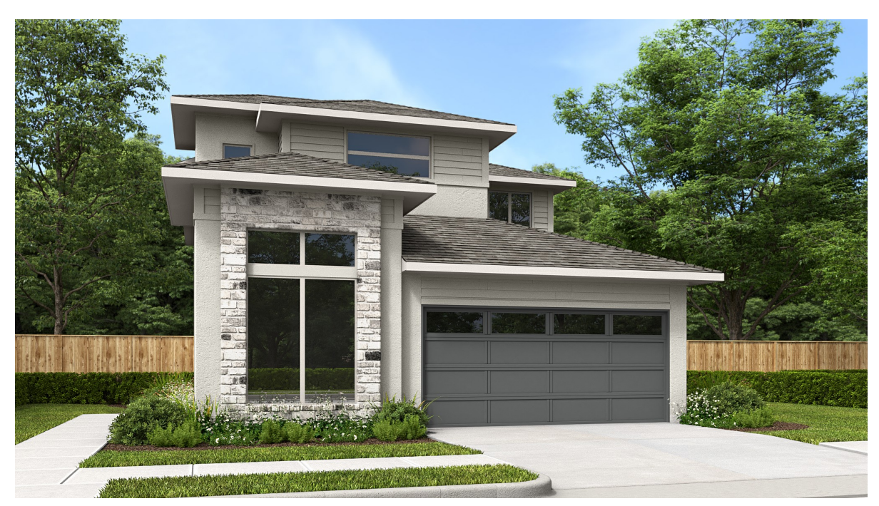
DESIGN 2463E E-70