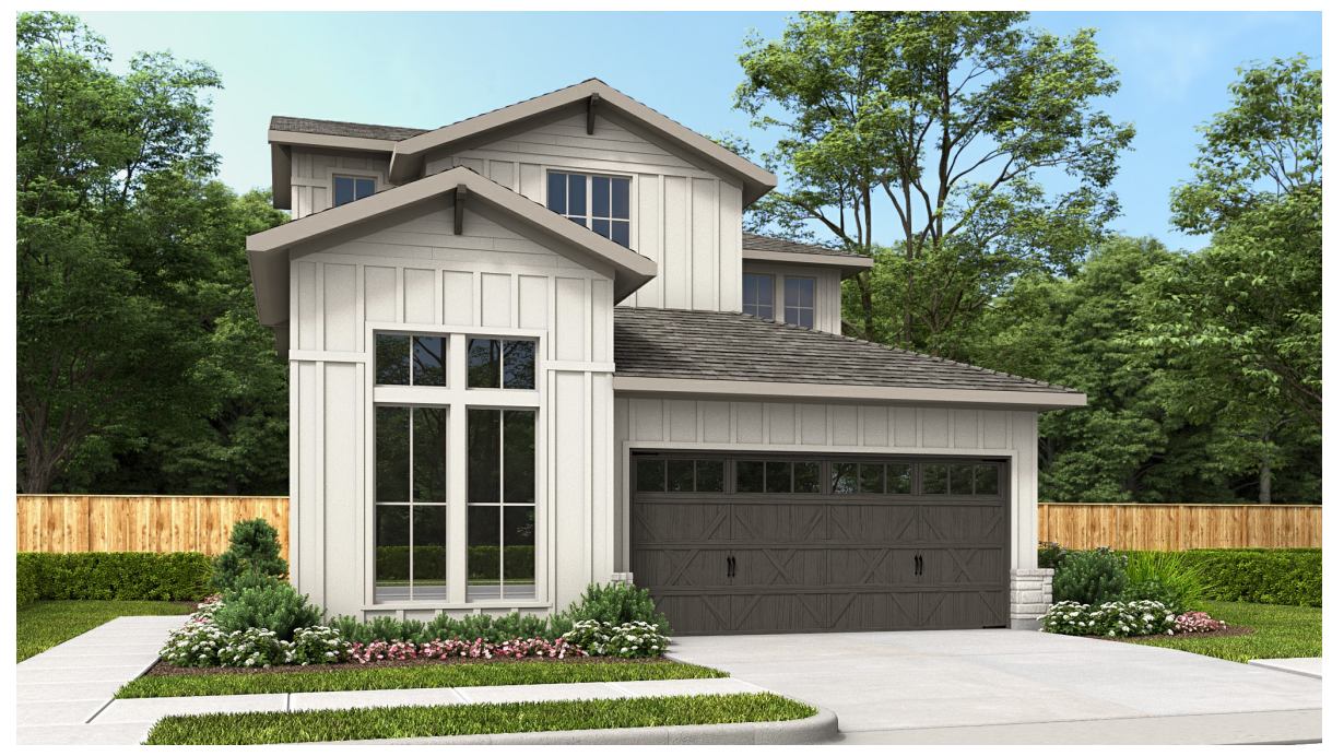
DESIGN 2463E E-1