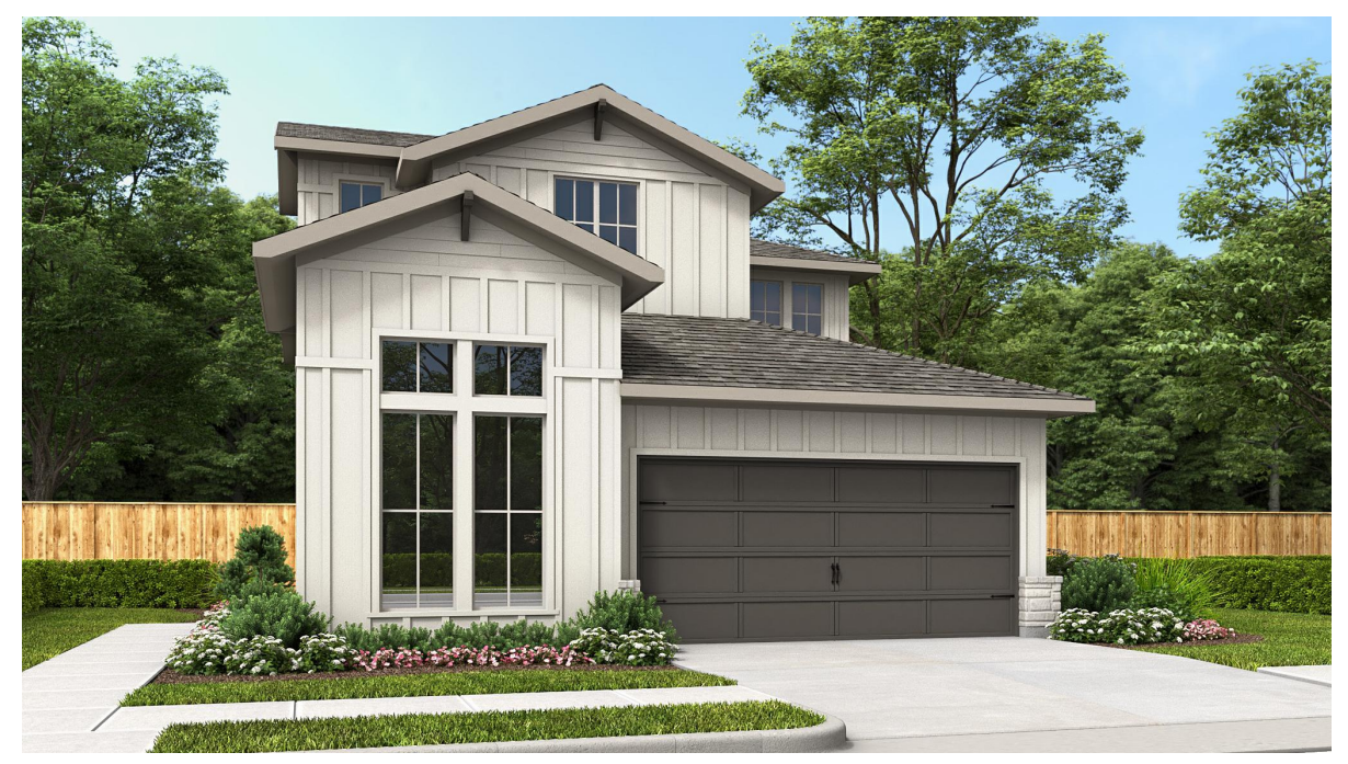
DESIGN 24630 E-1