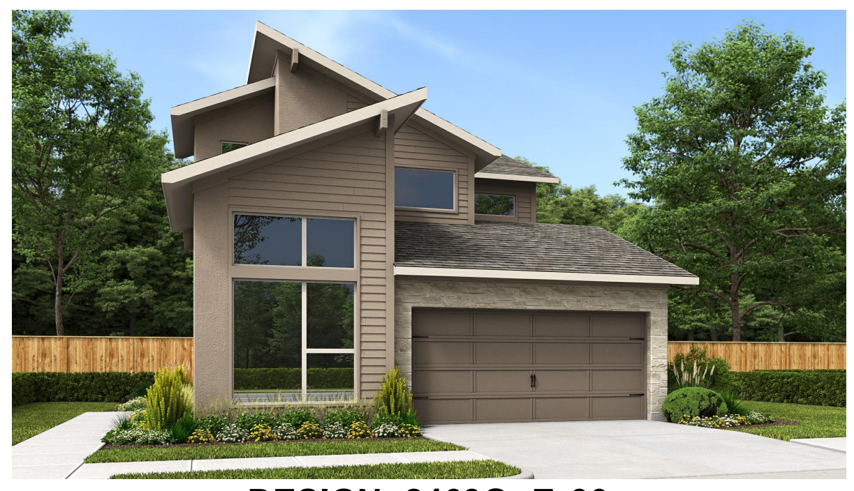
DESIGN 24630 E-90

This design, as originally designed and prior to any changes you make, is estimated to yield approximately the number of square feet shown on page 1. All dimensions are approximate. Square footage may vary based on as-built dimensions, configurations, plan options and/or the method of calculation. Designs are not-to-scale, and are conceptual illustrations that may differ from construction plans or completed improvements. A design may depict features not available on all homesites or in all communities. Perry Homes reserves the right to make changes in plans and specifications, and to substitute material of similar quality. Prices, terms, promotions, plans, dimensions, features, options, amenities, elevations, designs, square footages, specifications, materials, and availability of homes or communities are subject to change without notice or obligation. All obligations will be governed by a written contract. This design does not constitute a commitment to build a particular floor plan or home in any given community Some floor plans, options, and/or elevations may not be available on certain homesites or in a particular community and may require additional charges. Please check with Perry Homes to verify current offerings in the communities you are considering. This rendering is the property of Perry Homes LLC. Any reproduction or exhibition is strictly prohibited. @ Perry Homes LLC. 2013.