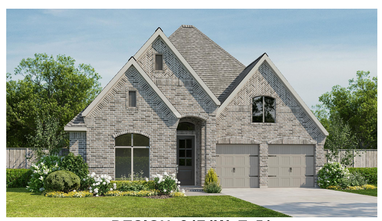
DESIGN 2474W E-51

This design, as originally designed and prior to any changes you make, is estimated to yield approximately the number of square feet shown on page 1. All dimensions are approximate. Square footage ma vary based on as-built dimensions, configurations, plan options and/or the method of calculation. Designs are not-to-scale, and are conceptual illustrations that may differ from construction plans or completed improvements. A design may depict features not available on all homesites or in all communities. Perry Homes reserves the right to make changes in plans and specifications, and to substitute material or similar quality. Prices, terms, promotions, plans, dimensions, features, options, amenities, elevations, designs, square footages, specifications, materials, and availability of homes or communities are subject to change without notice or obligation. All obligations will be governed by a written contract. This design does not constitute a commitment to build a particular floor plan or home in any given community. Some floor plans, options, and/or elevations may not be available on certain homesites or in a particular community and may require additional charges. Please check with Perry Homes to verify current offerings in the communities you are considering. This rendering is the property of Perry Homes, LLC. Any reproduction or exhibition is strictly prohibited. Perry Homes, LLC 2024