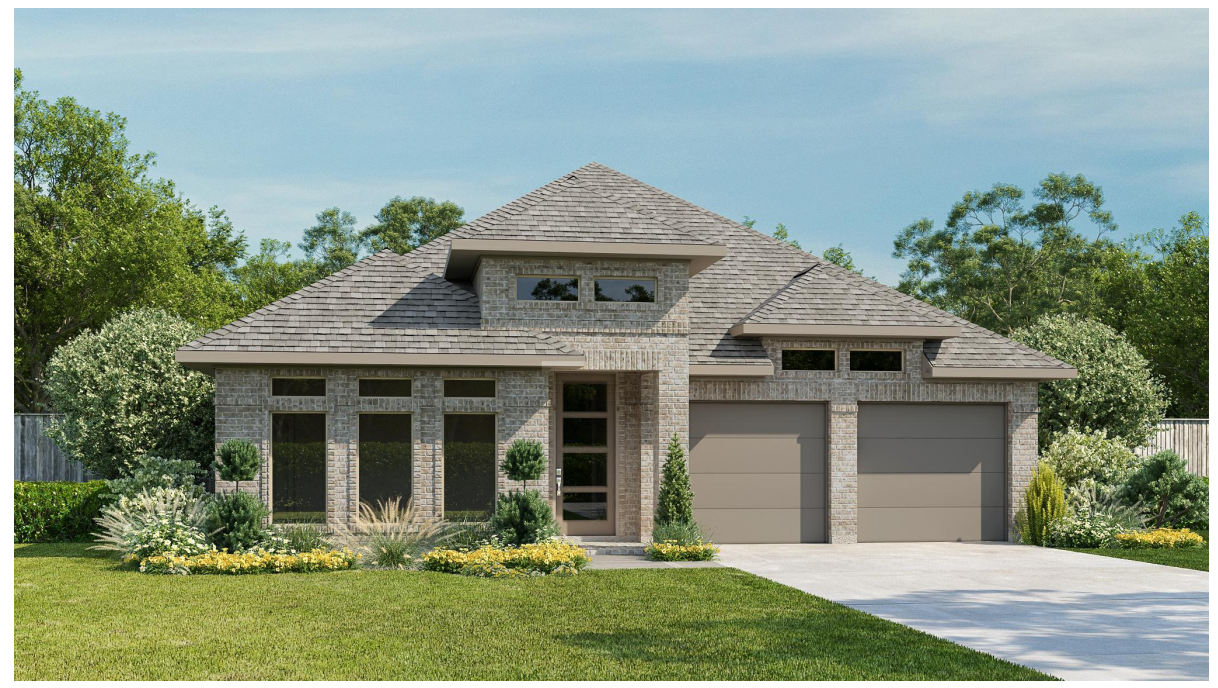
DESIGN 2474W E-1