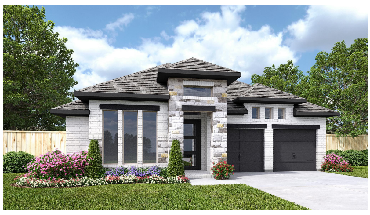
DESIGN 2474W E-32