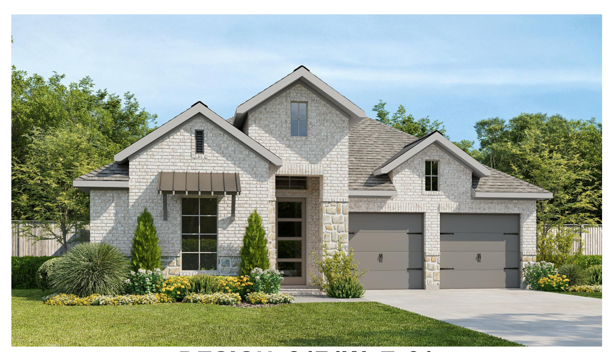
DESIGN 2474W E-31