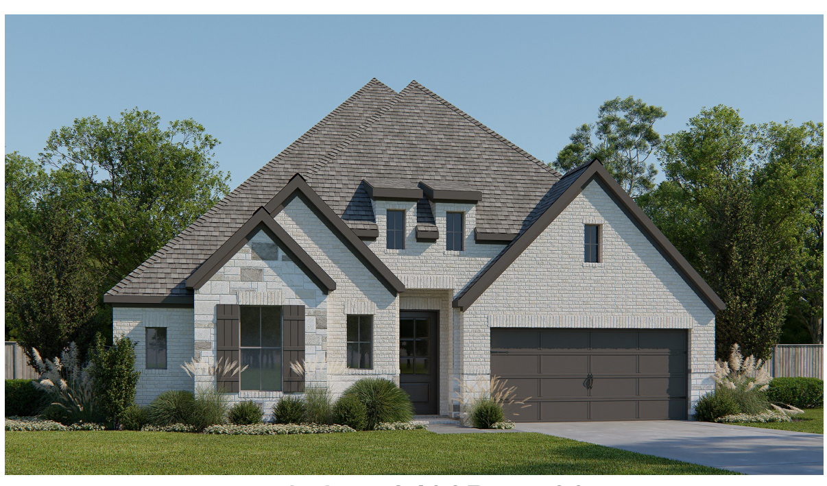
DESIGN 2493P E-30

This design, as originally designed and prior to any changes you make, is estimated to yield approximately the number of square feet shown on page 1. All dimensions are approximate. Square footage may vary based on as-built dimensions, configurations, plan options and/or the method of calculation. Designs are not-to-scale, and are conceptual illustrations that may differ from construction plans or completed improvements. A design may depict features not available on all homesites or in all communities. Perry Homes reserves the right to make changes in plans and specifications, and to substitute material of similar quality. Prices, terms, promotions, plans, dimensions, features, options, amenities, elevations, designs, square footages, specifications, materials, and availability of homes or communities ochange without notice or obligation. All obligations will be governed by a written contract. This design does not constitute a commitment to build a particular floor plan or home in any given community. Some floor plans, options, and/or elevations may not be available on certain homesites or in a particular community and may require additional charges. Please check with Perry Homes to verify current offerings in the communities and are considering. This rendering is the property of Perry Homes. LLC. Any reproduction or exhibition is strictly prohibited @ Perry Homes LLC. 2018