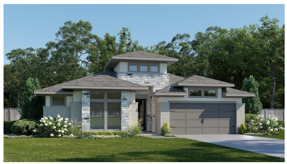
DESIGN 2493P E-1