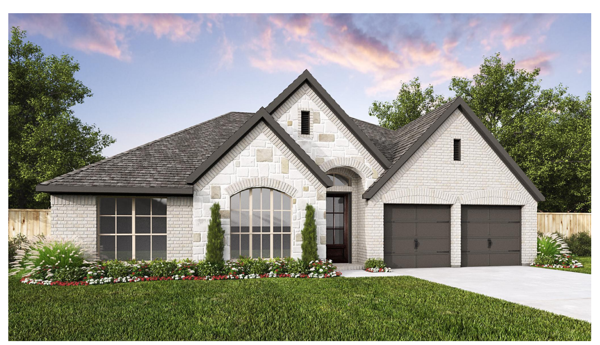
DESIGN 2501W E-30