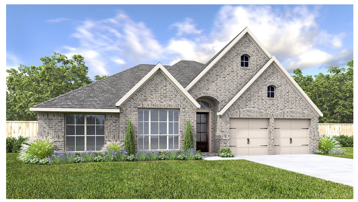
DESIGN 2501W E-1