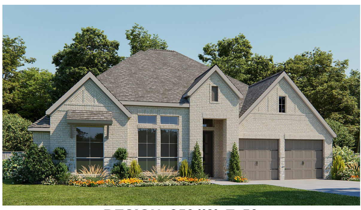
DESIGN 2501W E-50