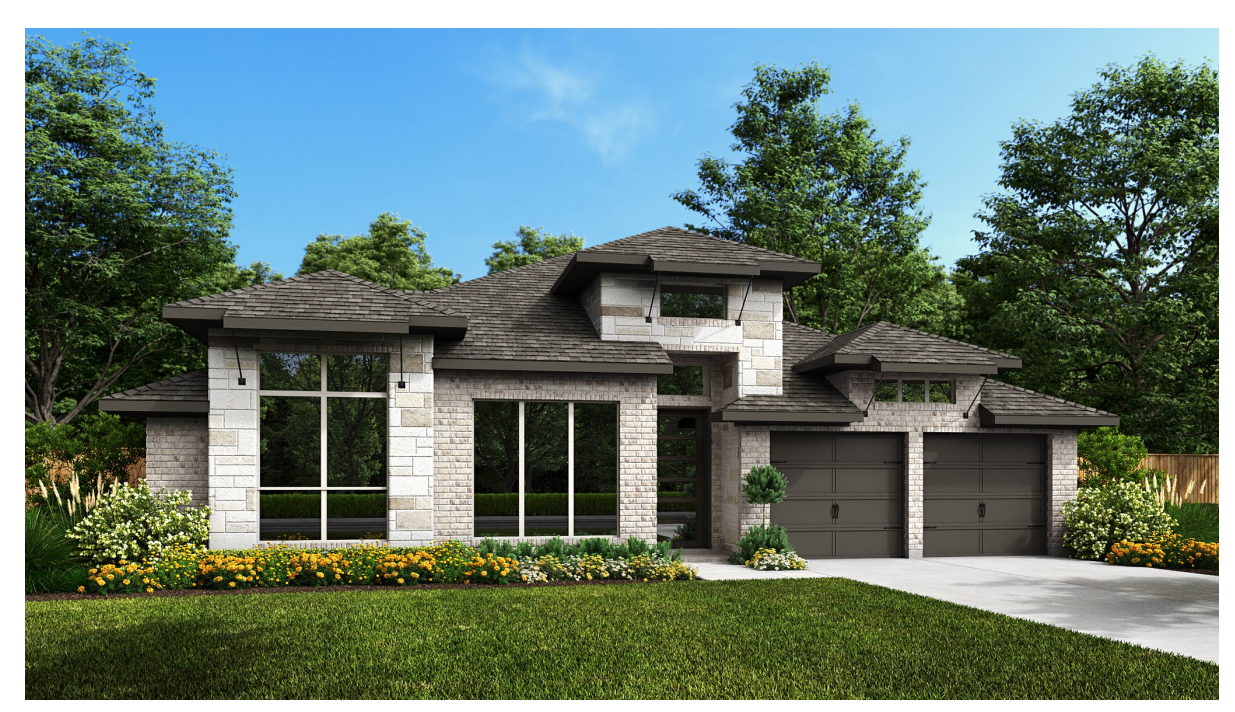
DESIGN 2501W E-91

This design, as originally designed and prior to any changes you make, is estimated to yield approximately the number of square feet shown on page 1. All dimensions are approximate. Square footage ma vary based on as-built dimensions, configurations, plan options and/or the method of calculation. Designs are not-to-scale, and are conceptual illustrations that may differ from construction plans or completed improvements. A design may depict features not available on all homesites or in all communities. Perry Homes reserves the right to make changes in plans and specifications, and to substitute material or similar quality. Prices, terms, promotions, plans, dimensions, features, options, amenities, elevations, designs, square footages, specifications, materials, and availability of homes or communities are subject to change without notice or obligation. All obligations will be governed by a written contract. This design does not constitute a commitment to build a particular floor plan or home in any given community. Some floor plans, options, and/or elevations may not be available on certain homesites or in a particular community and may require additional charges. Please check with Perry Homes to verify current offerings in the communities you are considering. This rendering is the property of Perry Homes, LLC. Any reproduction or exhibition is strictly prohibited. Perry Homes, LLC 2023