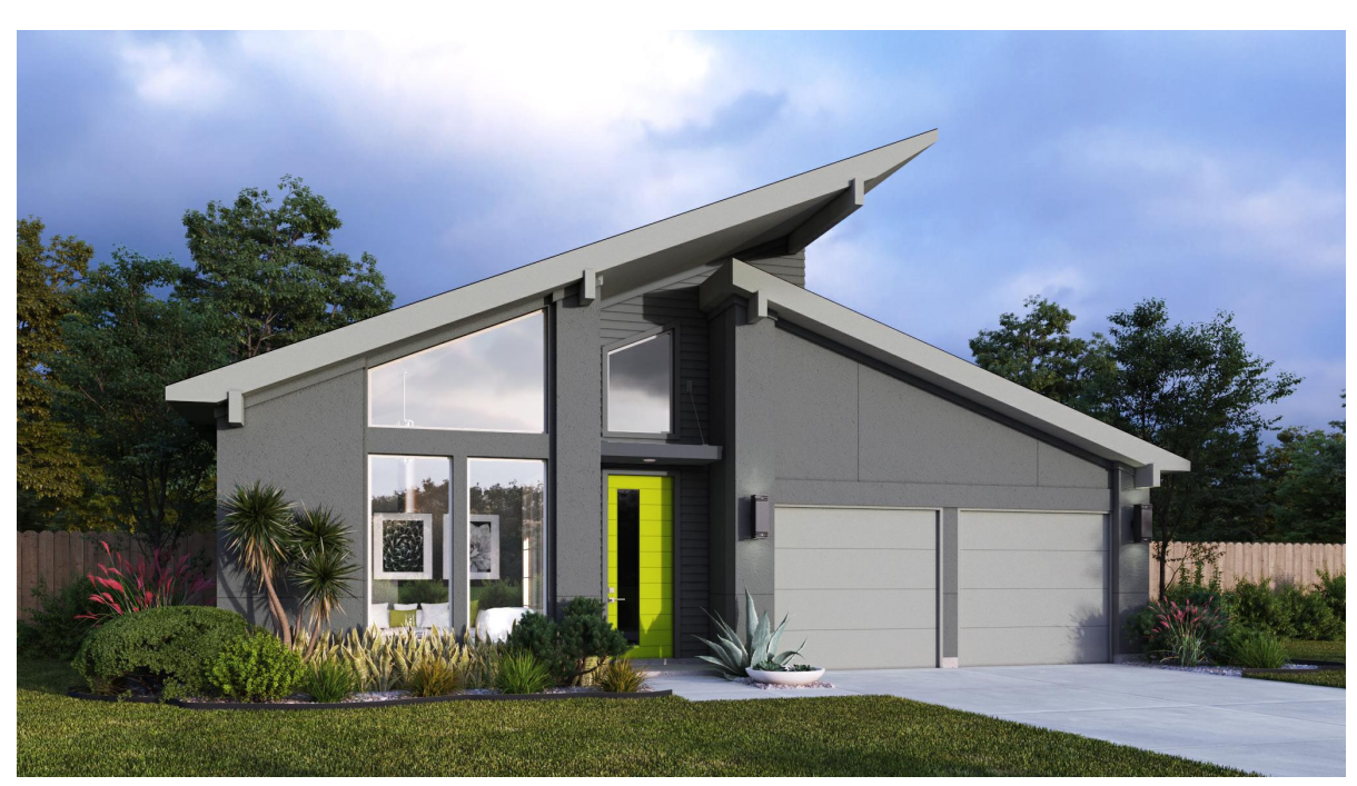
DESIGN 2504E E-2