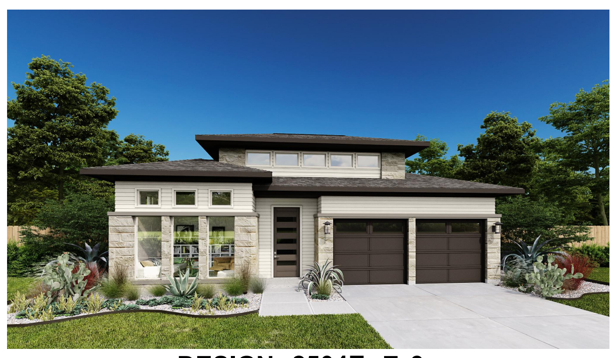
DESIGN 2504E E-3