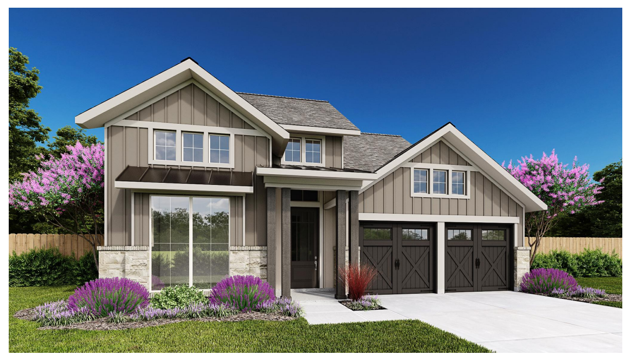
DESIGN 2504E E-1