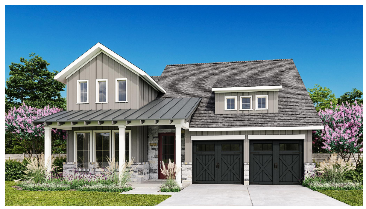
DESIGN 2504E E-90

This design, as originally designed and prior to any changes you make, is estimated to yield approximately the number of square feet shown on page 1. All dimensions are approximate. Square footage may appear on as-built dimensions, configurations, plan options and/or the method of calculation. Designs are not-to-scale, and are conceptual illustrations that may differ from construction plans or completed improvements. A design may depict features not available on all homesites or in all communities. Perry Homes reserves the right to make changes in plans and specifications, and to substitute material similar quality. Prices, terms, promotions, plans, dimensions, features, options, amenities, elevations, designs, square footages, specifications, materials, and availability of homes or communities are subject to change without notice or obligation. All obligations will be governed by a written contract. This design does not constitute a commitment to build a particular floor plan or home in any given community. Some floor plans, options, and/or elevations may not be available on certain homesites or in a particular community and may require additional charges. Please check with Perry Homes to verify current offerings in the communities you are considering. This rendering is the property of Perry Homes, LLC. Any reproduction or exhibition is strictly prohibited. @ Perry Homes, LLC 2023