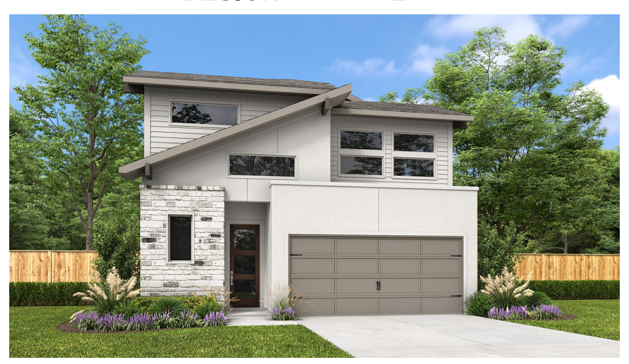
DESIGN 25280 E-71