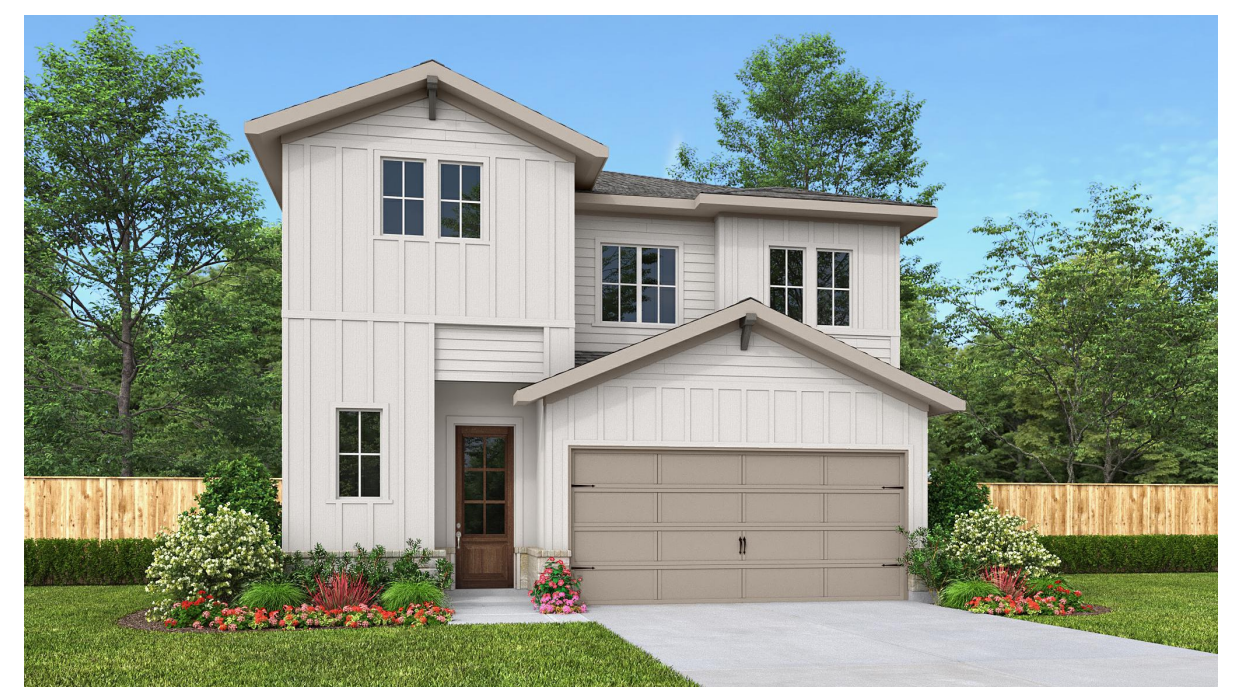
DESIGN 25280 E-1