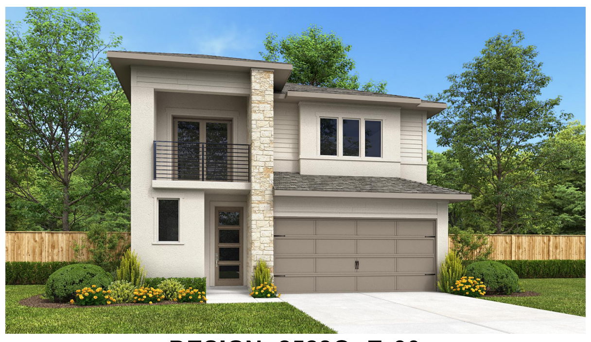
DESIGN 25280 E-90

This design, as originally designed and prior to any changes you make, is estimated to yield approximately the number of square feet shown on page 1. All dimensions are approximate. Square footage may vary based on as-built dimensions, configurations, plan options and/or the method of calculation. Designs are not-to-scale, and are conceptual illustrations that may differ from construction plans or completed improvements. A design may depict features not available on all homesites or in all communities. Perry Homes reserves the right to make changes in plans and specifications, and to substitute material of similar quality. Prices, terms, promotions, plans, dimensions, features, options, amenities, elevations, designs, square footages, specifications, materials, and availability of homes or communities to change without notice or obligation. All obligations will be governed by a written contract. This design does not constitute a commitment to build a particular floor plan or home in any given community. Some floor plans, options, and/or elevations may not be available on certain homesites or in a particular community and may require additional charges. Please check with Perry Homes to verify current offerings in the communities on a green considering. This rendering is the property of Perry Homes. LLC. Any reproduction or exhibition is strictly prohibited @ Perry Homes LLC. 2018