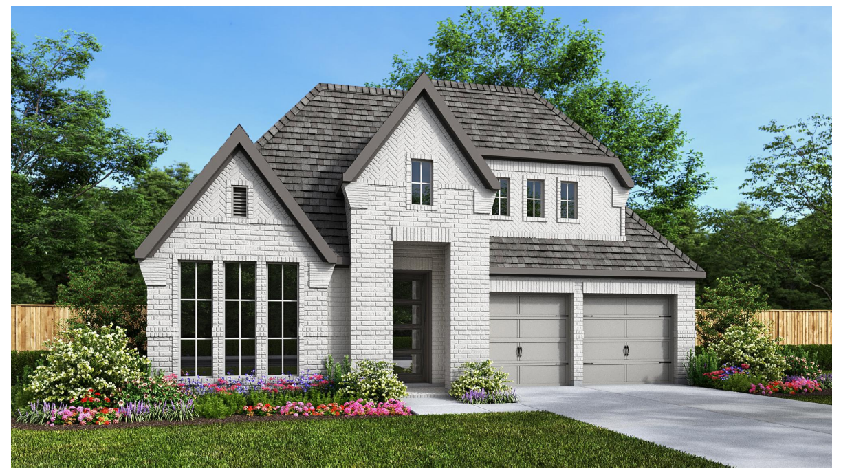
DESIGN 2544W E-1