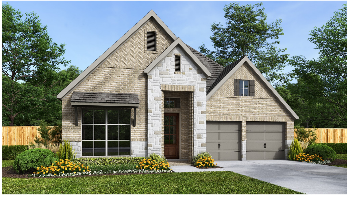
DESIGN 2544W E-30

*See Page 3 for Details and Disclaimers | © Perry Homes, LLC 2023 | 12/7/2023 10:54:34 AM (50' CL) PerryHomes.com