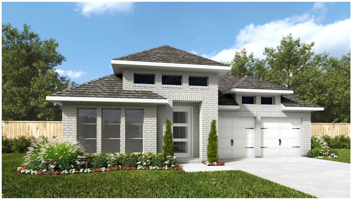
DESIGN 2544W E-2