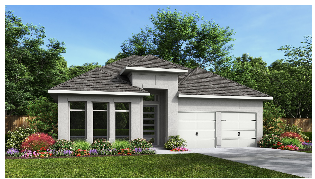
DESIGN 2545S E-1