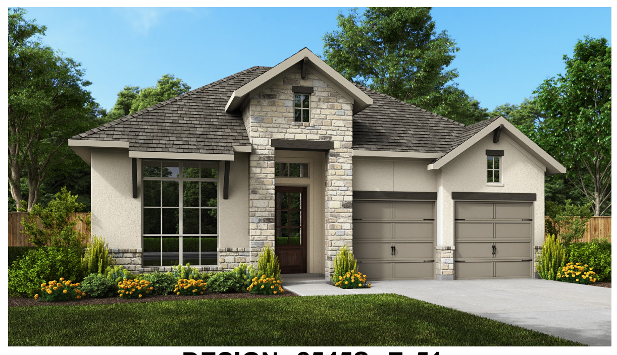
DESIGN 2545S E-51

This design, as originally designed and prior to any changes you make, is estimated to yield approximately the number of square feet shown on page 1. All dimensions are approximate. Square footage may vary based on as-built dimensions, configurations, plan options and/or the method of calculation. Designs are not-to-scale, and are conceptual illustrations that may differ from construction plans or completed improvements. A design may depict features not available on all homesites or in all communities. Perry Homes reserves the right to make changes in plans and specifications, and to substitute material of similar quality. Prices, terms, promotions, plans, dimensions, features, options, amenities, elevations, designs, square footages, specifications, materials, and availability of homes or communities to change without notice or obligation. All obligations will be governed by a written contract. This design does not constitute a commitment to build a particular floor plan or home in any given community. Some floor plans, options, and/or elevations may not be available on certain homesites or in a particular community and may require additional charges. Please check with Perry Homes to verify current offerings in the communities and are considering. This rendering is the property of Perry Homes. LLC. Any reproduction or exhibition is strictly prohibited @ Perry Homes LLC. 2013.