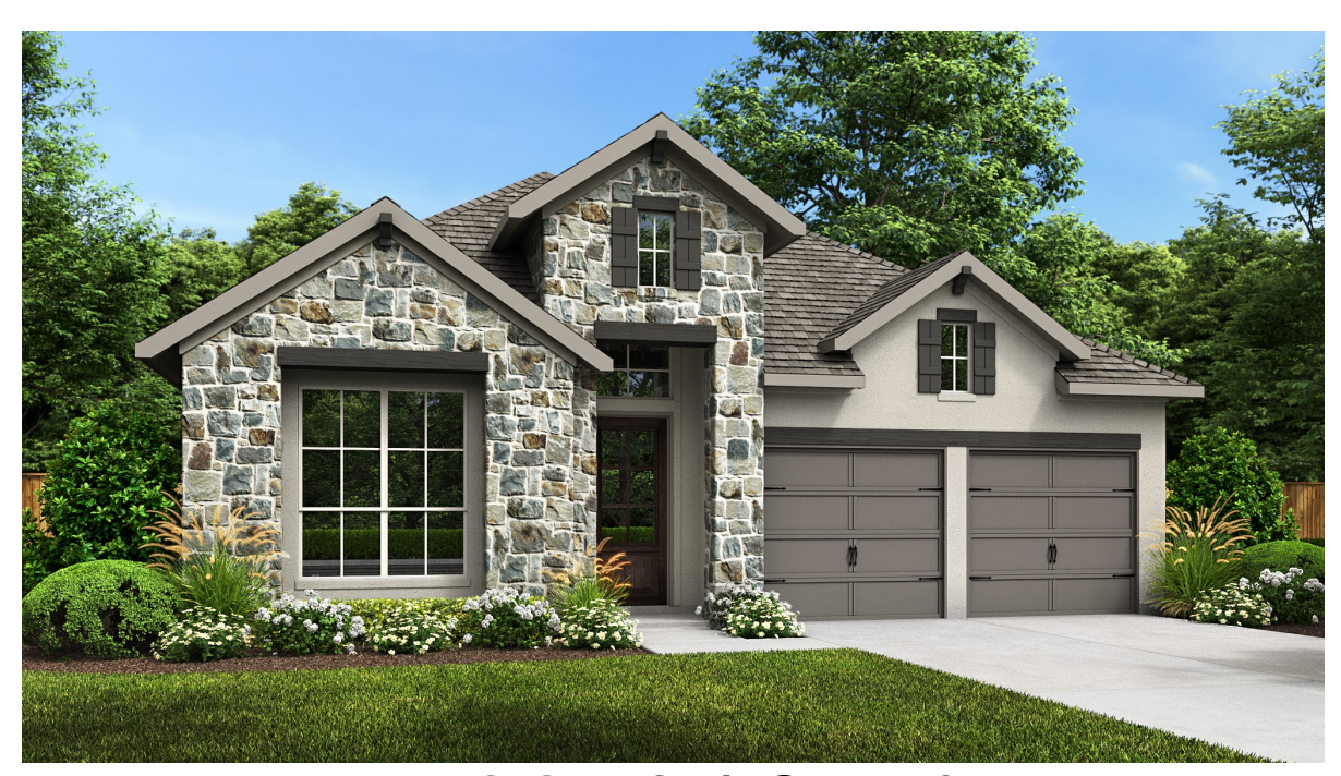
DESIGN 2545S E-50