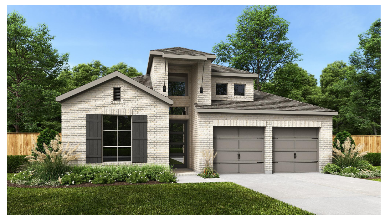
DESIGN 2569V E-1