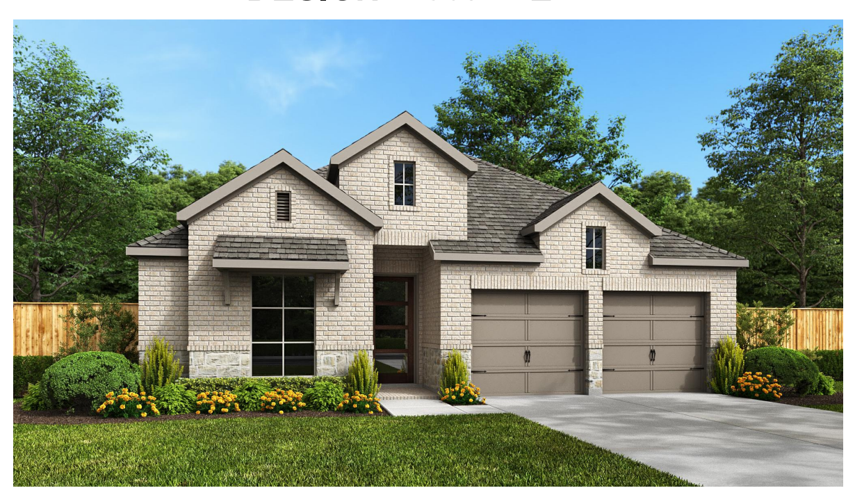
DESIGN 2569V E-30