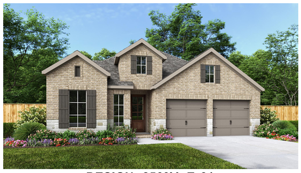
DESIGN 2569V E-31

This design, as originally designed and prior to any changes you make, is estimated to yield approximately the number of square feet shown on page 1. All dimensions are approximate. Square footage may vary based on as-built dimensions, configurations, plan options and/or the method of calculation. Designs are not-to-scale, and are conceptual illustrations that may differ from construction plans or completed improvements. A design may depict features not available on all homesites or in all communities. Perry Homes reserves the right to make changes in plans and specifications, and to substitute material of similar quality. Prices, terms, promotions, plans, dimensions, features, options, amenities, elevations, designs, square footages, specifications, materials, and availability of homes or communities are subject to change without notice or obligation. All obligations will be governed by a written contract. This design does not constitute a commitment to build a particular floor plan or home in any given community Some floor plans, options, and/or elevations may not be available on certain homesites or in a particular community and may require additional charges. Please check with Perry Homes to verify current offerings in the communities are considering. This rendering is the property of Perry Homes 11 C. Any reproduction or exhibition is strictly prohibited @ Perry Homes 11 C. 2023