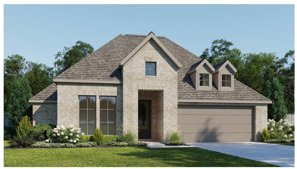
DESIGN 2586P E-1