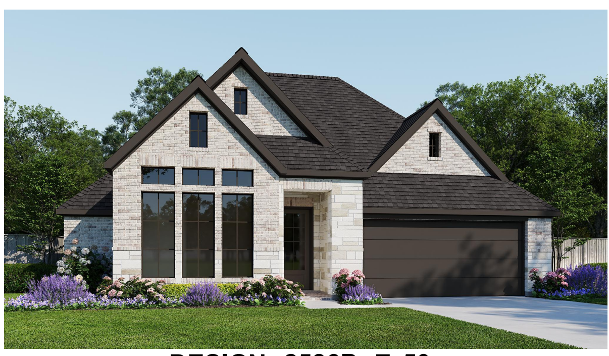
DESIGN 2586P E-50

This design, as originally designed and prior to any changes you make, is estimated to yield approximately the number of square feet shown on page 1. All dimensions are approximate. Square footage may vary based on as-built dimensions, configurations, plan options and/or the method of calculation. Designs are not-to-scale, and are conceptual illustrations that may differ from construction plans or completed improvements. A design may depict features not available on all homesites or in all communities. Perry Homes reserves the right to make changes in plans and specifications, and to substitute material of similar quality. Prices, terms, promotions, plans, dimensions, features, options, amenities, elevations, designs, square footages, specifications, materials, and availability of homes or communities are subject to change without notice or obligation. All obligations will be governed by a written contract. This design does not constitute a commitment to build a particular floor plan or home in any given community Some floor plans, options, and/or elevations may not be available on certain homesites or in a particular community and may require additional charges. Please check with Perry Homes to verify current offerings in the communities are considering. This rendering is the property of Perry Homes II C. Any reproduction or exhibition is strictly prohibited @ Perry Homes II C. 2021