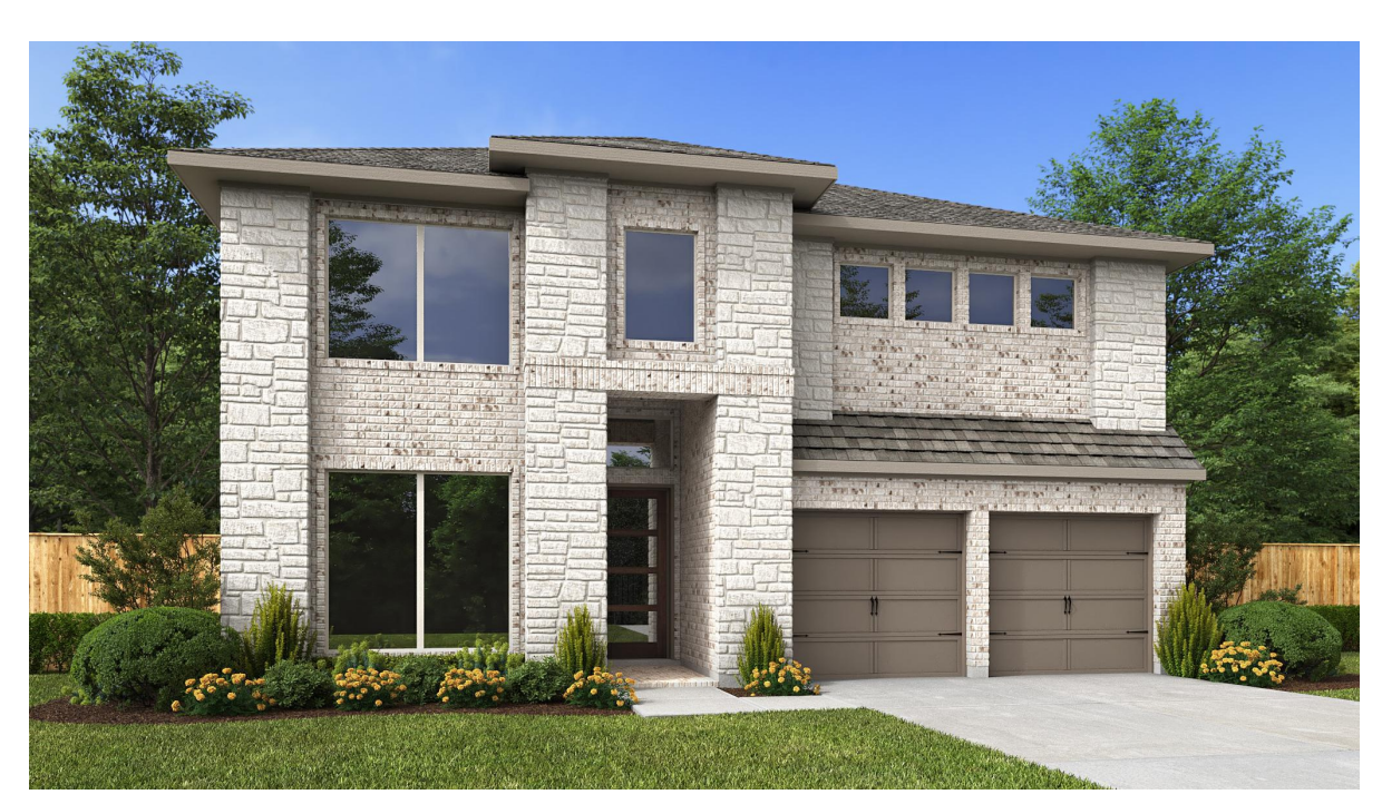
DESIGN 2599W E-51