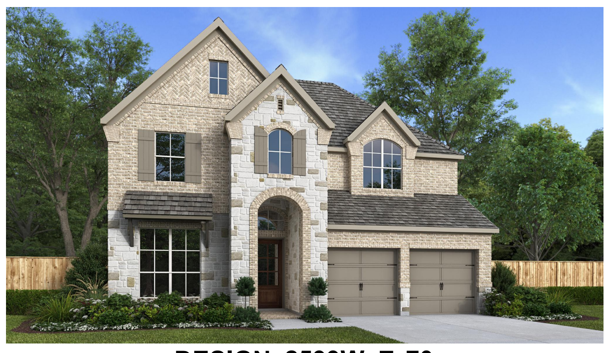
DESIGN 2599W E-70