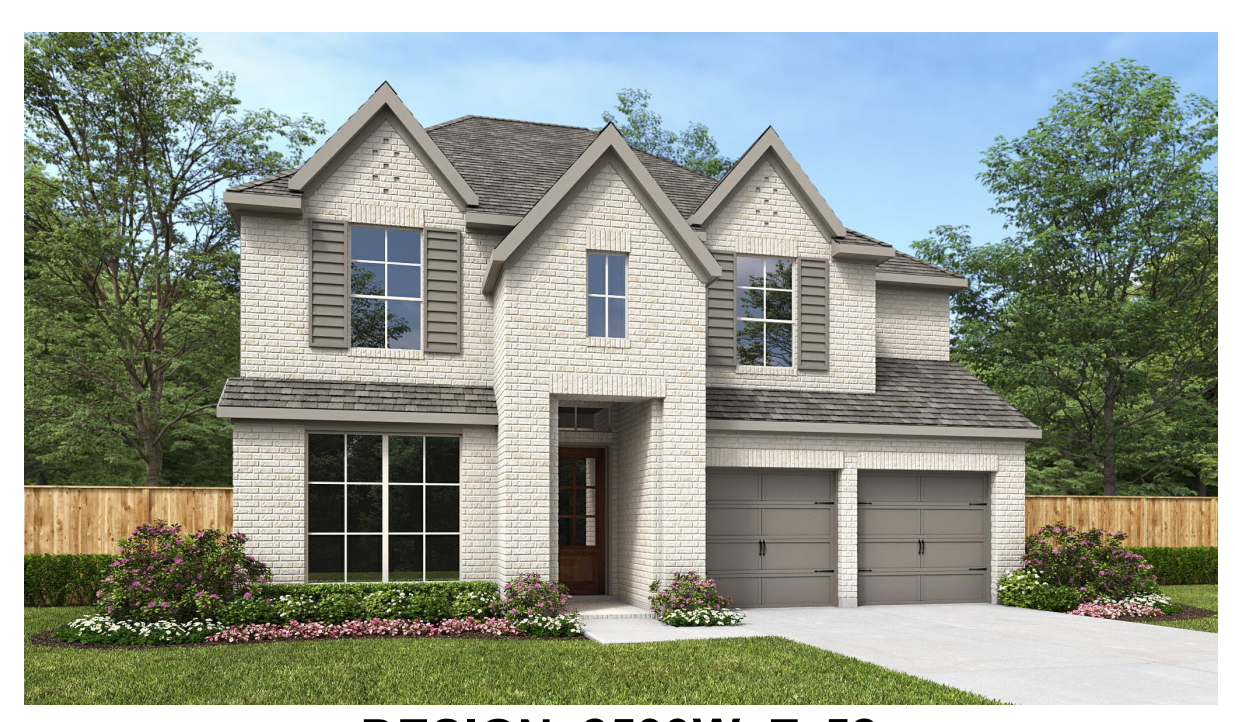
DESIGN 2599W E-52

Inis design, as originally designed and prior to any changes you make, is estimated to yield approximately the number of square feet shown on page 1. All dimensions are approximatels. Square footage may vary based on as-built dimensions, configurations, plan options and/or the method of calculation. Designs are not-to-scale, and are conceptual illustrations that may differ from construction plans or completed improvements. A design may depict features not available on all homesites or in all communities. Perry Homes reserves the right to make changes in plans and specifications, and to substitute material original and availability of homes or communities, are subject to change without notice or obligation. All obligations will be governed by a written contract. This design does not constitute a commitment to build a particular floor plan or home in any given community. Some floor plans, options, and/or elevations may not be available on certain homesites or in a particular community and may require additional charges. Please check with Perry Homes to verify current offerings in the communities you are considering. This rendering is the property of Perry Homes, LLC. Any reproduction or exhibition is strictly prohibited. © Perry Homes, LLC 2023