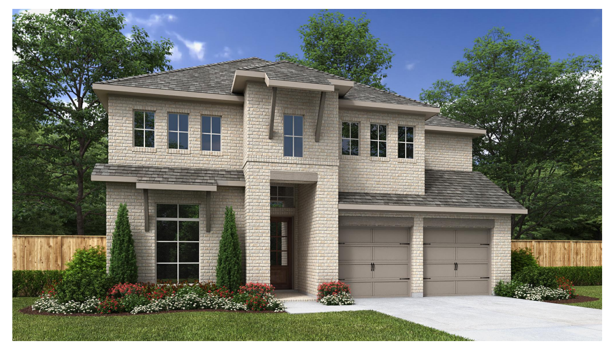
DESIGN 2599W E-1