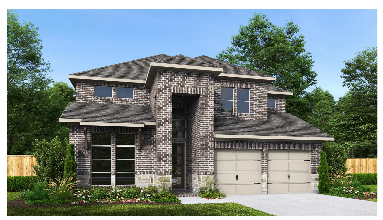
DESIGN 2608V E-31