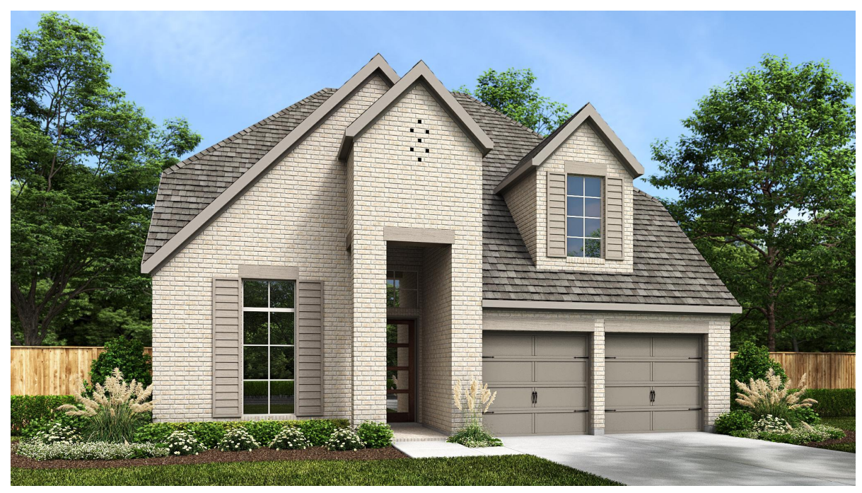
DESIGN 2608V E-1