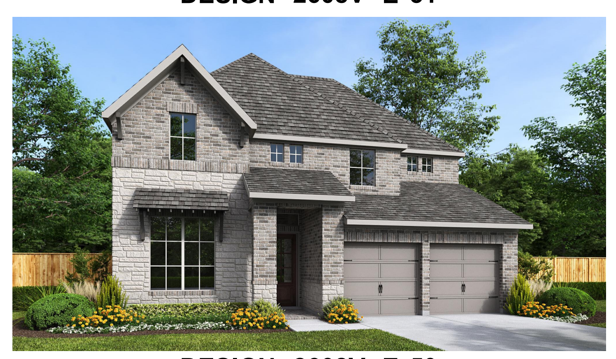
DESIGN 2608V E-50

This design, as originally designed and prior to any changes you make, is estimated to yield approximately the number of square feet shown on page 1. All dimensions are approximate. Square footage may vary based on as-built dimensions, configurations, plan options and/or the method of calculation. Designs are not-to-scale, and are conceptual illustrations that may differ from construction plans or completed improvements. A design may depict features not available on all homesites or in all communities. Perry Homes reserves the right to make changes in plans and specifications, and to substitute material of similar quality. Prices, terms, promotions, plans, dimensions, features, options, amenities, elevations, designs, square footages, specifications, materials, and availability of homes or communities are subject to change without notice or obligation. All obligations will be governed by a written contract. This design does not constitute a commitment to build a particular floor plan or home in any given community Some floor plans, options, and/or elevations may not be available on certain homesites or in a particular community and may require additional charges. Please check with Perry Homes to verify current offerings in the communities are considering. This rendering is the property of Perry Homes. LLC. Any reproduction or exhibition is strictly prohibited @ Perry Homes LLC. 2023