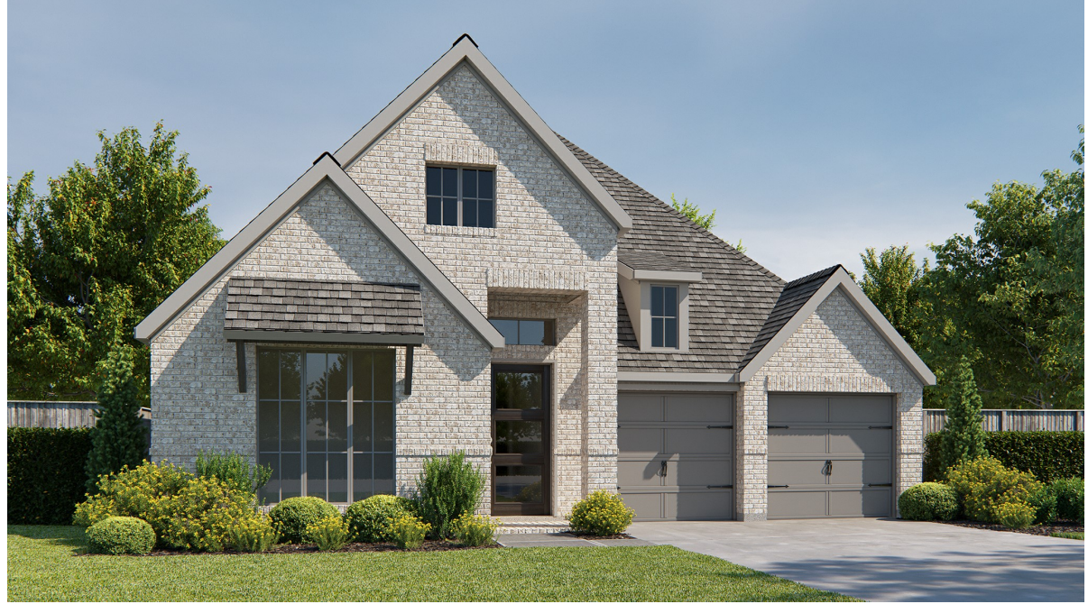
DESIGN 2635W E-1