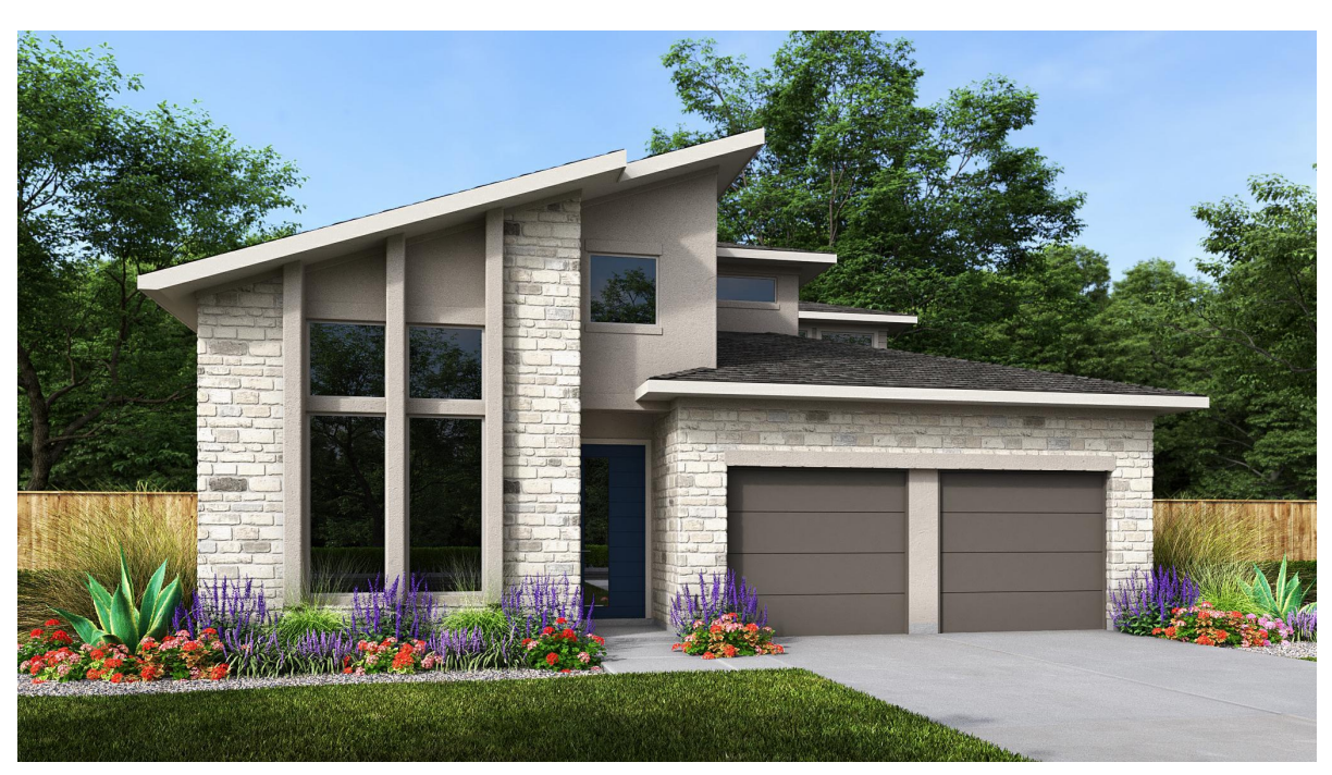
DESIGN 2668E E-50