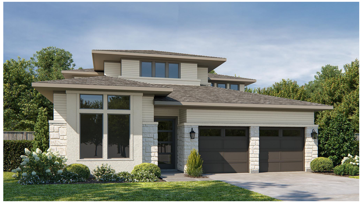
DESIGN 2668E E-1