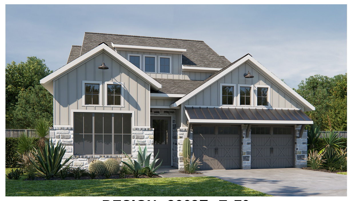
DESIGN 2668E E-70

This design, as originally designed and prior to any changes you make, is estimated to yield approximately the number of square feet shown on page 1. All dimensions are approximate. Square footage may vary based on as-built dimensions, configurations, plan options and/or the method of calculation. Designs are not-to-scale, and are conceptual illustrations that may differ from construction plans or completed improvements. A design may depict features not available on all homesites or in all communities. Perry Homes reserves the right to make changes in plans and specifications, and to substitute material of similar quality. Prices, terms, promotions, plans, dimensions, features, options, amenities, elevations, designs, square footages, specifications, materials, and availability of homes or communities to change without notice or obligation. All obligations will be governed by a written contract. This design does not constitute a commitment to build a particular floor plan or home in any given community. Some floor plans, options, and/or elevations may not be available on certain homesites or in a particular community and may require additional charges. Please check with Perry Homes to verify current offerings in the communities on a green considering. This rendering is the property of Perry Homes. LLC. Any reproduction or exhibition is strictly prohibited @ Perry Homes LLC. 2018