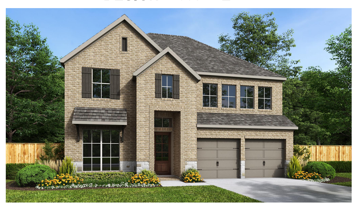
DESIGN 2668V E-31