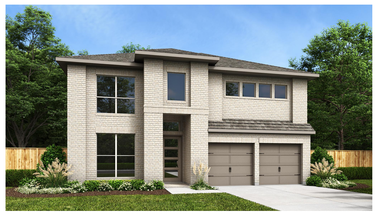
DESIGN 2668V E-1