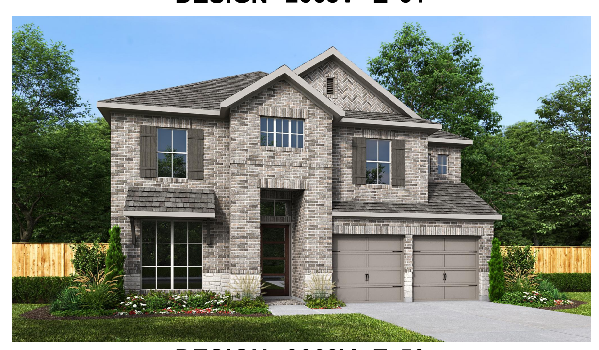
DESIGN 2668V E-50

This design, as originally designed and prior to any changes you make, is estimated to yield approximately the number of square feet shown on page 1. All dimensions are approximate. Square footage may vary based on as-built dimensions, configurations, plan options and/or the method of calculation. Designs are not-to-scale, and are conceptual illustrations that may differ from construction plans or completed improvements. A design may depict features not available on all homesites or in all communities. Perry Homes reserves the right to make changes in plans and specifications, and to substitute material of similar quality. Prices, terms, promotions, plans, dimensions, features, options, amenities, elevations, designs, square footages, specifications, materials, and availability of homes or communities to change without notice or obligation. All obligations will be governed by a written contract. This design does not constitute a commitment to build a particular floor plan or home in any given community. Some floor plans, options, and/or elevations may not be available on certain homesites or in a particular community and may require additional charges. Please check with Perry Homes to verify current offerings in the communities on a green considering. This rendering is the property of Perry Homes. LLC. Any reproduction or exhibition is strictly prohibited @ Perry Homes LLC. 2018