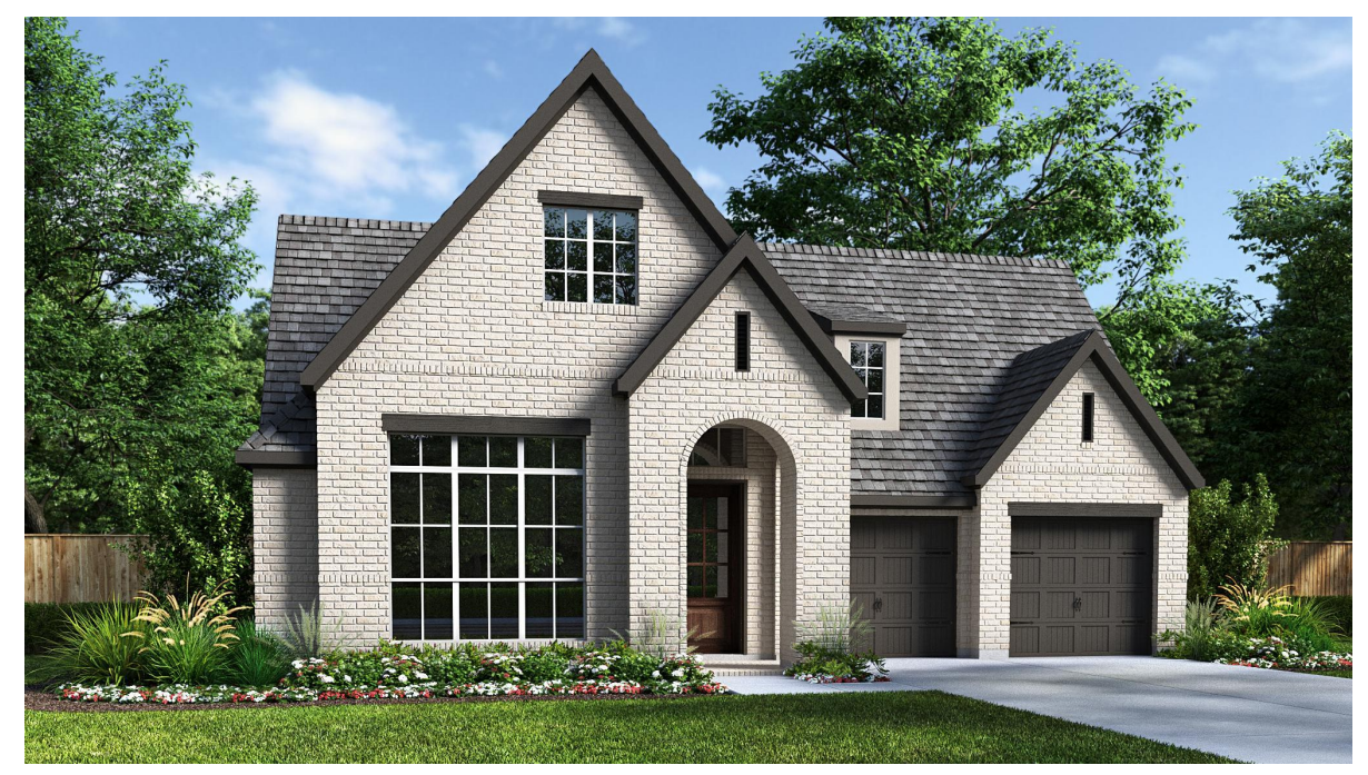
DESIGN 2669W E-1