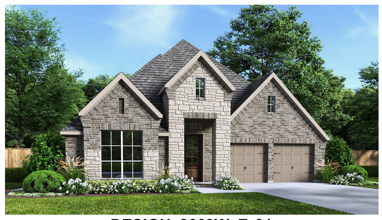
DESIGN 2669W E-31

This design, as originally designed and prior to any changes you make, is estimated to yield approximately the number of square feet shown on page 1. All dimensions are approximate. Square footage may vary based on as-built dimensions, configurations, plan options and/or the method of calculation. Designs are not-to-scale, and are conceptual illustrations that may differ from construction plans or completed improvements. A design may depict features not available on all homesites or in all communities. Perry Homes reserves the right to make changes in plans and specifications, and to substitute material of similar quality. Prices, terms, promotions, plans, dimensions, features, options, amenities, elevations, designs, square footages, specifications, materials, and availability of homes or communities are subject to change without notice or obligation. All obligations will be governed by a written contract. This design does not constitute a commitment to build a particular floor plan or home in any given community Some floor plans, options, and/or elevations may not be available on certain homesites or in a particular community and may require additional charges. Please check with Perry Homes to verify current offerings in the communities you are considering. This rendering is the property of Perry Homes LLC. Any reproduction or exhibition is strictly prohibited. @ Perry Homes LLC. 2013.