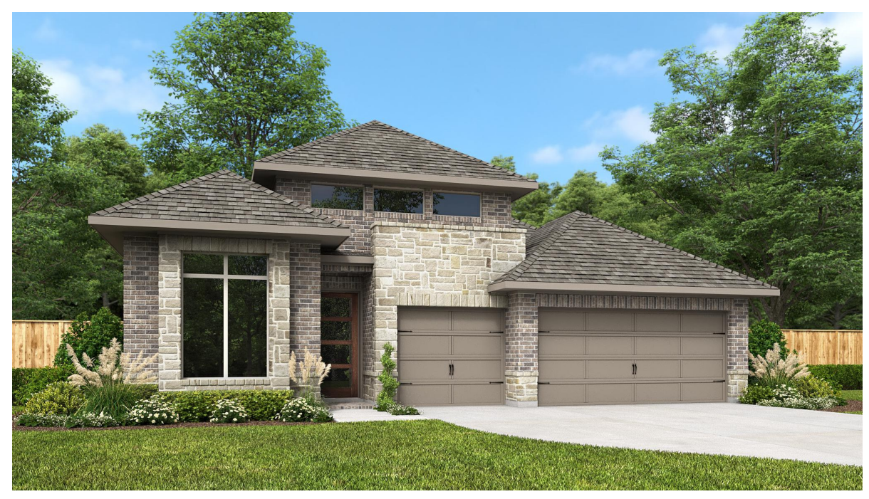
DESIGN 2695P E-51

This design, as originally designed and prior to any changes you make, is estimated to yield approximately the number of square feet shown on page 1. All dimensions are approximate. Square footage may vary based on as-built dimensions, configurations, plan options and/or the method of calculation. Designs are not-to-scale, and are conceptual illustrations that may differ from construction plans or completed improvements. A design may depict features not available on all homesites or in all communities. Perry Homes reserves the right to make changes in plans and specifications, and to substitute material of similar quality. Prices, terms, promotions, plans, dimensions, features, options, amenities, elevations, designs, square footages, specifications, materials, and availability of homes or communities are subject to change without notice or obligation. All obligations will be governed by a written contract. This design does not constitute a commitment to build a particular floor plan or home in any given community of the property of perry Homes. LLC and may require additional charges. Please check with Perry Homes to verify current offerings in the communities you are considering. This rendering is the property of Perry Homes. LLC. Any reproduction or exhibition is strictly prohibited. © Perry Homes. LLC 2023