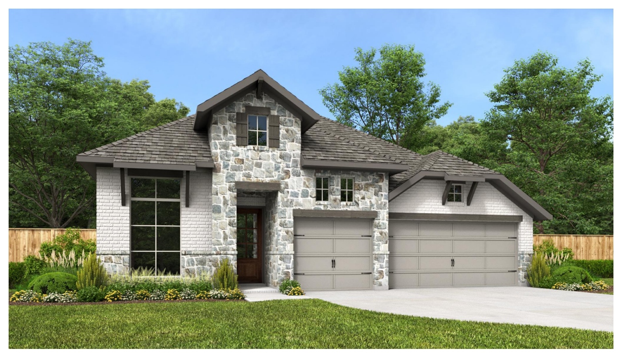
DESIGN 2695P E-1