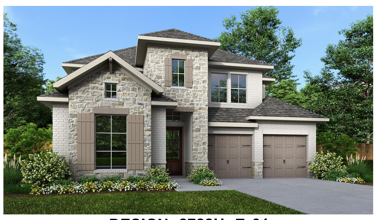
DESIGN 2722H E-31