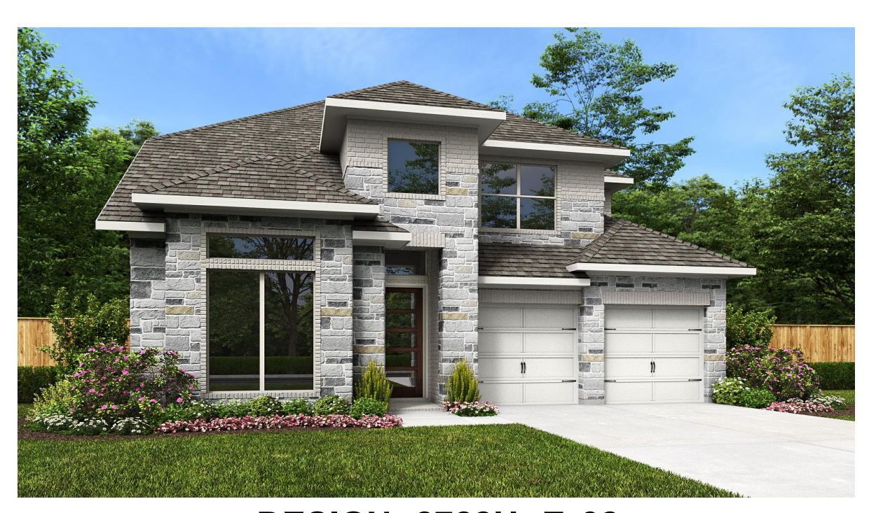
DESIGN 2722H E-32

This design, as originally designed and prior to any changes you make, is estimated to yield approximately the number of square feet shown on page 1. All dimensions are approximate. Square footage ma vary based on as-built dimensions, configurations, plan options and/or the method of calculation. Designs are not-to-scale, and are conceptual illustrations that may differ from construction plans or completed improvements. A design may depict features not available on all homesites or in all communities. Perry Homes reserves the right to make changes in plans and specifications, and to substitute material or similar quality. Prices, terms, promotions, plans, dimensions, features, options, amenities, elevations, designs, square footages, specifications, materials, and availability of homes or communities are subject to change without notice or obligation. All obligations will be governed by a written contract. This design does not constitute a commitment to build a particular floor plan or home in any given community. Some floor plans, options, and/or elevations may not be available on certain homesites or in a particular community and may require additional charges. Please check with Perry Homes to verify current offerings in the communities you are considering. This rendering is the property of Perry Homes, LLC. Any reproduction or exhibition is strictly prohibited. Perry Homes, LLC 2024