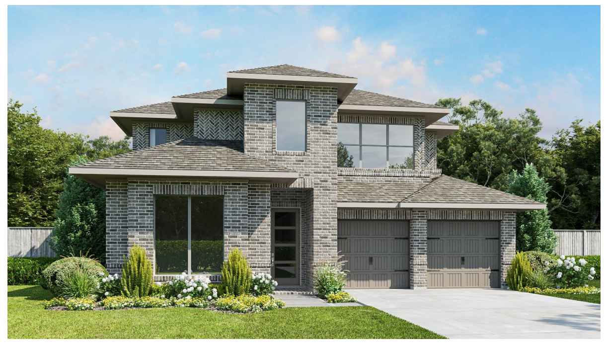
DESIGN 2722H E-1