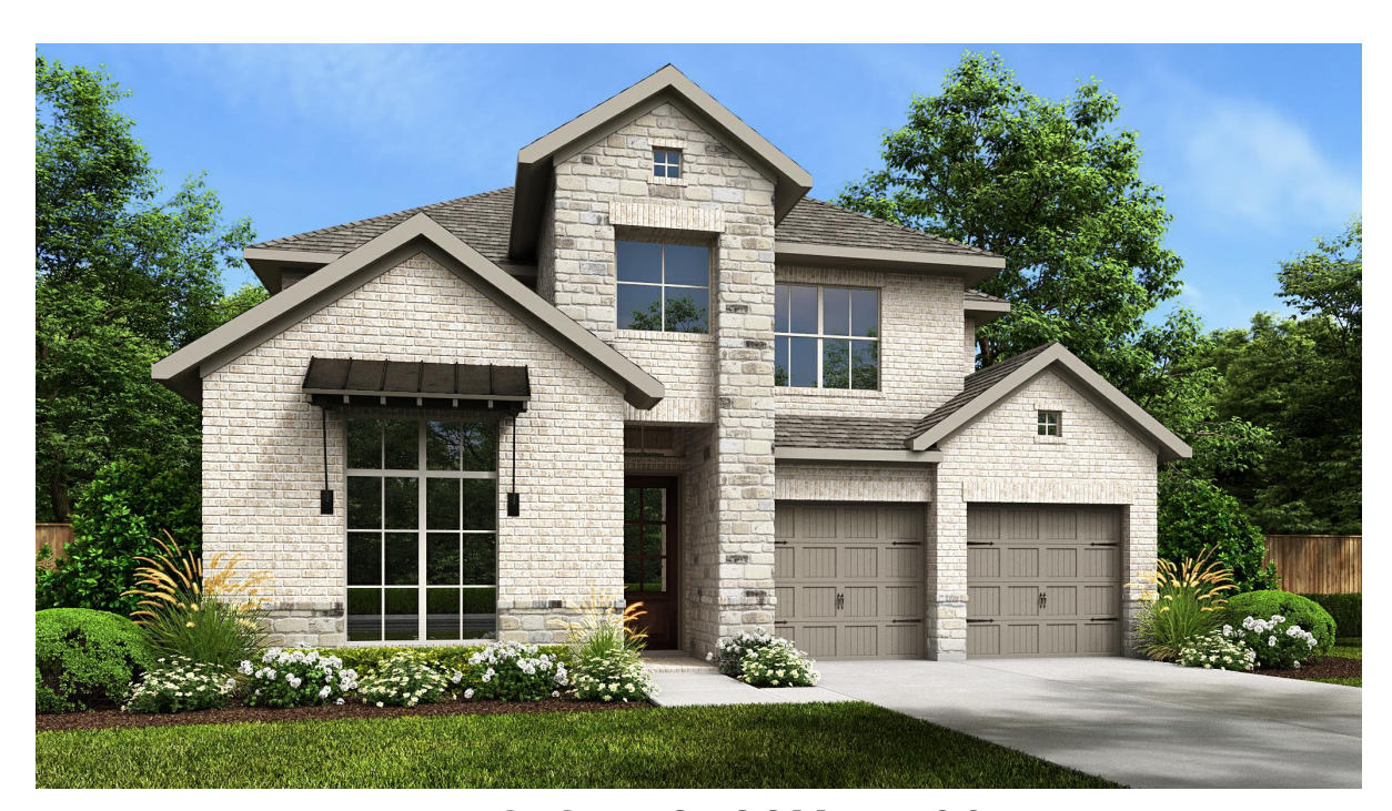
DESIGN 2722H E-30