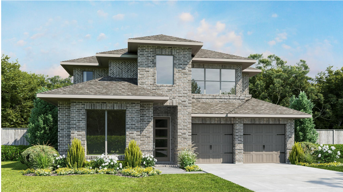
DESIGN 2722H E-1