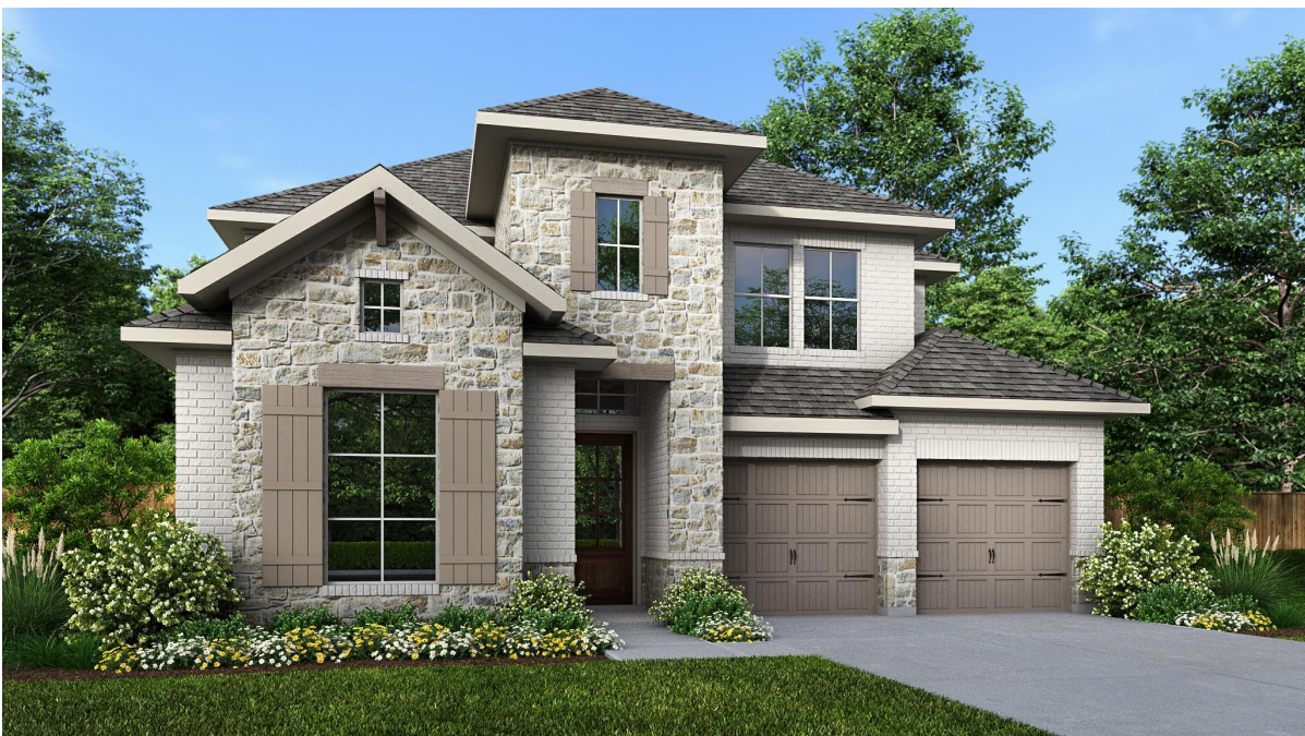
DESIGN 2722H E-31