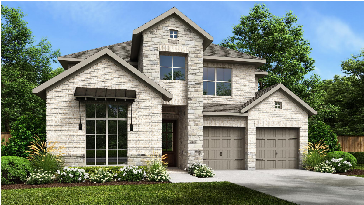
DESIGN 2722H E-30