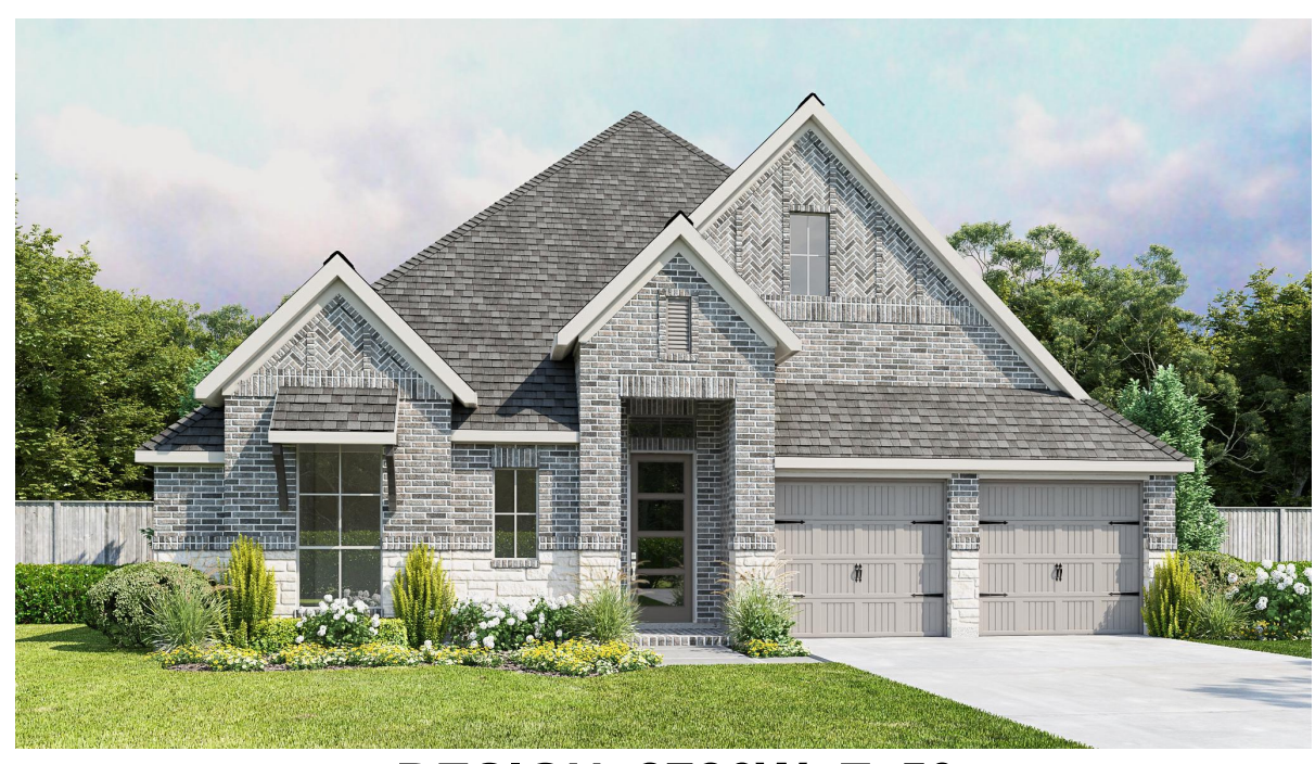
DESIGN 2726W E-50