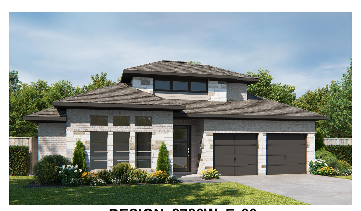
DESIGN 2726W E-30