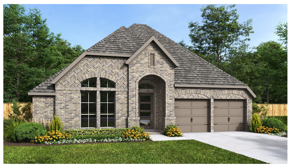
DESIGN 2726W E-1