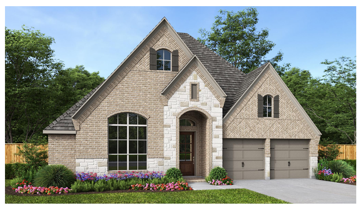
DESIGN 2726W E-70

This design, as originally designed and prior to any changes you make, is estimated to yield approximately the number of square feet shown on page 1. All dimensions are approximate. Square footage ma vary based on as-built dimensions, configurations, plan options and/or the method of calculation. Designs are not-to-scale, and are conceptual illustrations that may differ from construction plans or completed improvements. A design may depict features not available on all homesites or in all communities. Perry Homes reserves the right to make changes in plans and specifications, and to substitute material or similar quality. Prices, terms, promotions, plans, dimensions, features, options, amenities, elevations, designs, square footages, specifications, materials, and availability of homes or communities are subject to change without notice or obligation. All obligations will be governed by a written contract. This design does not constitute a commitment to build a particular floor plan or home in any given community. Some floor plans, options, and/or elevations may not be available on certain homesites or in a particular community and may require additional charges. Please check with Perry Homes to verify current offerings in the communities you are considering. This rendering is the property of Perry Homes, LLC. Any reproduction or exhibition is strictly prohibited. Perry Homes, LLC 2023