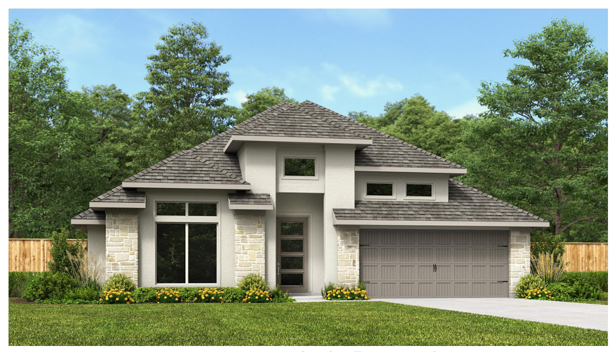
DESIGN 2737P E-50

This design, as originally designed and prior to any changes you make, is estimated to yield approximately the number of square feet shown on page 1. All dimensions are approximate. Square footage may vary based on as-built dimensions, configurations, plan options and/or the method of calculation. Designs are not-to-scale, and are conceptual illustrations that may differ from construction plans or completed improvements. A design may depict features not available on all homesites or in all communities. Perry Homes reserves the right to make changes in plans and specifications, and to substitute material of similar quality. Prices, terms, promotions, plans, dimensions, features, options, amenities, elevations, designs, square footages, specifications, materials, and availability of homes or communities are subject to change without notice or obligation. All obligations will be governed by a written contract. This design does not constitute a commitment to build a particular floor plan or home in any given community some floor plans, options, and/or elevations may not be available on certain homesites or in a particular community and may require additional charges. Please check with Perry Homes to verify current offerings in the communities you are considering. This rendering is the property of Perry Homes. LLC. Any reproduction or exhibition is strictly prohibited. © Perry Homes. LLC. 2025