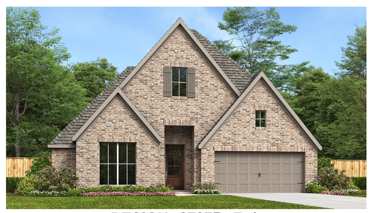
DESIGN 2737P E-1