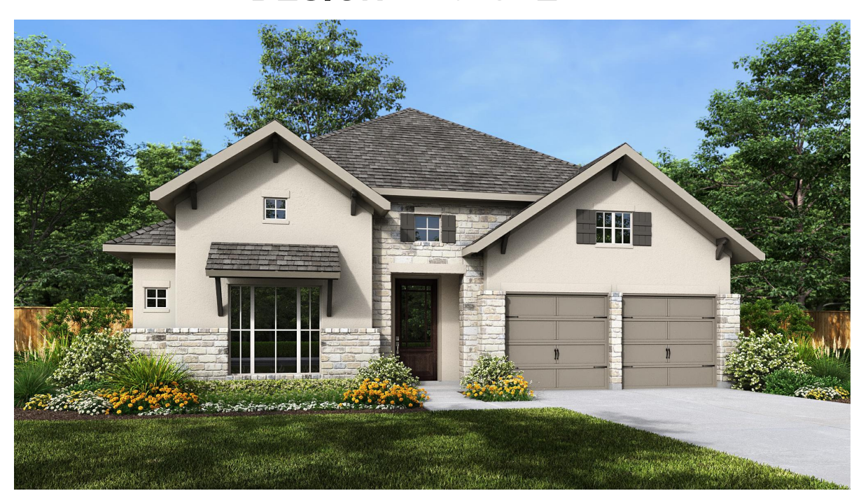
DESIGN 2737S E-30