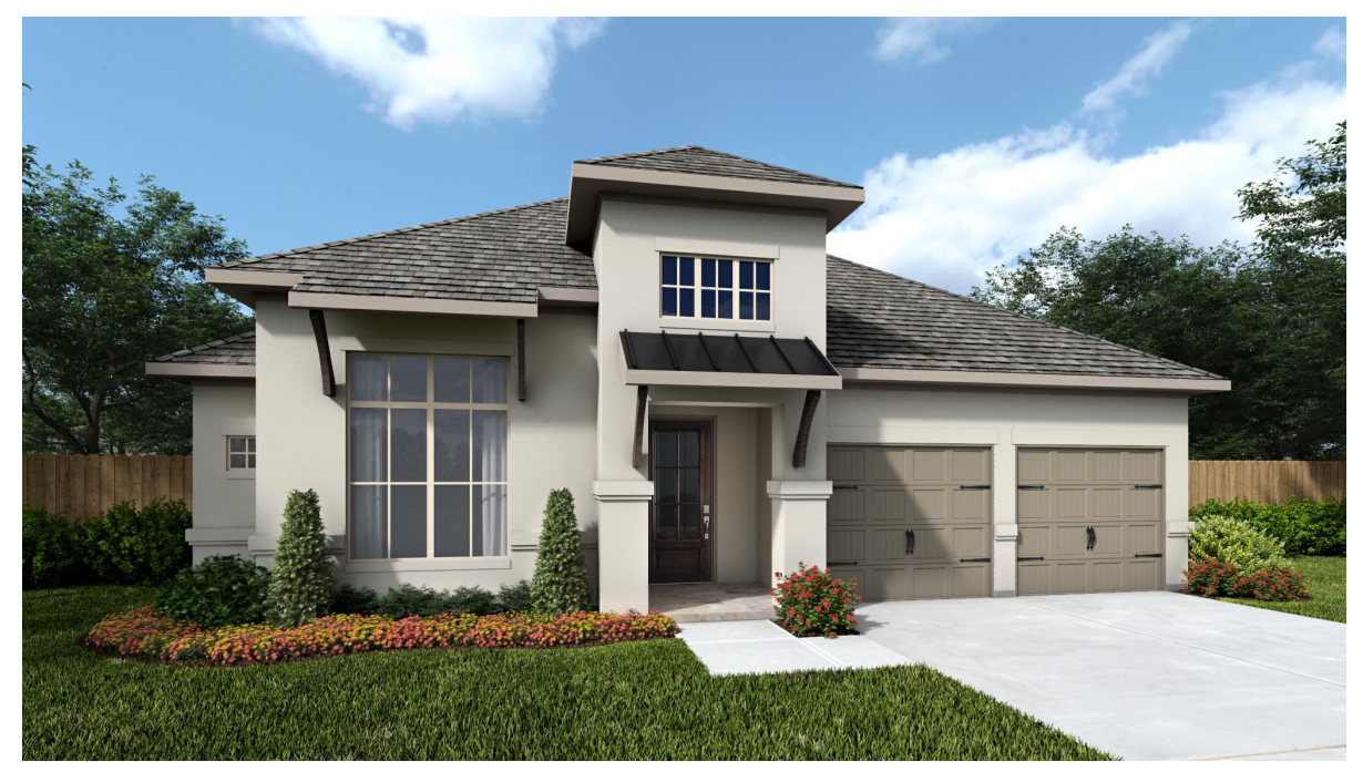
DESIGN 2737S E-1