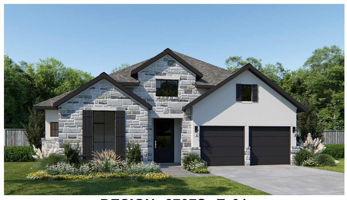
DESIGN 2737S E-31

This design, as originally designed and prior to any changes you make, is estimated to yield approximately the number of square feet shown on page 1. All dimensions are approximate. Square footage may vary based on as-built dimensions, configurations, plan options and/or the method of calculation. Designs are not-to-scale, and are conceptual illustrations that may differ from construction plans or completed improvements. A design may depict features not available on all homesites or in all communities. Perry Homes reserves the right to make changes in plans and specifications, and to substitute material of similar quality. Prices, terms, promotions, plans, dimensions, features, options, amenities, elevations, designs, square footages, specifications, materials, and availability of homes or communities are subject to change without notice or obligation. All obligations will be governed by a written contract. This design does not constitute a commitment to build a particular floor plan or home in any given community Some floor plans, options, and/or elevations may not be available on certain homesites or in a particular community and may require additional charges. Please check with Perry Homes to verify current offerings in the communities you are considering. This rendering is the property of Perry Homes LLC. Any reproduction or exhibition is strictly prohibited. @ Perry Homes LLC. 2019.