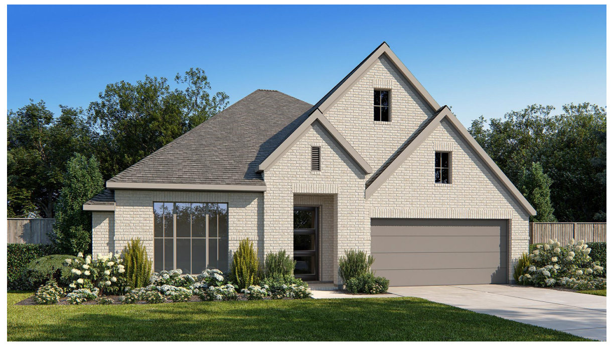
DESIGN 2738P E-1