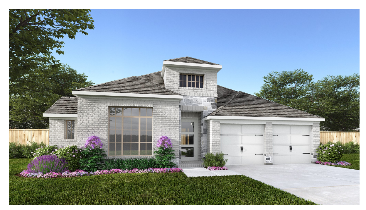
DESIGN 2738W E-32