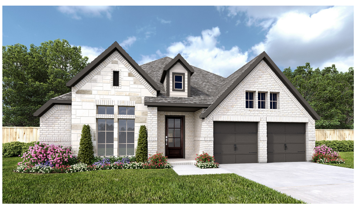
DESIGN 2738W E-31