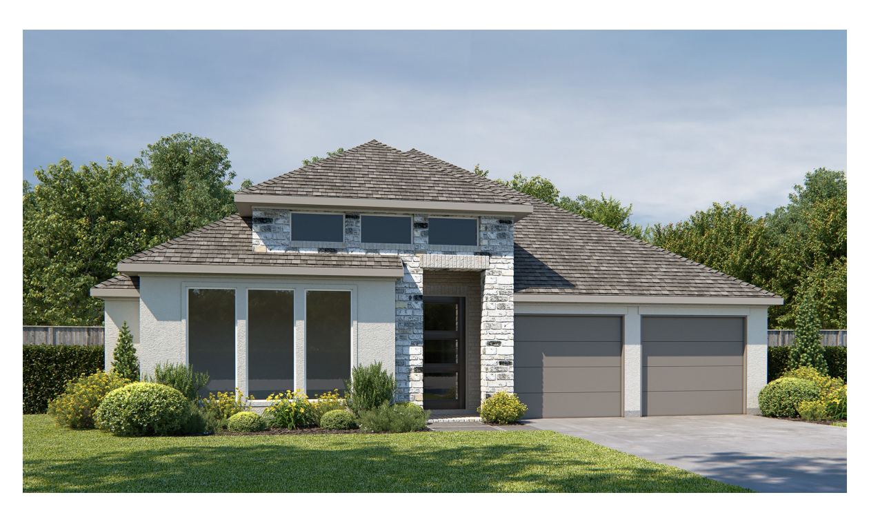
DESIGN 2738W E-33

This design, as originally designed and prior to any changes you make, is estimated to yield approximately the number of square feet shown on page 1. All dimensions are approximate. Square footage may vary based on as-built dimensions, configurations, plan options and/or the method of calculation. Designs are not-to-scale, and are conceptual illustrations that may differ from construction plans or completed improvements. A design may depict features not available on all homesites or in all communities. Perry Homes reserves the right to make changes in plans and specifications, and to substitute material of similar quality. Prices, terms, promotions, plans, dimensions, features, options, amenities, elevations, designs, square footages, specifications, materials, and availability of homes or communities are subject to change without notice or obligation. All obligations will be governed by a written contract. This design does not constitute a commitment to build a particular floor plan or home in any given community Some floor plans, options, and/or elevations may not be available on certain homesites or in a particular community and may require additional charges. Please check with Perry Homes to verify current offerings in the communities are considering. This rendering is the property of Perry Homes 11 C. Any reproduction or exhibition is strictly prohibited @ Perry Homes 11 C. 2023