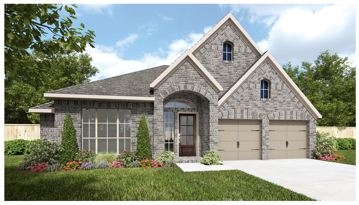
DESIGN 2738W E-1