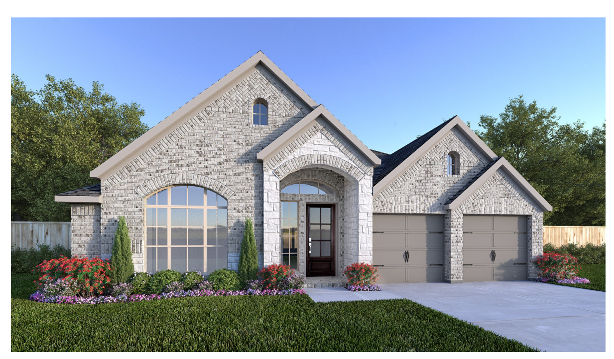
DESIGN 2738W E-30