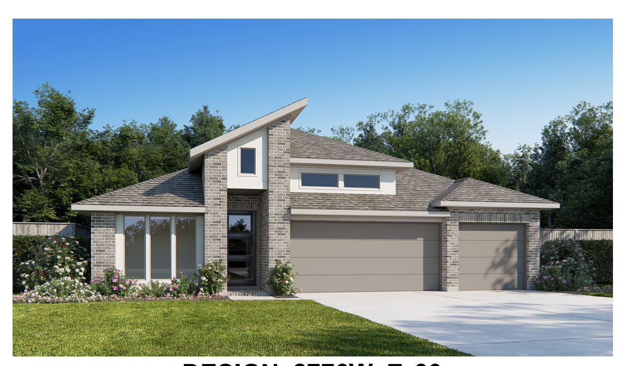
DESIGN 2776W E-30