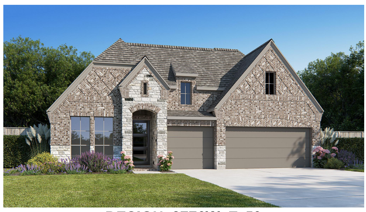
DESIGN 2776W E-50