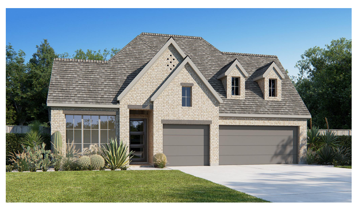
DESIGN 2776W E-71

This design, as originally designed and prior to any changes you make, is estimated to yield approximately the number of square feet shown on page 1. All dimensions are approximate. Square footage ma vary based on as-built dimensions, configurations, plan options and/or the method of calculation. Designs are not-to-scale, and are conceptual illustrations that may differ from construction plans or completed improvements. A design may depict features not available on all homesites or in all communities. Perry Homes reserves the right to make changes in plans and specifications, and to substitute material or similar quality. Prices, terms, promotions, plans, dimensions, features, options, amenities, elevations, designs, square footages, specifications, materials, and availability of homes or communities are subject to change without notice or obligation. All obligations will be governed by a written contract. This design does not constitute a commitment to build a particular floor plan or home in any given community. Some floor plans, options, and/or elevations may not be available on certain homesites or in a particular community and may require additional charges. Please check with Perry Homes to verify current offerings in the communities you are considering. This rendering is the property of Perry Homes, LLC. Any reproduction or exhibition is strictly prohibited. Perry Homes, LLC 2024