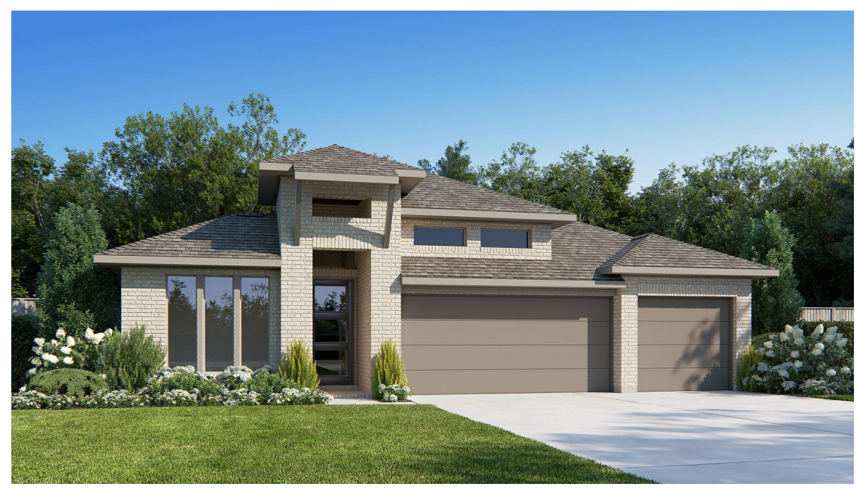
DESIGN 2776W E-1