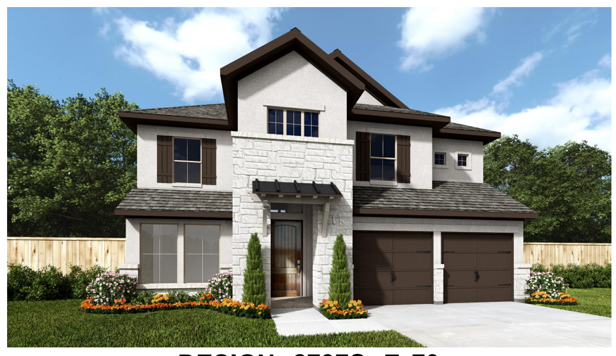
DESIGN 2797S E-70

This design, as originally designed and prior to any changes you make, is estimated to yield approximately the number of square feet shown on page 1. All dimensions are approximate. Square footage may vary based on as-built dimensions, configurations, plan options and/or the method of calculation. Designs are not-to-scale, and are conceptual illustrations that may differ from construction plans or completed improvements. A design may depict features not available on all homesites or in all communities. Perry Homes reserves the right to make changes in plans and specifications, and to substitute material of similar quality. Prices, terms, promotions, plans, dimensions, features, options, amenities, elevations, designs, square footages, specifications, materials, and availability of homes or communities evaluate to change without notice or obligation. All obligations will be governed by a written contract. This design does not constitute a commitment to build a particular floor plan or home in any given community. Some floor plans, options, and/or elevations may not be available on certain homesites or in a particular community and may require additional charges. Please check with Perry Homes to verify current offerings in the communities you are considering. This rendering is the property of Perry Homes. LLC. Any reproduction or exhibition is strictly prohibited. © Perry Homes. LLC.