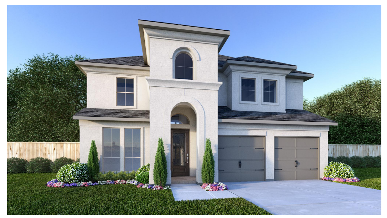
DESIGN 2797S E-1