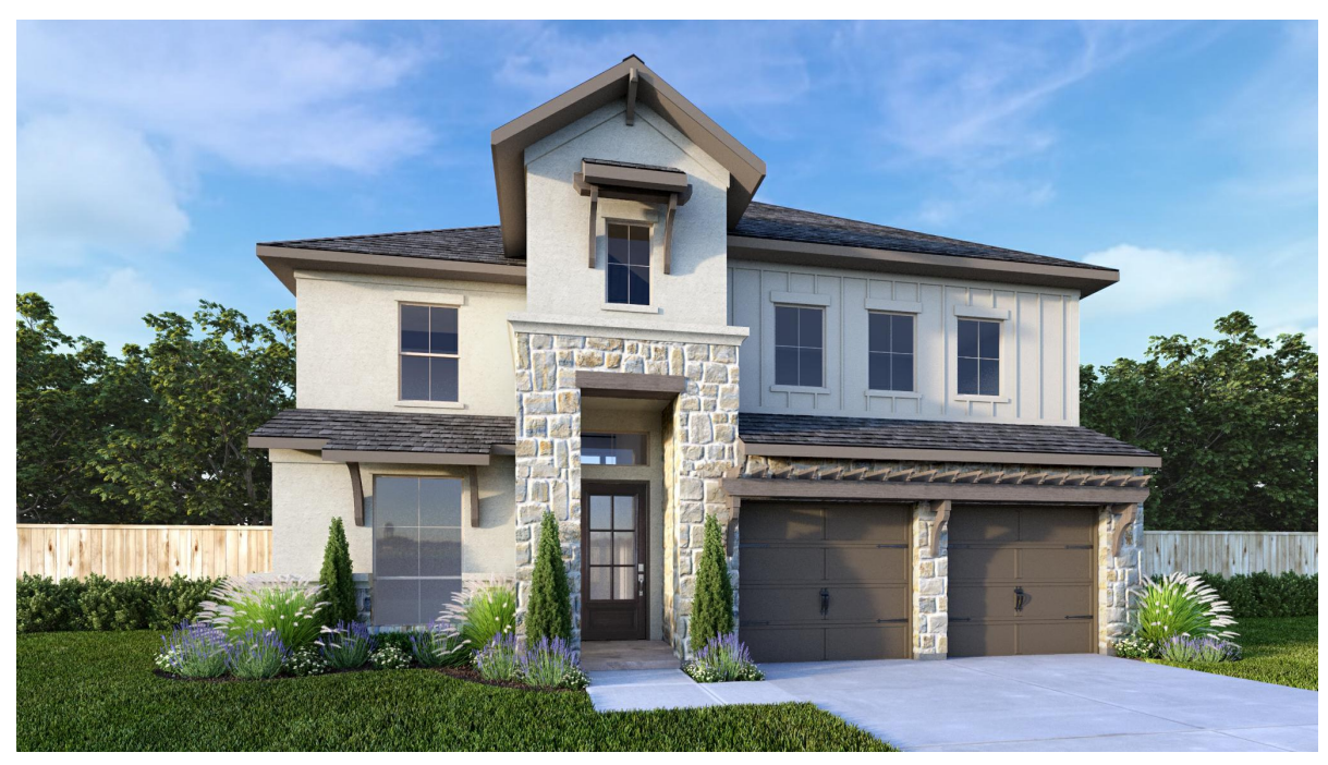
DESIGN 2797S E-50