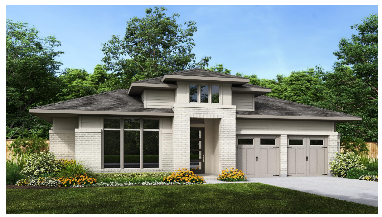
DESIGN 2837E E-1