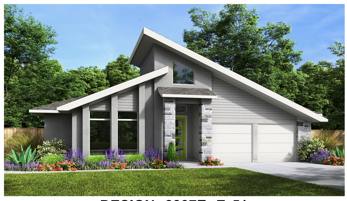
DESIGN 2837E E-51

This design, as originally designed and prior to any changes you make, is estimated to yield approximately the number of square feet shown on page 1. All dimensions are approximate. Square footage may vary based on as-built dimensions, configurations, plan options and/or the method of calculation. Designs are not-to-scale, and are conceptual illustrations that may differ from construction plans or completed improvements. A design may depict features not available on all homesites or in all communities. Perry Homes reserves the right to make changes in plans and specifications, and to substitute material of similar quality. Prices, terms, promotions, plans, dimensions, features, options, amenities, elevations, designs, square footages, specifications, materials, and availability of homes or communities are subject to change without notice or obligation. All obligations will be governed by a written contract. This design does not constitute a commitment to build a particular floor plan or home in any given community Some floor plans, options, and/or elevations may not be available on certain homesites or in a particular community and may require additional charges. Please check with Perry Homes to verify current offerings in the communities you are considering. This rendering is the property of Perry Homes. LLC. Any reproduction or exhibition is strictly prohibited. © Perry Homes. LLC 2018