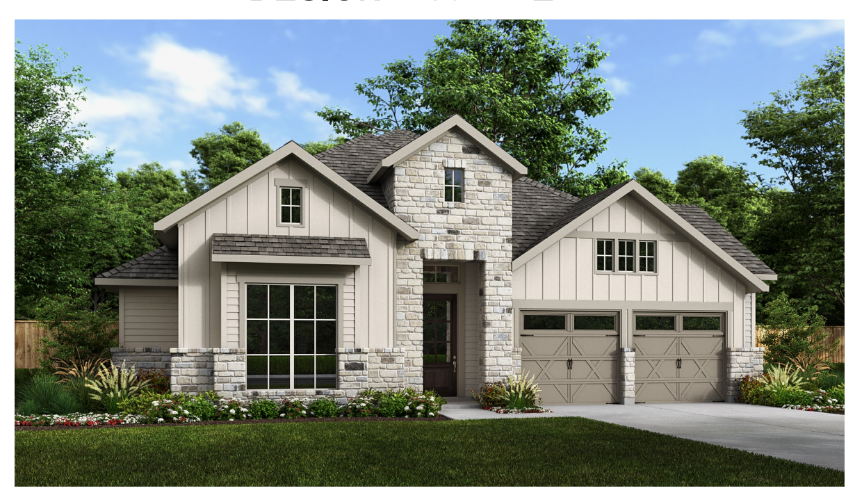
DESIGN 2837E E-30