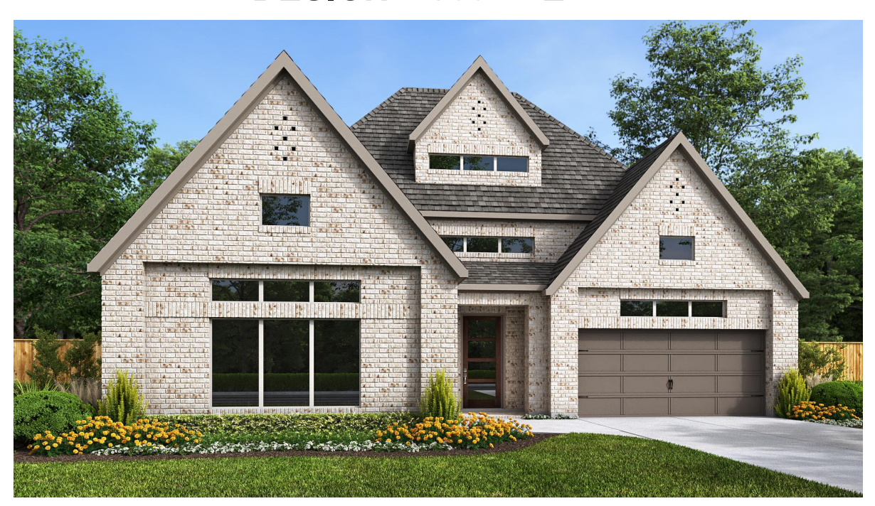
DESIGN 2850W E-30