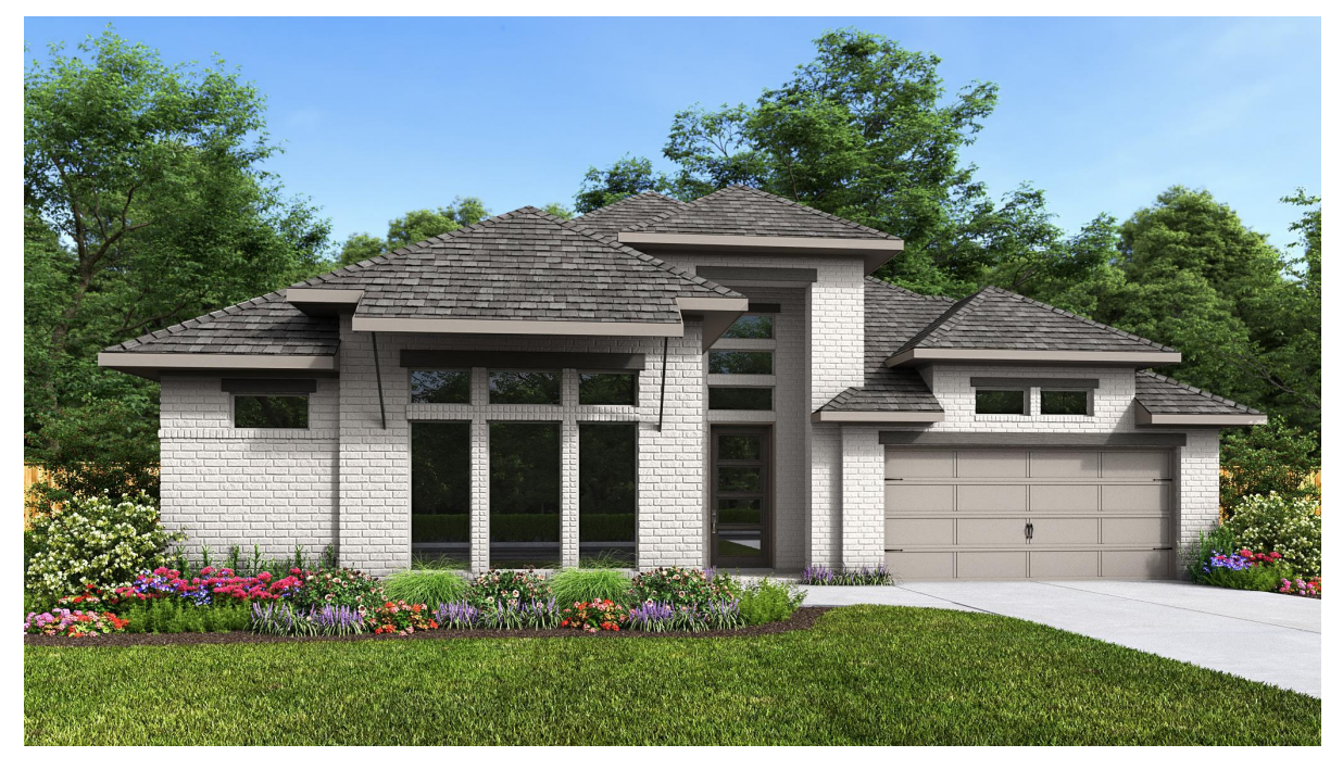
DESIGN 2850W E-1