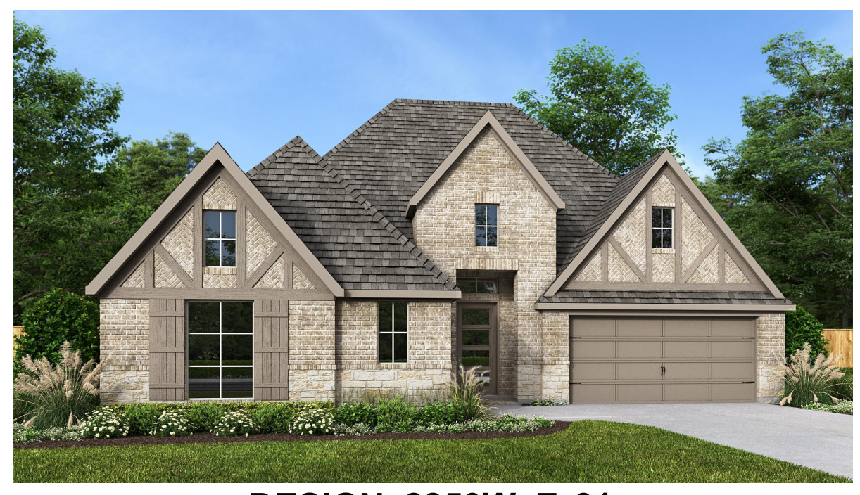
DESIGN 2850W E-31

This design, as originally designed and prior to any changes you make, is estimated to yield approximately the number of square feet shown on page 1. All dimensions are approximate. Square footage may vary based on as-built dimensions, configurations, plan options and/or the method of calculation. Designs are not-to-scale, and are conceptual illustrations that may differ from construction plans or completed improvements. A design may depict features not available on all homesites or in all communities. Perry Homes reserves the right to make changes in plans and specifications, and to substitute material of similar quality. Prices, terms, promotions, plans, dimensions, features, options, amenities, elevations, designs, square footages, specifications, materials, and availability of homes or communities evaluate to change without notice or obligation. All obligations will be governed by a written contract. This design does not constitute a commitment to build a particular floor plan or home in any given community. Some floor plans, options, and/or elevations may not be available on certain homesites or in a particular community and may require additional charges. Please check with Perry Homes to verify current offerings in the communities you are considering. This rendering is the property of Perry Homes. LLC. Any reproduction or exhibition is strictly prohibited. © Perry Homes. LLC 2023