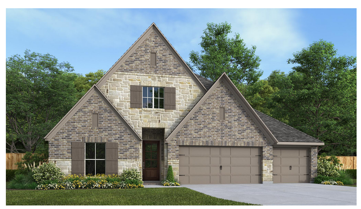
DESIGN 2895P E-50