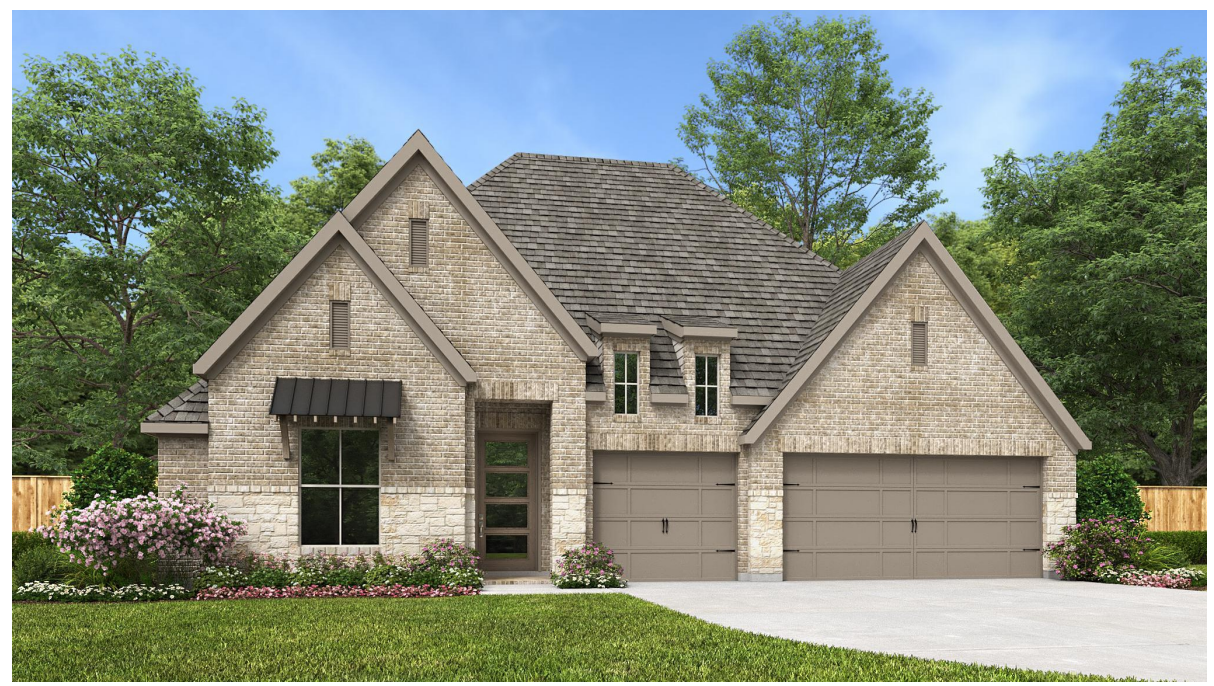
DESIGN 2895P E-1