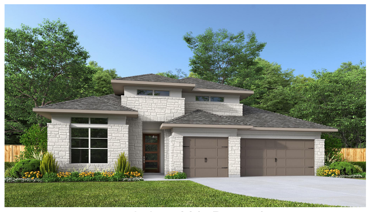
DESIGN 2895P E-70

This design, as originally designed and prior to any changes you make, is estimated to yield approximately the number of square feet shown on page 1. All dimensions are approximate. Square footage may vary based on as-built dimensions, configurations, plan options and/or the method of calculation. Designs are not-to-scale, and are conceptual illustrations that may differ from construction plans or completed improvements. A design may depict features not available on all homesites or in all communities. Perry Homes reserves the right to make changes in plans and specifications, and to substitute material of similar quality. Prices, terms, promotions, plans, dimensions, features, options, amenities, elevations, designs, square footages, specifications, materials, and availability of homes or communities are subject to change without notice or obligation. All obligations will be governed by a written contract. This design does not constitute a commitment to build a particular floor plan or home in any given community of the property of perry Homes. LLC and the community and may require additional charges. Please check with Perry Homes to verify current offerings in the communities you are considering. This rendering is the property of Perry Homes. LLC. Any reproduction or exhibition is strictly prohibited.