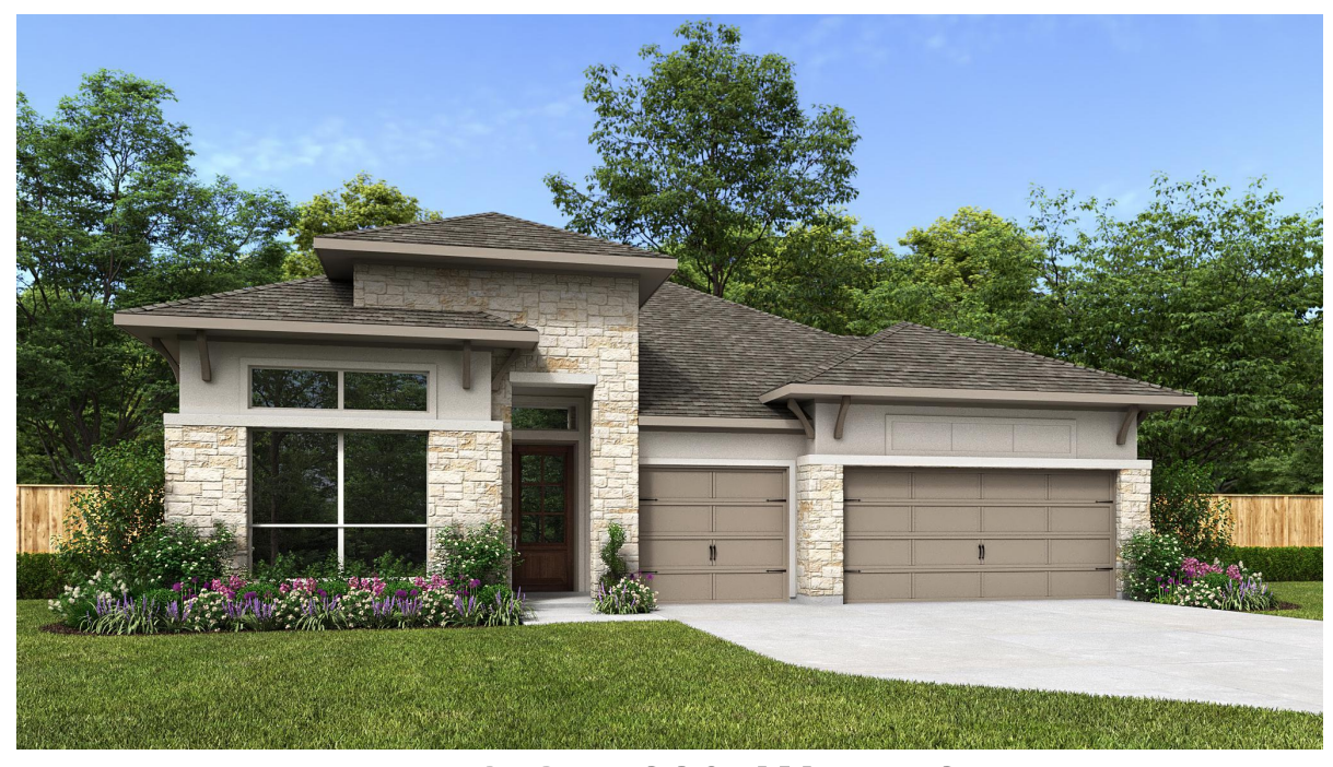
DESIGN 2895W E-72

This design, as originally designed and prior to any changes you make, is estimated to yield approximately the number of square feet shown on page 1. All dimensions are approximate. Square footage may vary based on as-built dimensions, configurations, plan options and/or the method of calculation. Designs are not-to-scale, and are conceptual illustrations that may differ from construction plans or completed improvements. A design may depict features not available on all homesites or in all communities. Perry Homes reserves the right to make changes in plans and specifications, and to substitute material of similar quality. Prices, terms, promotions, plans, dimensions, features, options, amenities, elevations, designs, square footages, specifications, materials, and availability of homes or communities are subject to change without notice or obligation. All obligations will be governed by a written contract. This design does not constitute a commitment to build a particular floor plan or home in any given community Some floor plans, options, and/or elevations may not be available on certain homesites or in a particular community and may require additional charges. Please check with Perry Homes to verify current offerings in the communities are considering. This rendering is the property of Perry Homes 11 C. Any reproduction or exhibition is strictly prohibited @ Perry Homes 11 C. 2023