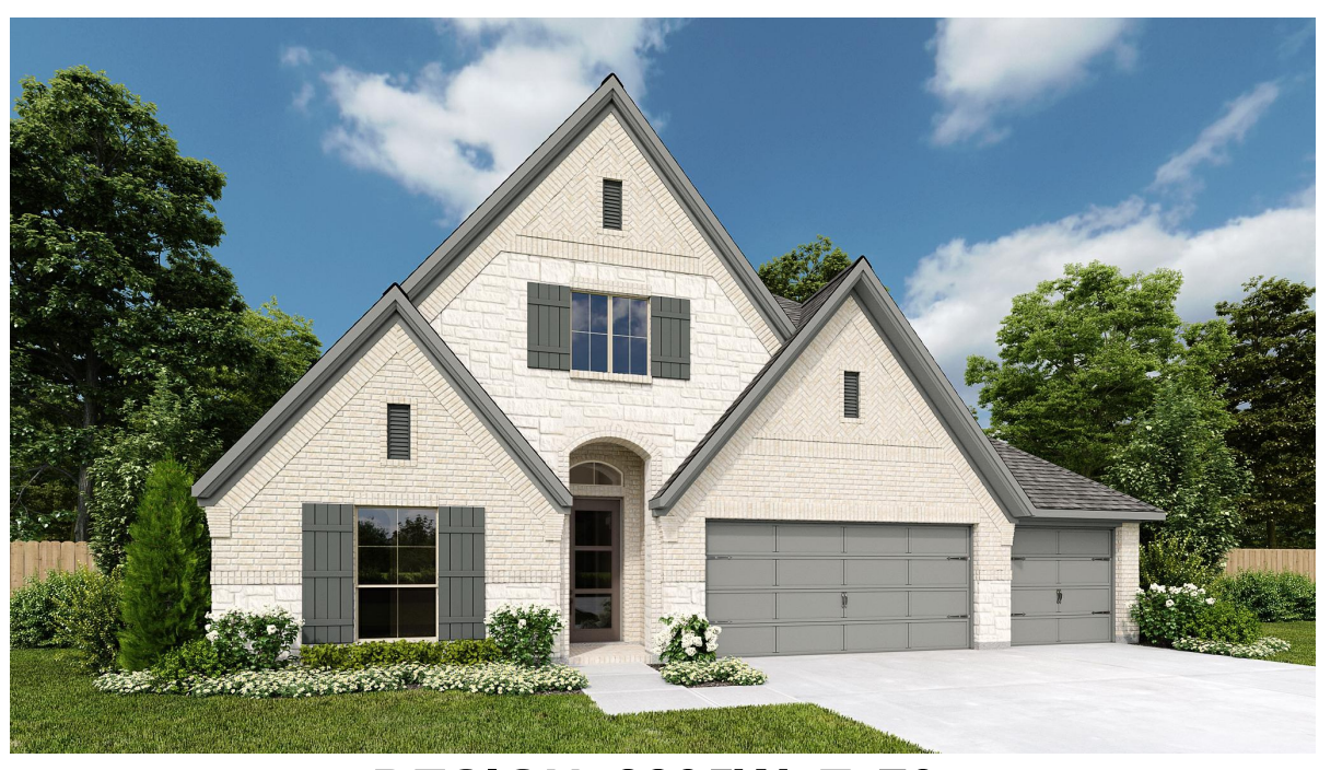
DESIGN 2895W E-70