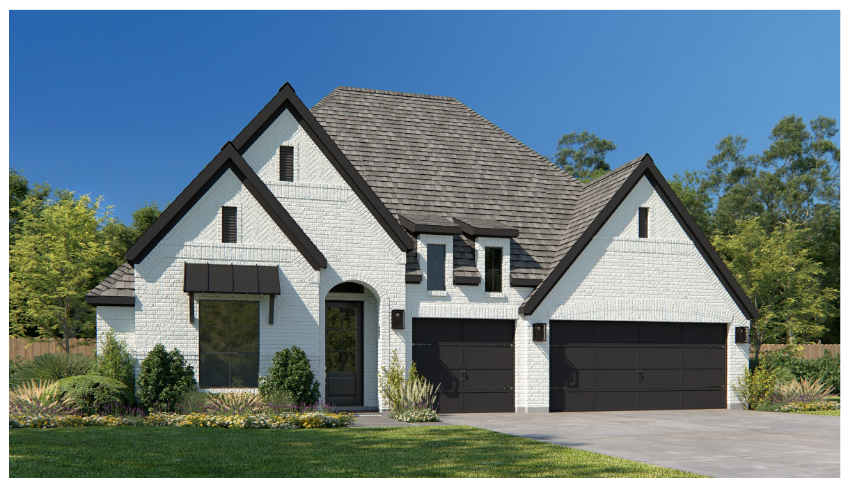
DESIGN 2895W E-1