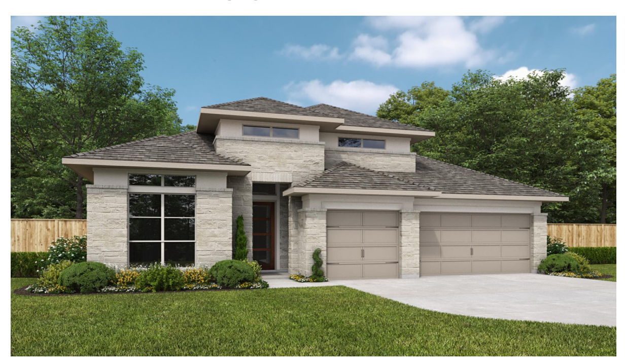
DESIGN 2895W E-71