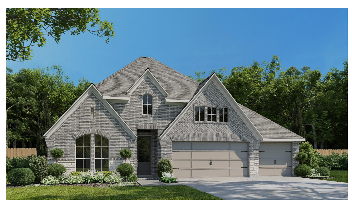
DESIGN 2895W E-50