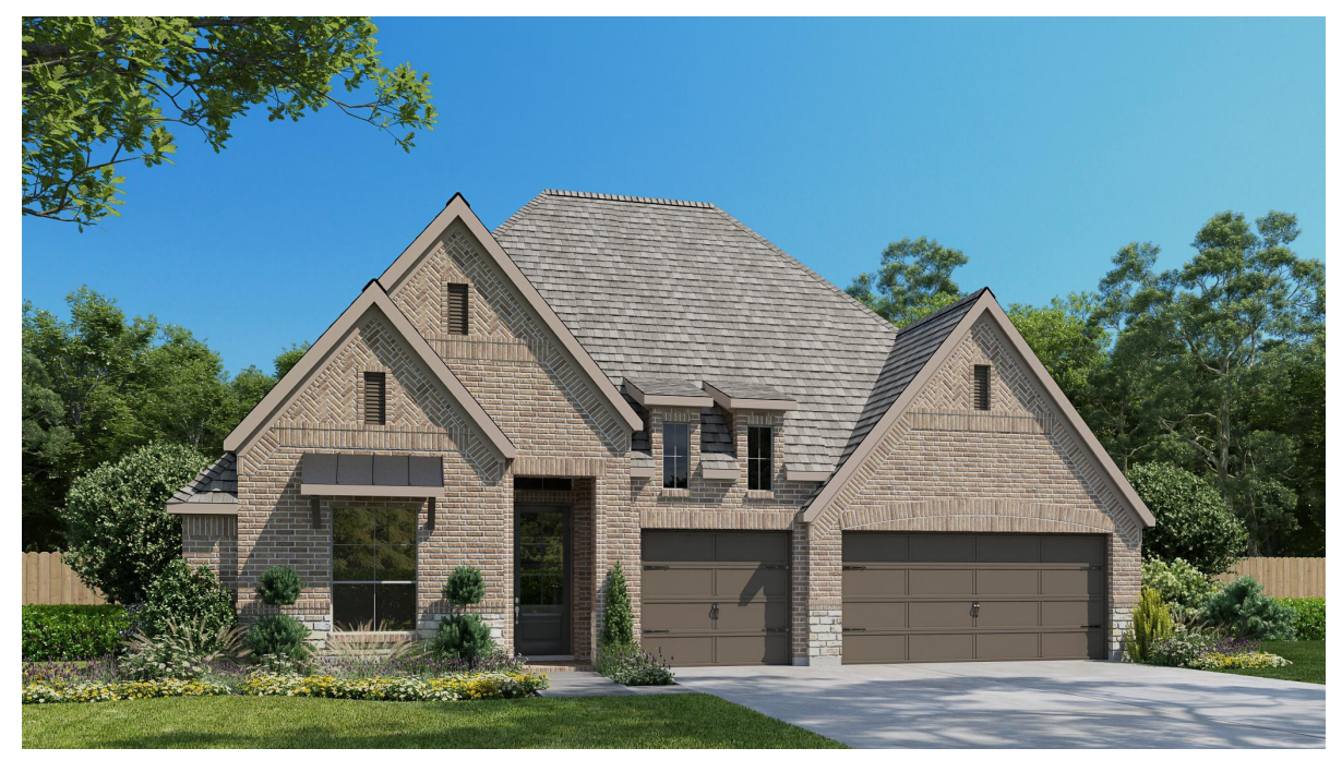
DESIGN 2895W E-30