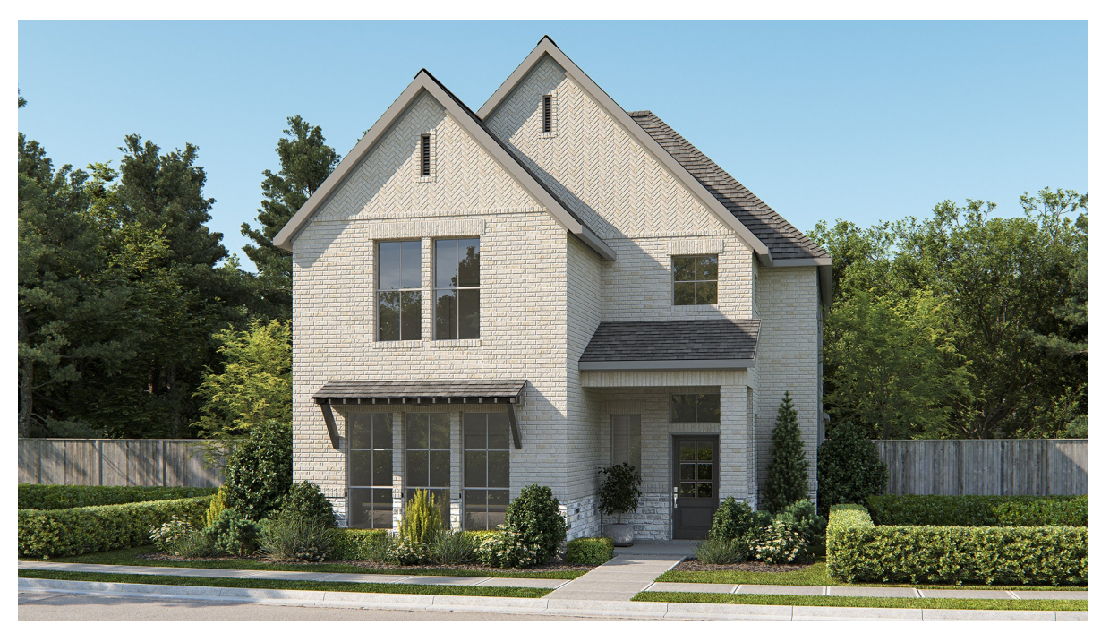
DESIGN 2903T E-1