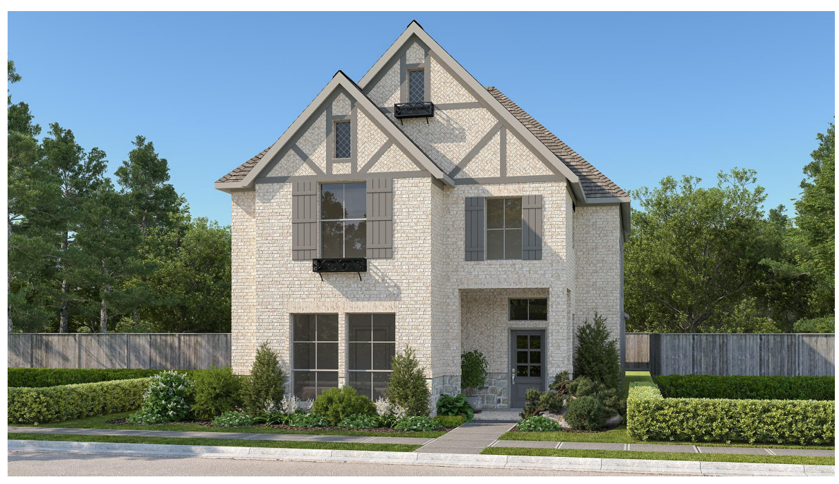
DESIGN 2903T E-2

This design, as originally designed and prior to any changes you make, is estimated to yield approximately the number of square feet shown on page 1. All dimensions are approximate. Square footage may vary based on as-built dimensions, configurations, plan options and/or the method of calculation. Designs are not-to-scale, and are conceptual illustrations that may differ from construction plans or completed improvements. A design may depict features not available on all homesites or in all communities. Perry Homes reserves the right to make changes in plans and specifications, and to substitute material of similar quality. Prices, terms, promotions, plans, dimensions, features, options, amenities, elevations, designs, square footages, specifications, materials, and availability of homes or communities are subject to change without notice or obligation. All obligations will be governed by a written contract. This design does not constitute a commitment to build a particular floor plan or home in any given community some floor plans, options, and/or elevations may not be available on certain homesites or in a particular community and may require additional charges. Please check with Perry Homes to verify current offerings in the communities you are considering. This rendering is the property of Perry Homes. LLC. Any reproduction or exhibition is strictly prohibited. © Perry Homes. LLC. 2025