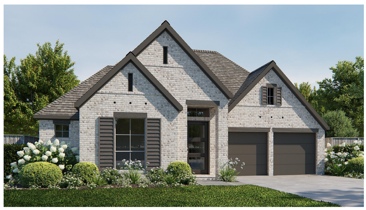
DESIGN 2911W E-1