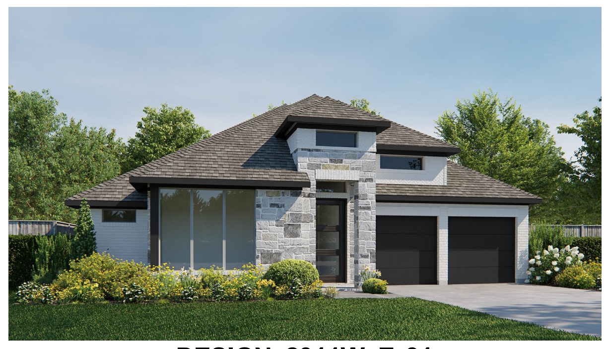
DESIGN 2911W E-31

This design, as originally designed and prior to any changes you make, is estimated to yield approximately the number of square feet shown on page 1. All dimensions are approximate. Square footage may vary based on as-built dimensions, configurations, plan options and/or the method of calculation. Designs are not-to-scale, and are conceptual illustrations that may differ from construction plans or completed improvements. A design may depict features not available on all homesites or in all communities. Perry Homes reserves the right to make changes in plans and specifications, and to substitute material of similar quality. Prices, terms, promotions, plans, dimensions, features, options, amenities, elevations, designs, square footages, specifications, materials, and availability of homes or communities are subject to change without notice or obligation. All obligations will be governed by a written contract. This design does not constitute a commitment to build a particular floor plan or home in any given community Some floor plans, options, and/or elevations may not be available on certain homesites or in a particular community and may require additional charges. Please check with Perry Homes to verify current offerings in the communities you are considering. This rendering is the property of Perry Homes LLC. Any reproduction or exhibition is strictly corphibited. @ Perry Homes LLC. Perry Homes LLC.