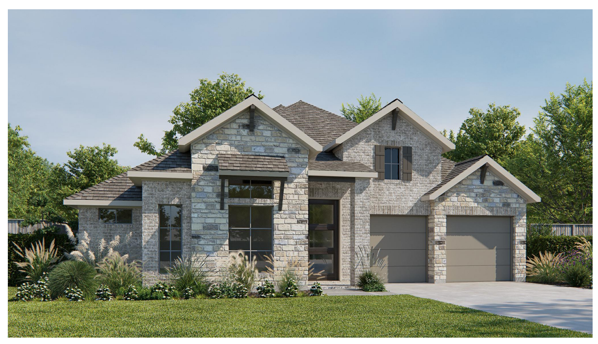
DESIGN 2911W E-30