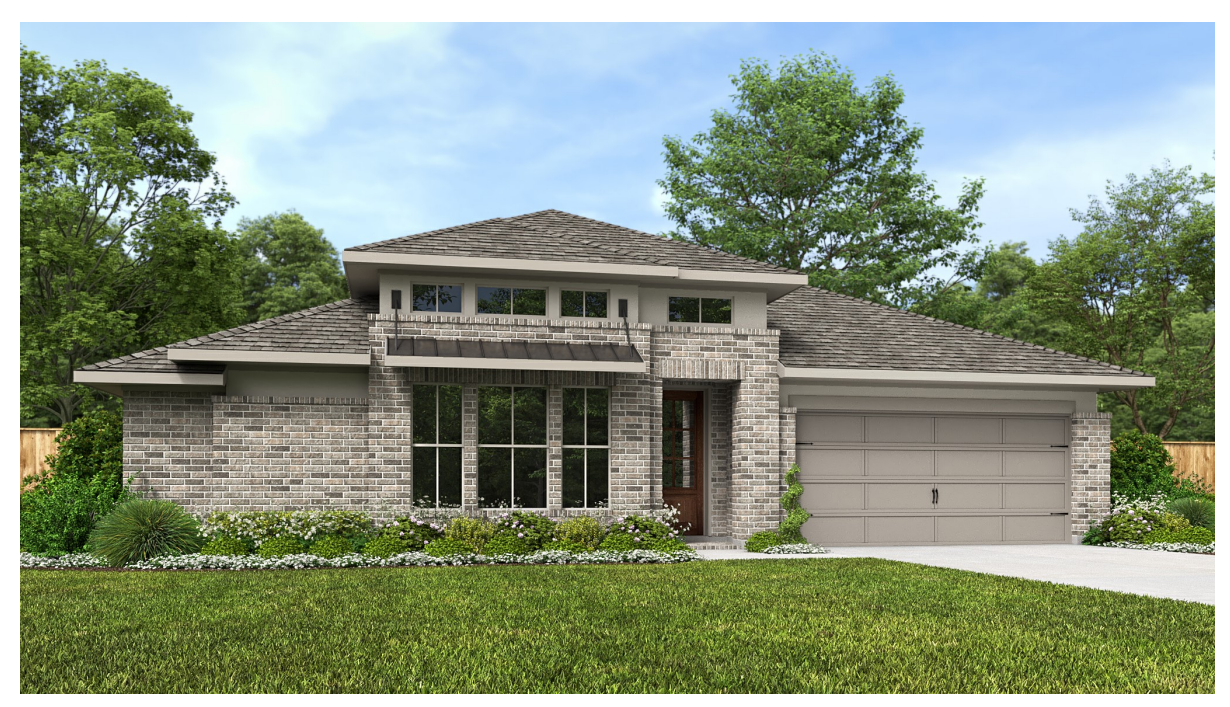
DESIGN 2916P E-1