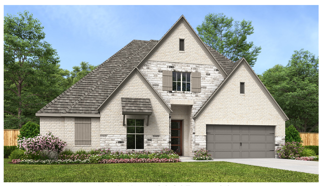
DESIGN 2916P E-90

This design, as originally designed and prior to any changes you make, is estimated to yield approximately the number of square feet shown on page 1. All dimensions are approximate. Square footage may vary based on as-built dimensions, configurations, plan options and/or the method of calculation. Designs are not-to-scale, and are conceptual illustrations that may differ from construction plans or completed improvements. A design may depict features not available on all homesites or in all communities. Perry Homes reserves the right to make changes in plans and specifications, and to substitute material of similar quality. Prices, terms, promotions, plans, dimensions, features, options, amenities, elevations, designs, square footages, specifications, materials, and availability of homes or communities are subject to change without notice or obligation. All obligations will be governed by a written contract. This design does not constitute a commitment to build a particular floor plan or home in any given community of the property of perry Homes. LLC and may require additional charges. Please check with Perry Homes to verify current offerings in the communities you are considering. This rendering is the property of Perry Homes. LLC. Any reproduction or exhibition is strictly prohibited. © Perry Homes. LLC 2023