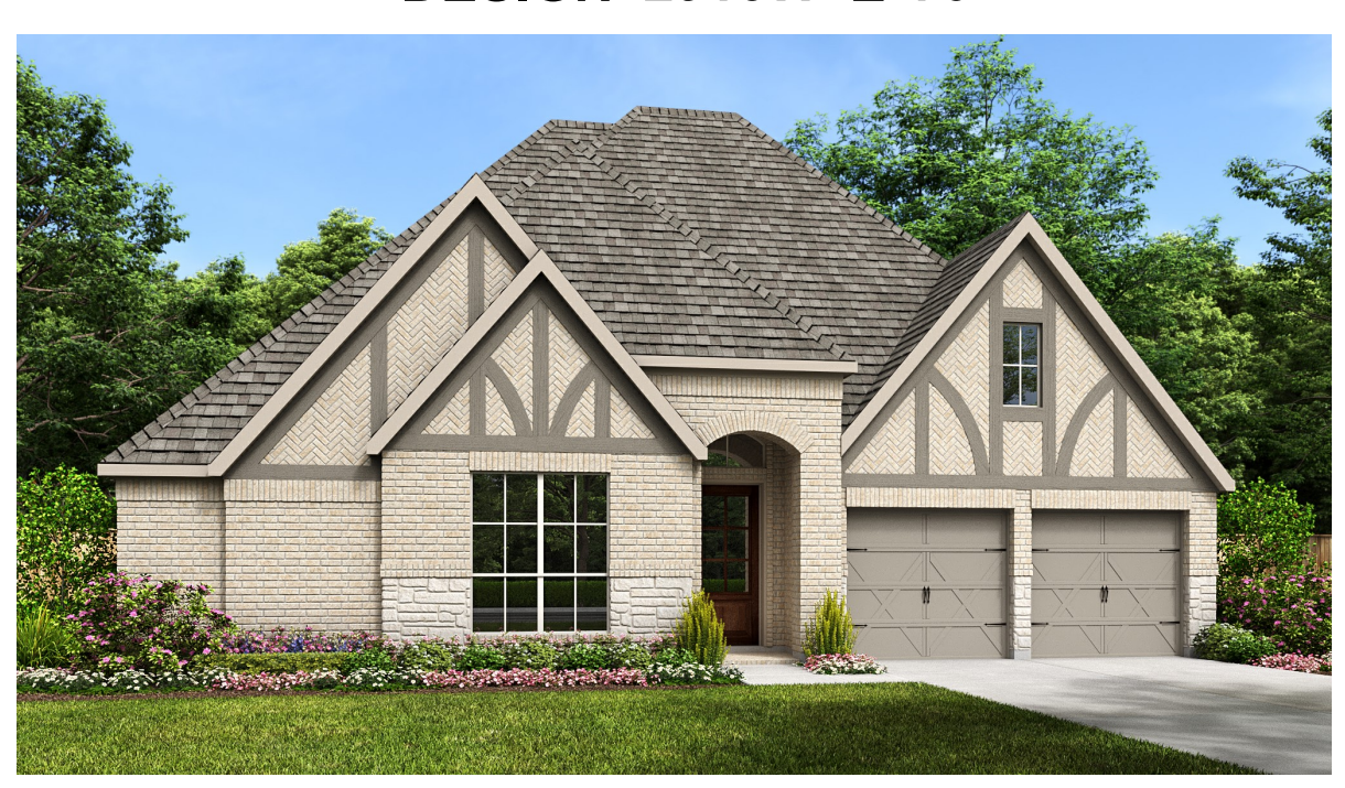
DESIGN 2916W E-71