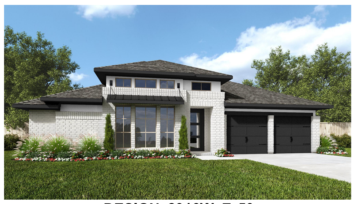
DESIGN 2916W E-50