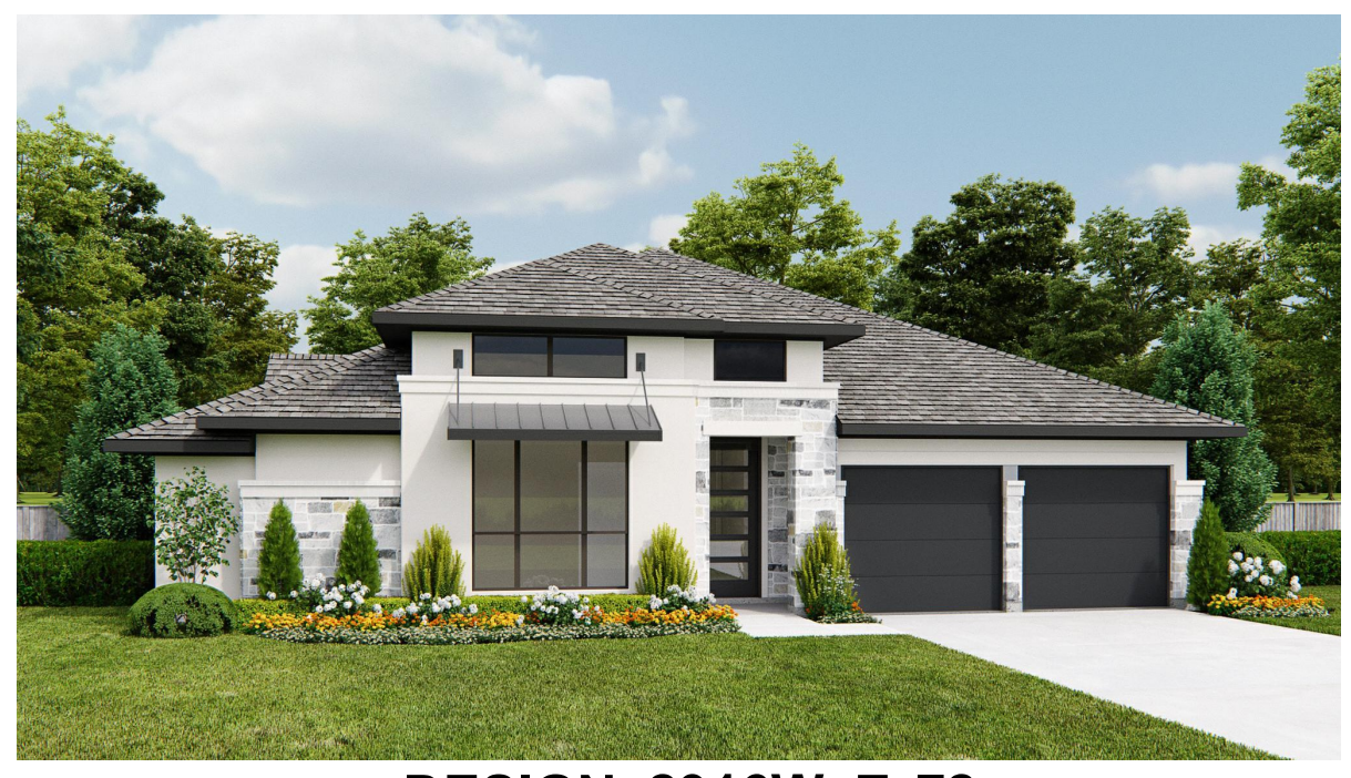
DESIGN 2916W E-72

This design, as originally designed and prior to any changes you make, is estimated to yield approximately the number of square feet shown on page 1. All dimensions are approximate. Square footage may vary based on as-built dimensions, configurations, plan options and/or the method of calculation. Designs are not-to-scale, and are conceptual illustrations that may differ from construction plans or completed improvements. A design may depict features not available on all homesites or in all communities. Perry Homes reserves the right to make changes in plans and specifications, and to substitute material of similar quality. Prices, terms, promotions, plans, dimensions, features, options, amenities, elevations, designs, square footages, specifications, materials, and availability of homes or communities are subject to change without notice or obligation. All obligations will be governed by a written contract. This design does not constitute a commitment to build a particular floor plan or home in any given community of the property of perry Homes. LLC and the community and may require additional charges. Please check with Perry Homes to verify current offerings in the communities you are considering. This rendering is the property of Perry Homes. LLC. Any reproduction or exhibition is strictly prohibited. © Perry Homes. LLC 2024