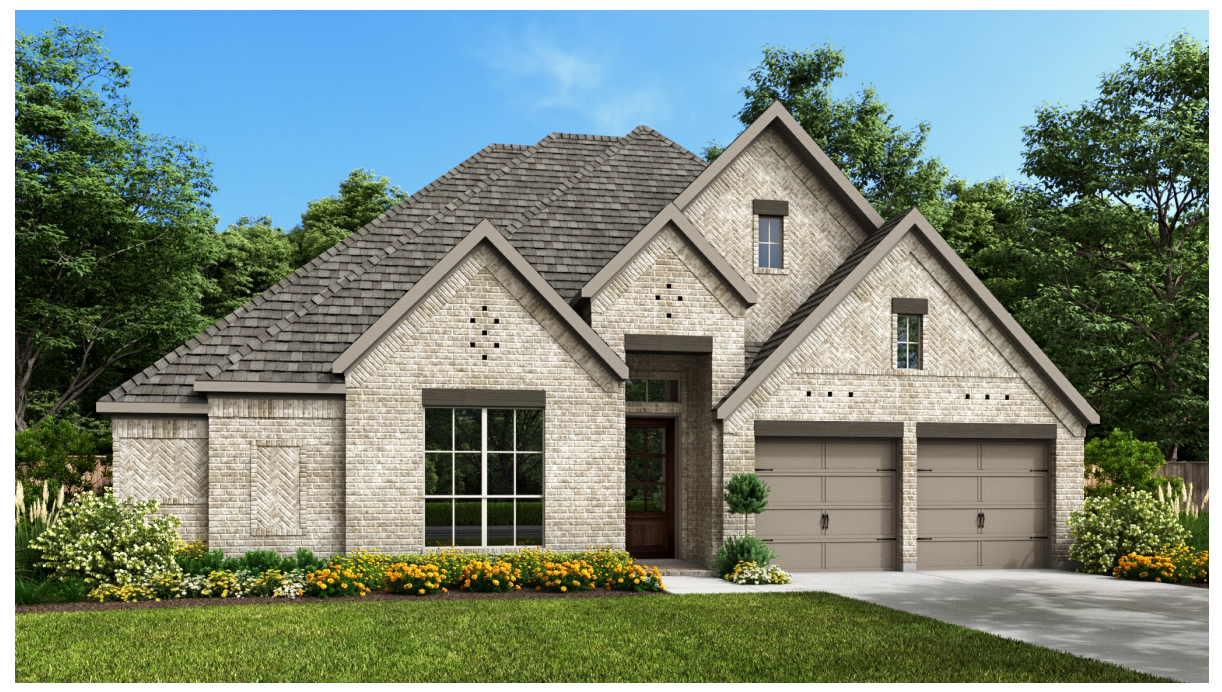
DESIGN 2916W E-1