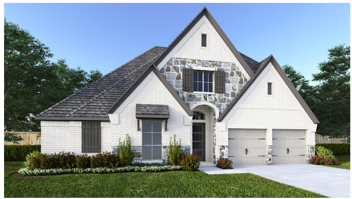
DESIGN 2916W E-70