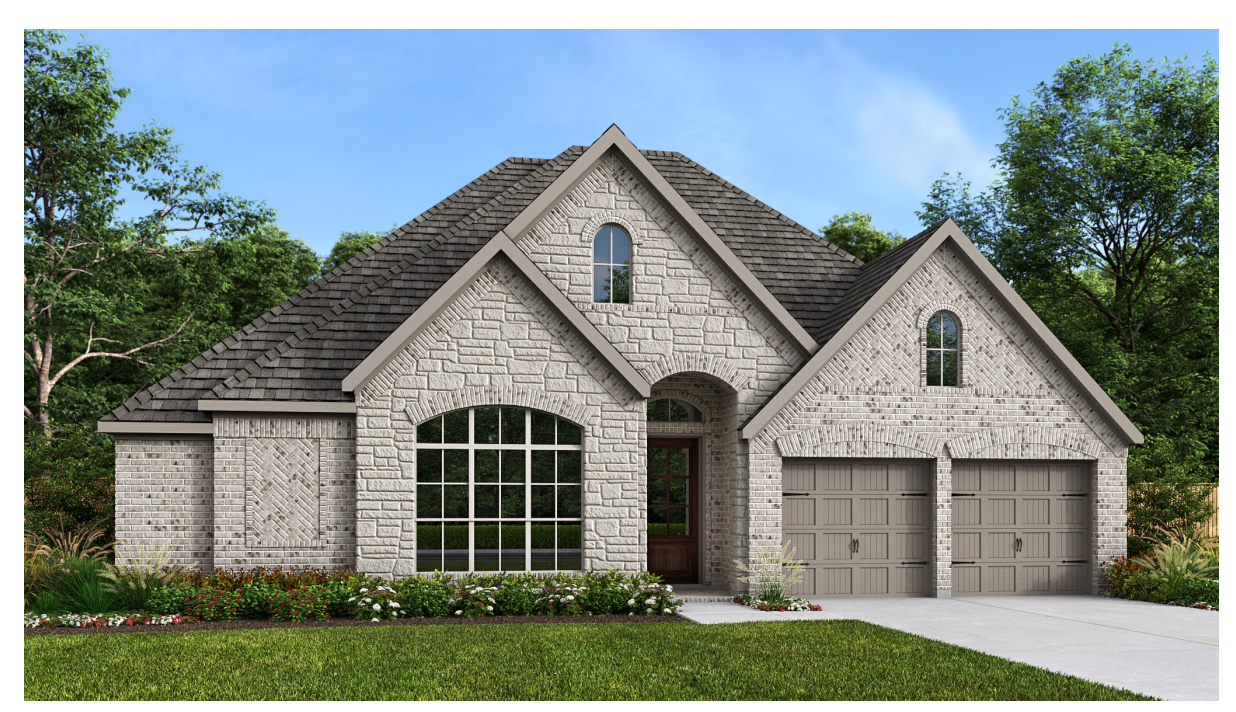
DESIGN 2916W E-30