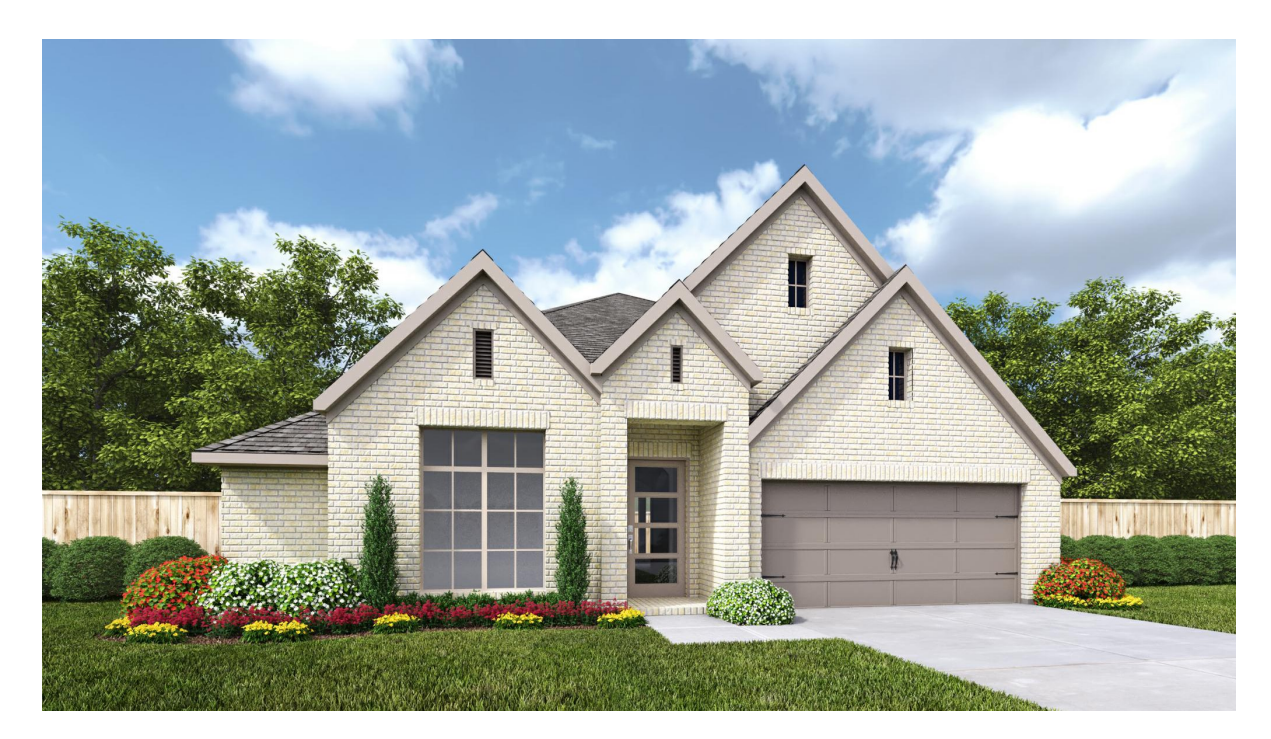
DESIGN 2935P E-1