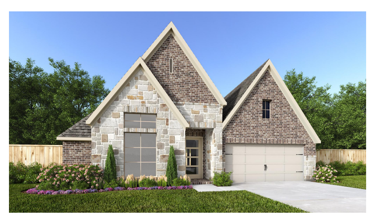
DESIGN 2935P E-71