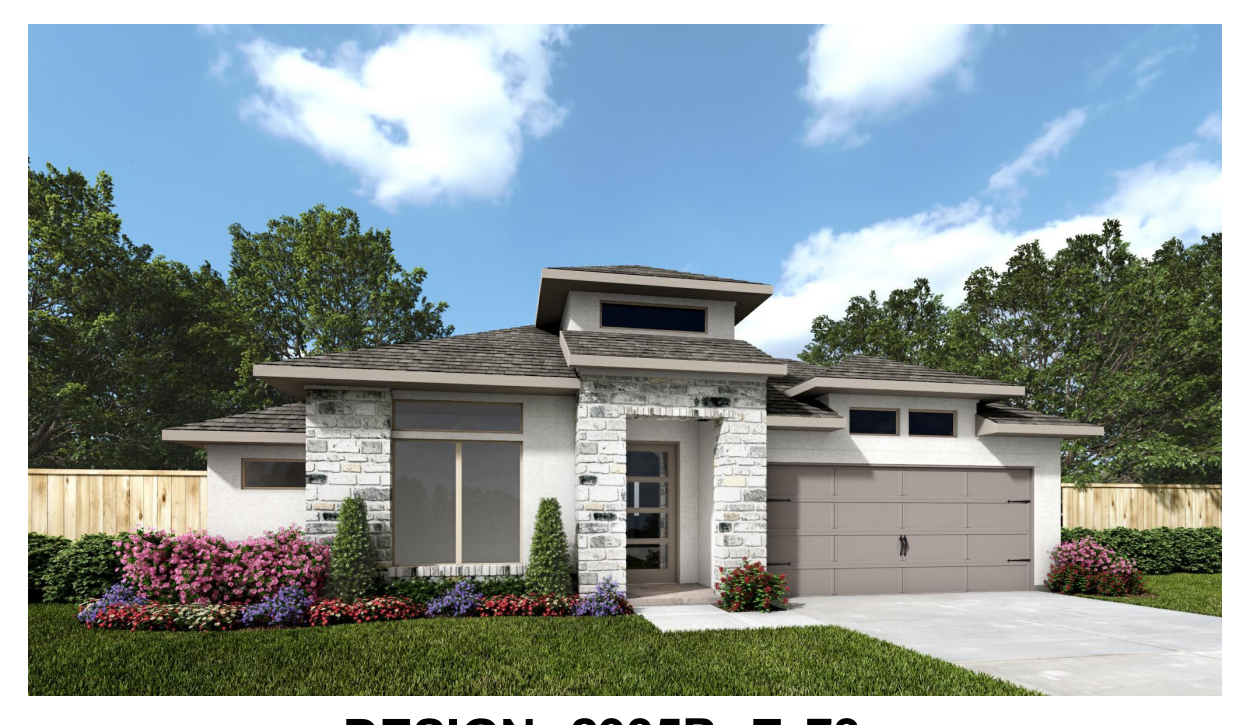
DESIGN 2935P E-73

This design, as originally designed and prior to any changes you make, is estimated to yield approximately the number of square feet shown on page 1. All dimensions are approximate. Square footage may vary based on as-built dimensions, configurations, plan options and/or the method of calculation. Designs are not-to-scale, and are conceptual illustrations that may differ from construction plans or completed improvements. A design may depict features not available on all homesites or in all communities. Perry Homes reserves the right to make changes in plans and specifications, and to substitute material of similar quality. Prices, terms, promotions, plans, dimensions, features, options, amenities, elevations, designs, square footages, specifications, materials, and availability of homes or communities to change without notice or obligation. All obligations will be governed by a written contract. This design does not constitute a commitment to build a particular floor plan or home in any given community. Some floor plans, options, and/or elevations may not be available on certain homesites or in a particular community and may require additional charges. Please check with Perry Homes to verify current offerings in the communities volume considering. This rendering is the property of Perry Homes. LLC. Any reproduction or exhibition is strictly prohibited (@ Perry Homes LLC. 2012).