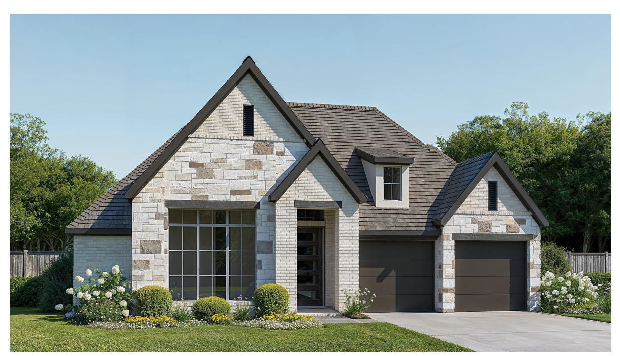
DESIGN 2935W E-55