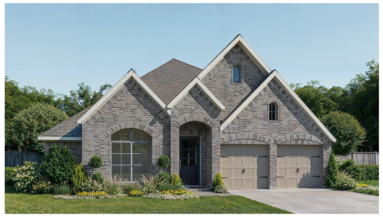
DESIGN 2935W E-1