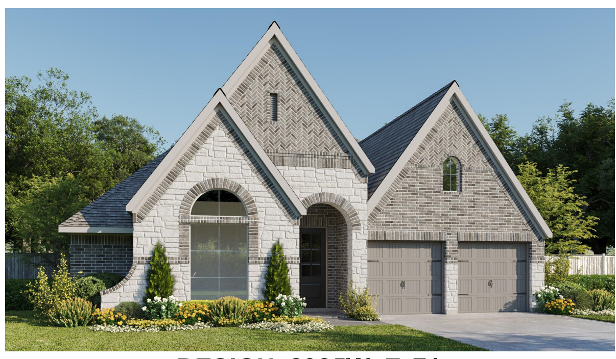
DESIGN 2935W E-71