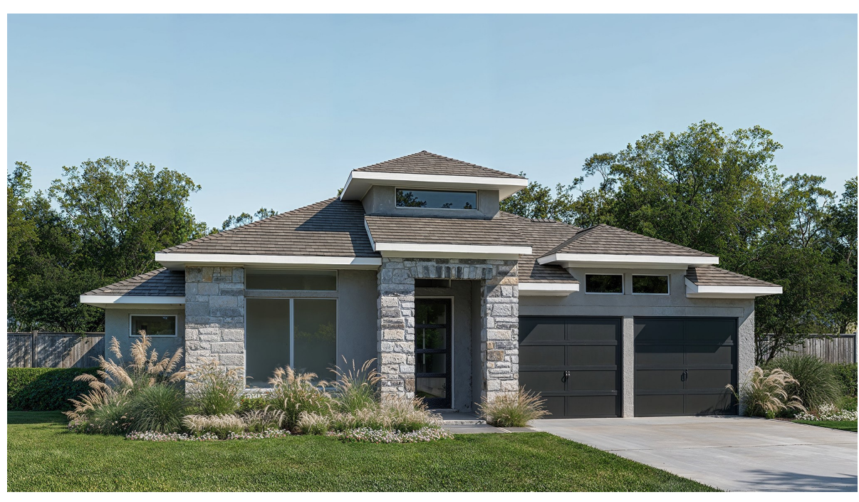
DESIGN 2935W E-73

This design, as originally designed and prior to any changes you make, is estimated to yield approximately the number of square feet shown on page 1. All dimensions are approximate. Square footage may vary based on as-built dimensions, configurations, plan options and/or the method of calculation. Designs are not-to-scale, and are conceptual illustrations that may differ from construction plans or completed improvements. A design may depict features not available on all homesites or in all communities. Perry Homes reserves the right to make changes in plans and specifications, and to substitute material of similar quality. Prices, terms, promotions, plans, dimensions, features, options, amenities, elevations, designs, square footages, specifications, materials, and availability of homes or communities to change without notice or obligation. All obligations will be governed by a written contract. This design does not constitute a commitment to build a particular floor plan or home in any given community. Some floor plans, options, and/or elevations may not be available on certain homesites or in a particular community and may require additional charges. Please check with Perry Homes to verify current offerings in the communities and are considering. This rendering is the property of Perry Homes. LLC. Any reproduction or exhibition is strictly prohibited @ Perry Homes LLC. 2019.