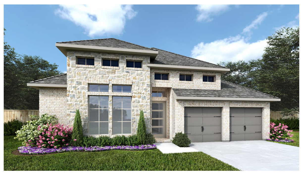
DESIGN 2935W E-72