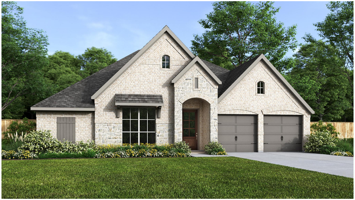
DESIGN 2943W E-31