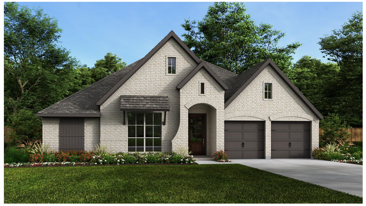
DESIGN 2943W E-1