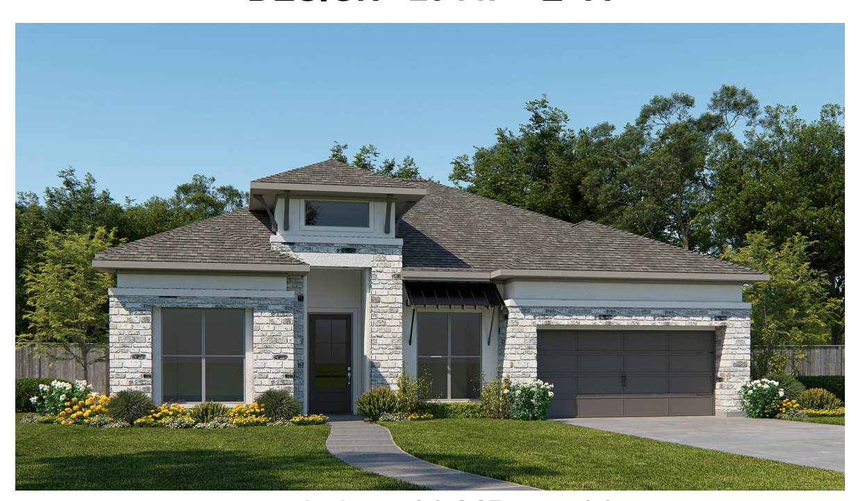
DESIGN 2944P E-90

This design, as originally designed and prior to any changes you make, is estimated to yield approximately the number of square feet shown on page 1. All dimensions are approximate. Square footage may vary based on as-built dimensions, configurations, plan options and/or the method of calculation. Designs are not-to-scale, and are conceptual illustrations that may differ from construction plans or completed improvements. A design may depict features not available on all homesites or in all communities. Perry Homes reserves the right to make changes in plans and specifications, and to substitute material of similar quality. Prices, terms, promotions, plans, dimensions, features, options, amenities, elevations, designs, square footages, specifications, materials, and availability of homes or communities to change without notice or obligation. All obligations will be governed by a written contract. This design does not constitute a commitment to build a particular floor plan or home in any given community. Some floor plans, options, and/or elevations may not be available on certain homesites or in a particular community and may require additional charges. Please check with Perry Homes to verify current offerings in the communities on a green considering. This rendering is the property of Perry Homes. LLC. Any reproduction or exhibition is strictly prohibited @ Perry Homes LLC. 2018