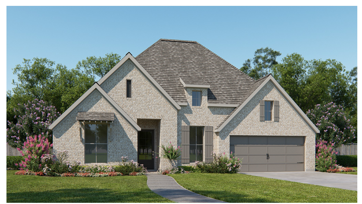
DESIGN 2944P E-1