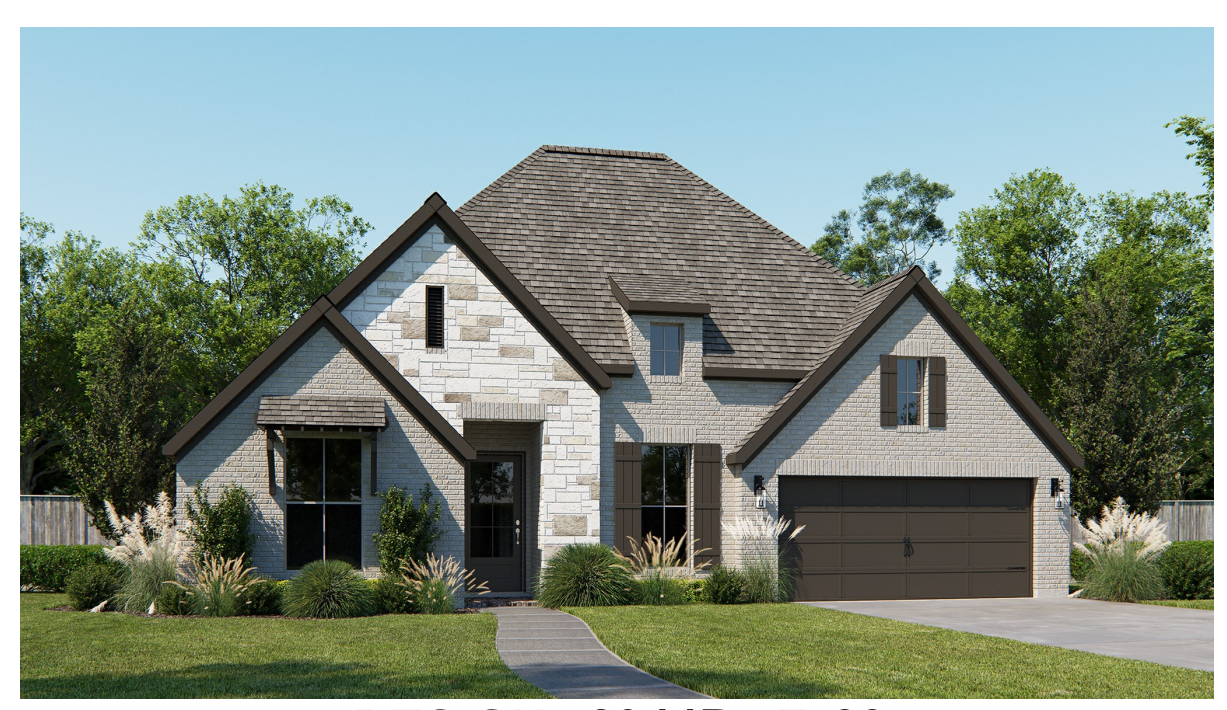
DESIGN 2944P E-33