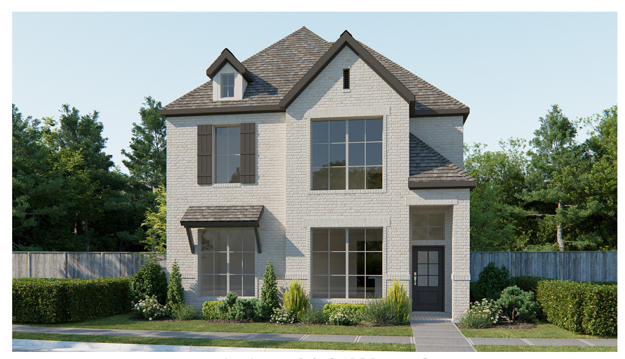
DESIGN 2945W E-1