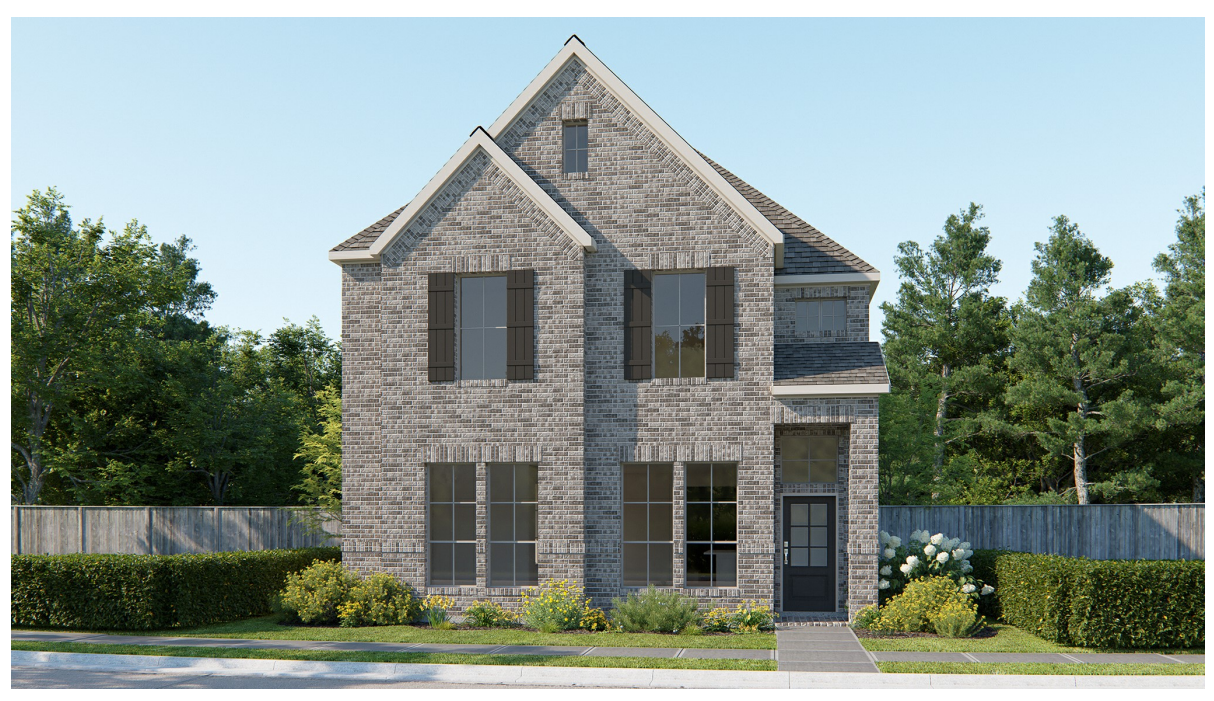
DESIGN 2945W E-30

This design, as originally designed and prior to any changes you make, is estimated to yield approximately the further of square test, solvair of page 1. All dimensions, configurations, plan options and/or the method of calculation. Designs are not-to-scale, and are conceptual illustrations that may differ from construction plans or completed improvements. A design may depict features not available on all homesites or in all communities. Perry Homes reserves the right to make changes in plans and specifications, and to substitute material of similar quality. Prices, terms, promotions, plans, dimensions, features, options, amenities, elevations, designs, square footages, specifications, materials, and availability of homes or communities are subject to change without notice or obligation. All obligations will be governed by a written contract. This design does not constitute a commitment to build a particular floor plan or home in any given community Some floor plans, options, and/or elevations may not be available on certain homesites or in a particular community and may require additional charges. Please check with Perry Homes to verify current offerings in the communities you are considering. This rendering is the property of Perry Homes, LLC. Any reproduction or exhibition is strictly prohibited. © Perry Homes, LLC 2023