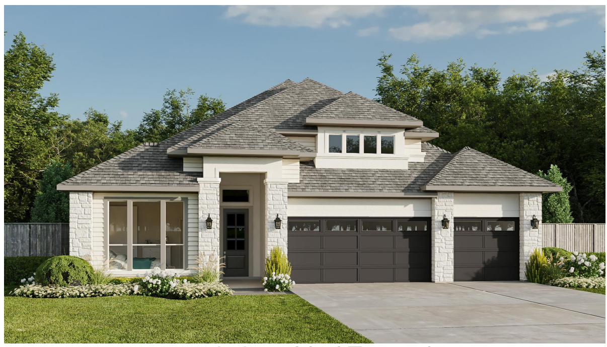
DESIGN 2953E E-50

This design, as originally designed and prior to any changes you make, is estimated to yield approximately the number of square feet shown on page 1. All dimensions are approximate. Square footage may vary based on as-built dimensions, configurations, plan options and/or the method of calculation. Designs are not-to-scale, and are conceptual illustrations that may differ from construction plans or completed improvements. A design may depict features not available on all homesites or in all communities. Perry Homes reserves the right to make changes in plans and specifications, and to substitute material of similar quality. Prices, terms, promotions, plans, dimensions, features, options, amenities, elevations, designs, square footages, specifications, materials, and availability of homes or communities are subject to change without notice or obligation. All obligations will be governed by a written contract. This design does not constitute a commitment to build a particular floor plan or home in any given community Some floor plans, options, and/or elevations may not be available on certain homesites or in a particular community and may require additional charges. Please check with Perry Homes to verify current offerings in the communities are considering. This rendering is the property of Perry Homes. LLC. Any reproduction or exhibition is strictly prohibited @ Perry Homes LLC. 2022