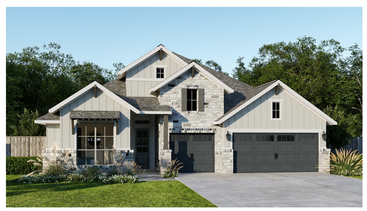
DESIGN 2953E E-1