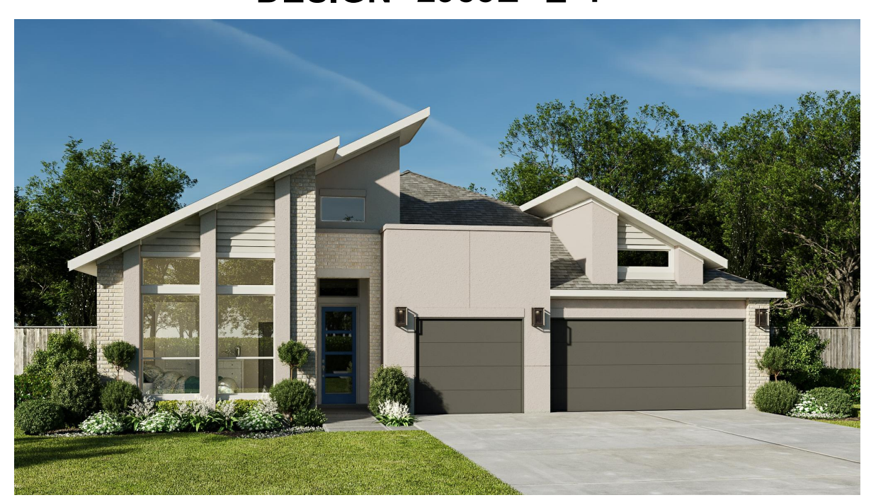
DESIGN 2953E E-30