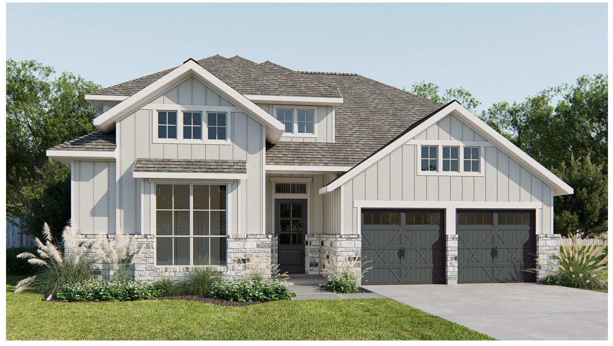
DESIGN 2969E E-1