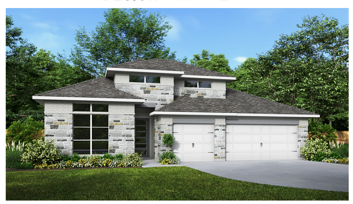
DESIGN 2984V E-50