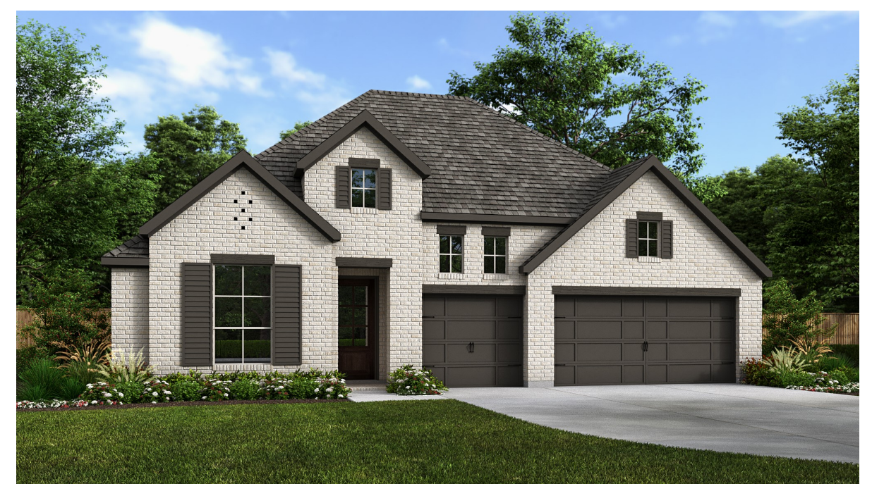
DESIGN 2984V E-1