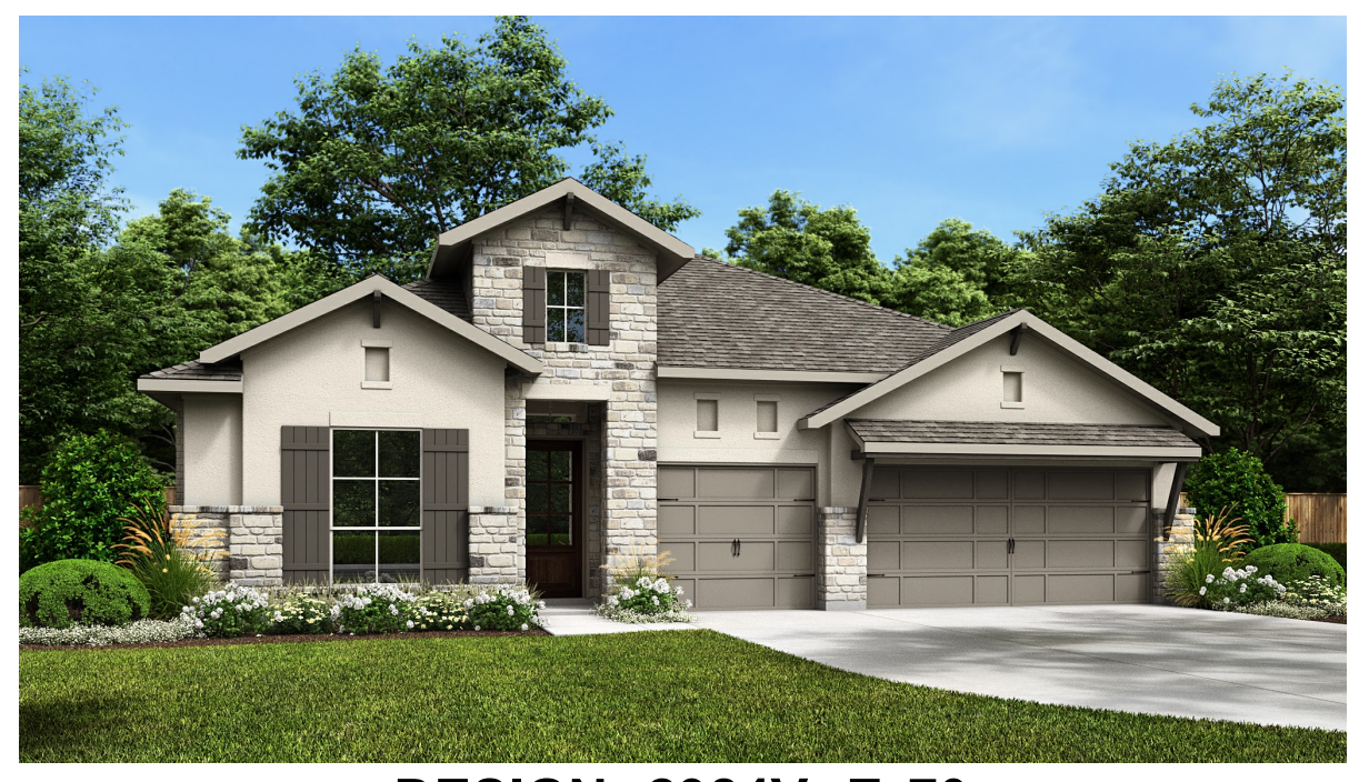
DESIGN 2984V E-70

This design, as originally designed and prior to any changes you make, is estimated to yield approximately the number of square feet shown on page 1. All dimensions are approximate. Square footage may vary based on as-built dimensions, configurations, plan options and/or the method of calculation. Designs are not-to-scale, and are conceptual illustrations that may differ from construction plans or completed improvements. A design may depict features not available on all homesites or in all communities. Perry Homes reserves the right to make changes in plans and specifications, and to substitute material of similar quality. Prices, terms, promotions, plans, dimensions, features, options, amenities, elevations, designs, square footages, specifications, materials, and availability of homes or communities to change without notice or obligation. All obligations will be governed by a written contract. This design does not constitute a commitment to build a particular floor plan or home in any given community. Some floor plans, options, and/or elevations may not be available on certain homesites or in a particular community and may require additional charges. Please check with Perry Homes to verify current offerings in the communities and are considering. This rendering is the property of Perry Homes. LLC. Any reproduction or exhibition is strictly prohibited @ Perry Homes LLC. 2018